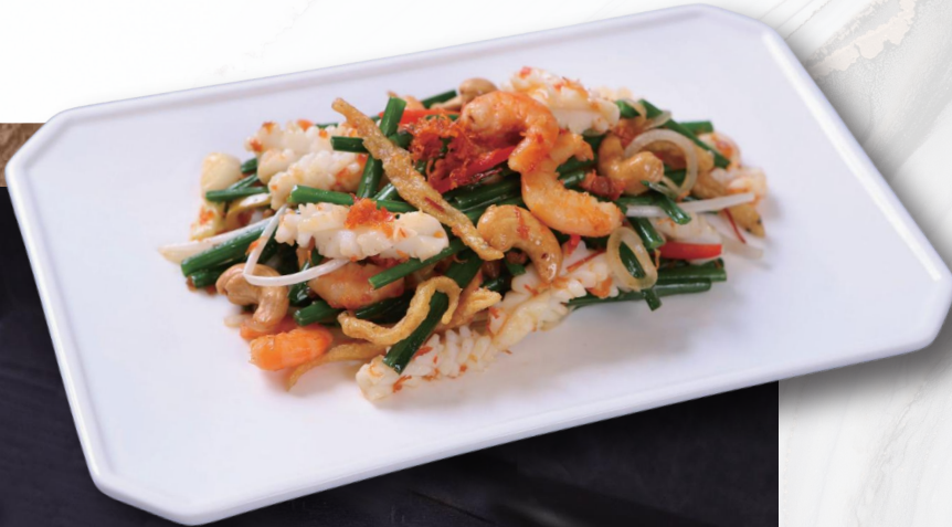
Stir-fried Seafood with Chinese Chives