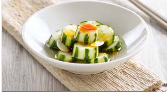
蒜香日本青瓜 Chilled Japanese Cucumber with Garlic $9.80