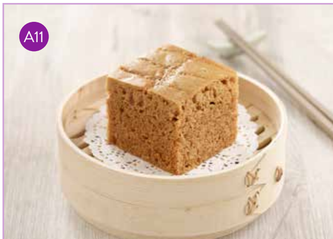
香滑黑糖马来糕 Steamed Black Sugar Sponge Cake $6.90