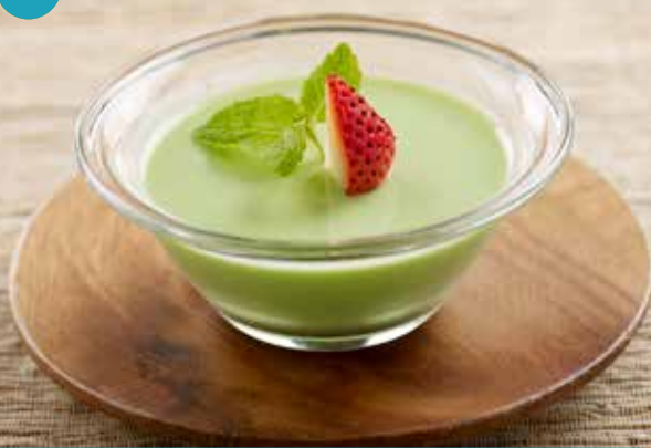
牛油果布丁 Avocado Pudding $6.80