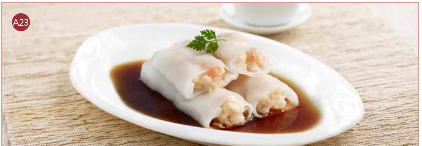
叉烧蒸肠粉 Steamed Rice Roll with BBQ Pork Filling $8.90