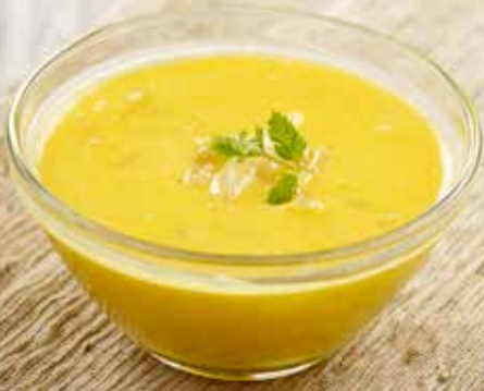
杨枝甘露 Mango Purée with Sago and Pomelo $6.80