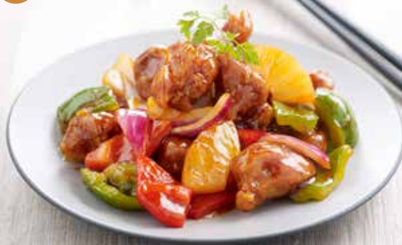
咕嚕肉 Sweet and Sour Pork $19.80