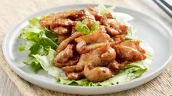
豉油皇炒猪颈肉 Wok-fried Tender Pork Collar with Supreme Soya Sauce $20.80