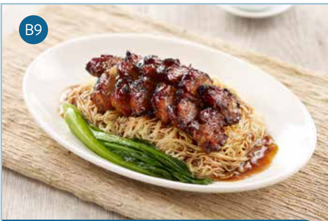
秘制黑叉烧面 (汤/捞) Charred BBQ Pork Noodle (Soup/Dry) $16.50