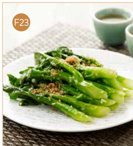
蒜茸炒芥兰 Stir-fried Kai Lan with Minced Garlic $16.80