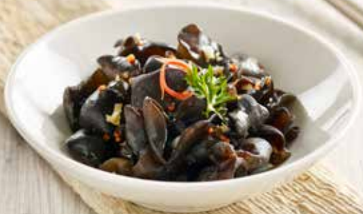
清爽黑云耳 Chilled Black Fungus with Minced Garlic and Chilli $9.80