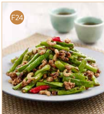
榄菜四季豆 Stir-fried French Bean with Minced Pork and Preserved Olive Vegetable (Contains Prawn) $18.80