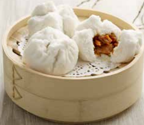
蚝皇叉烧包 Steamed BBQ Honey Pork Bun (3pc) $7.90