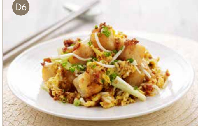
XO酱炒萝卜糕 Wok-fried Carrot Cake in XO Sauce (Contains Prawn) $15.20