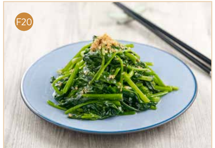
蒜茸炒菠菜 Stir-fried Spinach with Minced Garlic $16.30