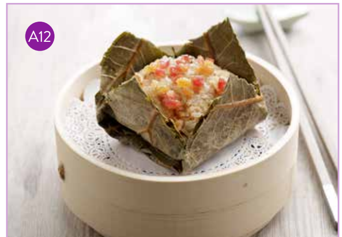
珍珠糯米鸡 Steamed Glutinous Rice with Chicken Wrapped in Lotus Leaf (1pc) (Contains Prawn) $7.80