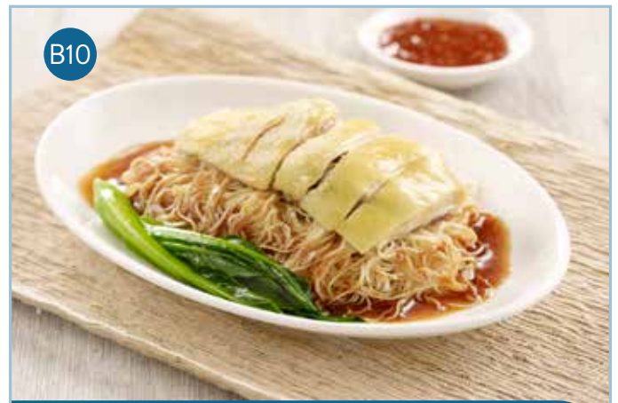
水晶真味鸡面 (汤/捞)* Steamed Kampong Chicken in Canton Style Noodle (Soup/Dry) $16.50