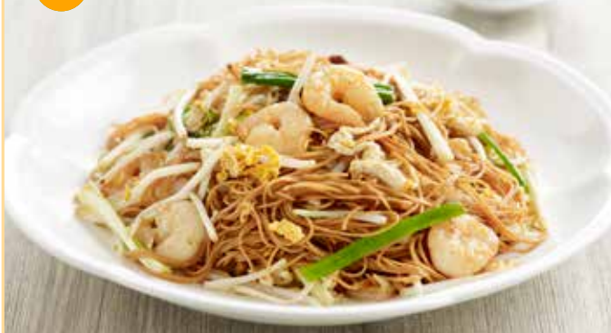
家乡炒面线 Wok-fried Traditional Hometown Vermicelli (Contains Prawn) $19.30