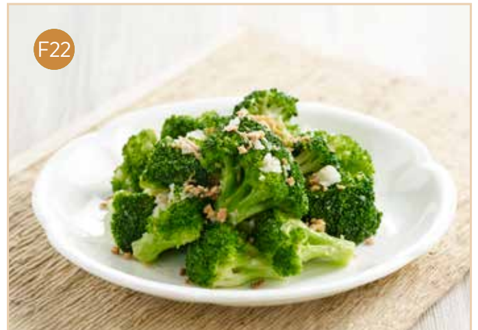
蒜茸炒西兰花 Stir-fried Broccoli with Minced Garlic $16.80