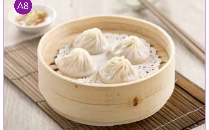
上海小笼包 Steamed Xiao Long Bao (4pc) $8.60