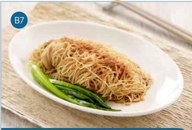
虾籽捞面 Shrimp Roe Noodle (Dry) $10.80