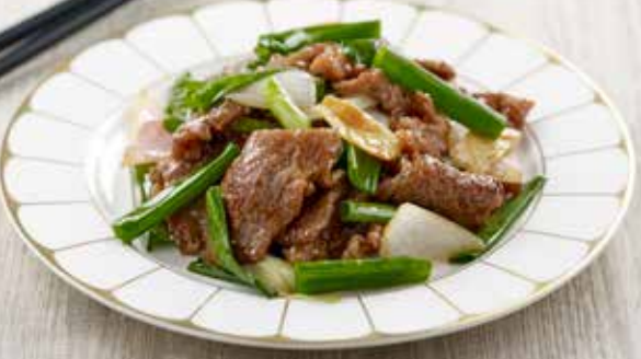
姜葱炒肥牛 Stir-fried Sliced Marbled Beef with Ginger and Spring Onion $27.80