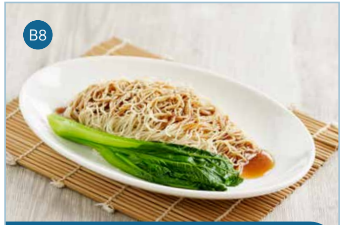
全蛋银丝面 (汤/捞) Plain Noodle (Soup/Dry) $7.90