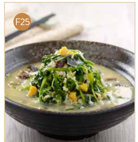
肉碎上汤金银蛋苋菜 Poached Chinese Spinach with Trio Egg and Minced Pork $18.30