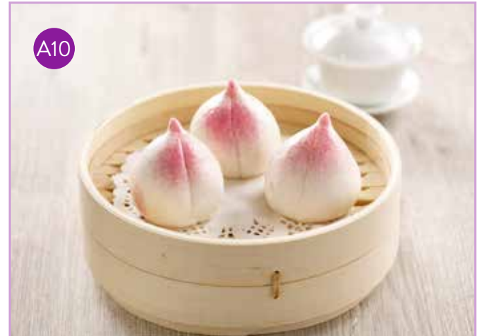
南瓜子莲蓉迷你寿桃 Lotus Seed Paste with Pumpkin Seed Longevity Bun (3pc) $7.30