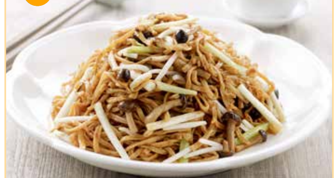
虾籽焖伊面 Stewed Ee-Fu Noodle with Shrimp Roe $18.80