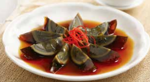
烧椒皮蛋 Century Egg with Vinaigrette and Chilli Oil $9.80