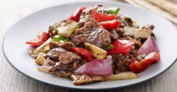
黑椒炒肥牛 Stir-fried Sliced Marbled Beef with Black Pepper $27.80