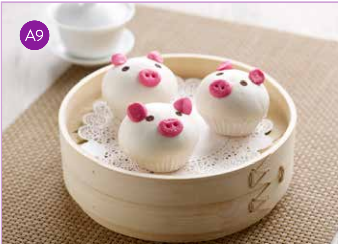
猪仔流沙包 Steamed Molten Salted Egg Yolk Custard Piggy Bun (3pc) $8.90