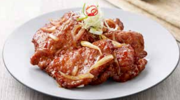
京都排骨王 Imperial Sweet and Sour Pork Rib $20.80