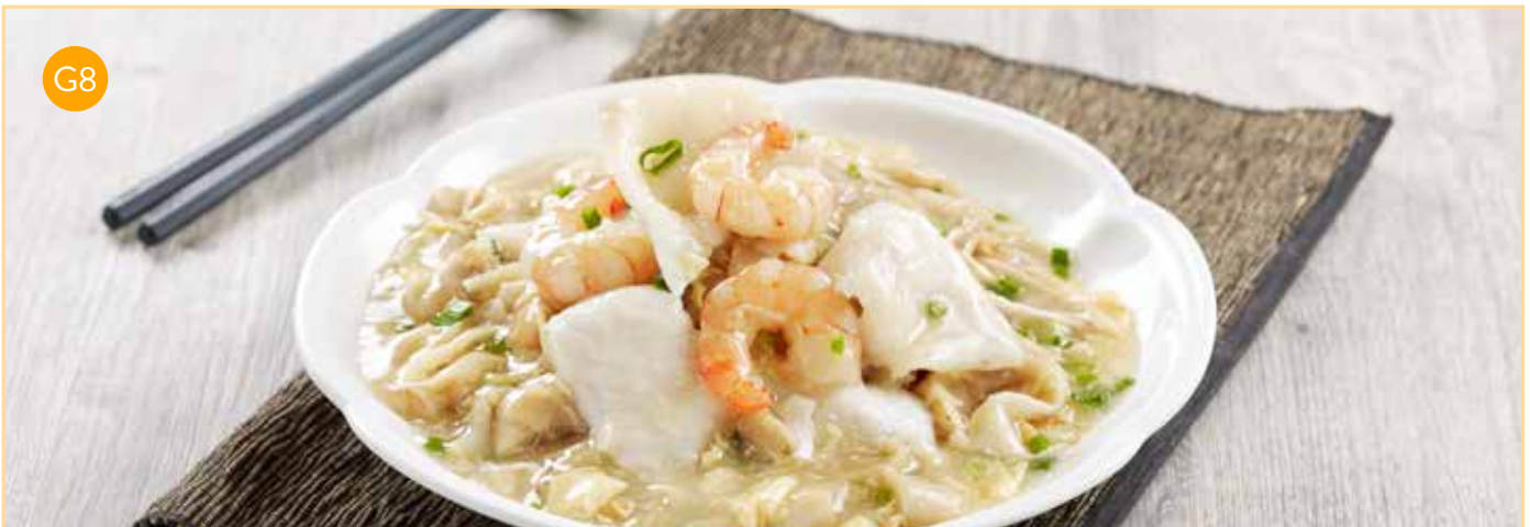
海鲜滑蛋河粉 Braised Hor Fun with Seafood and Scrambled Egg (Contains Prawn) $20.30