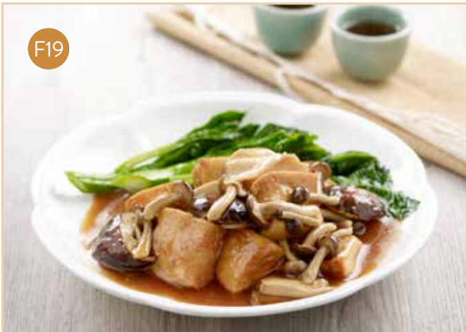
野菌焖豆腐 Braised Firm Tofu with Assorted Mushroom $19.30