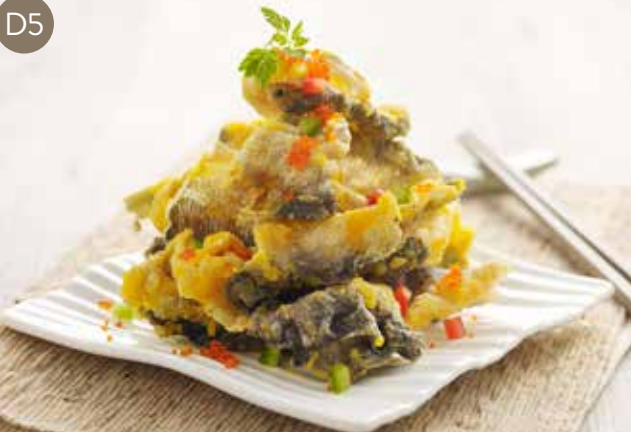
酥炸咸蛋鱼皮 Crisp-fried Fish Skin with Salted Egg Yolk $15.80