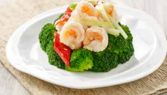
油泡虾球西兰花 Stir-fried Crystal Prawn and Broccoli $31.80