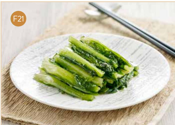
清炒油麦菜 Stir-fried Local Lettuce $16.30