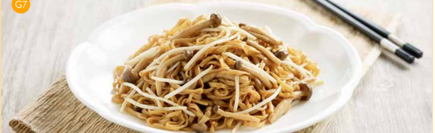
干烧伊面 Stewed Ee-Fu Noodle $18.80