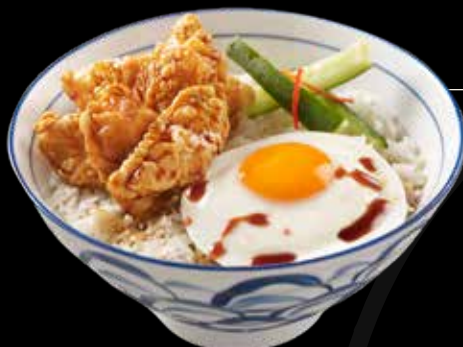
F5 Garlic Honey Soy Crispy White Tuna Garlic Rice Bowl