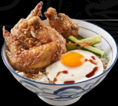
F3 Garlic Honey Soy Chicken Wing Garlic Rice Bowl