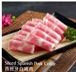
Sliced Spanish Pork Collar 西班牙白猪肉