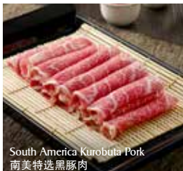
South America Kurobuta Pork 南美特选黑豚肉