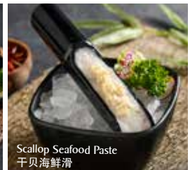
Scallop Seafood Paste 干贝海鲜滑

Pictures are for illustration purposes only.