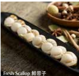
Fresh Scallop 鲜带子