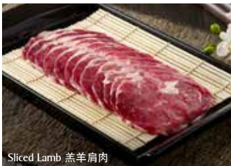
Sliced Lamb 羔羊肉片