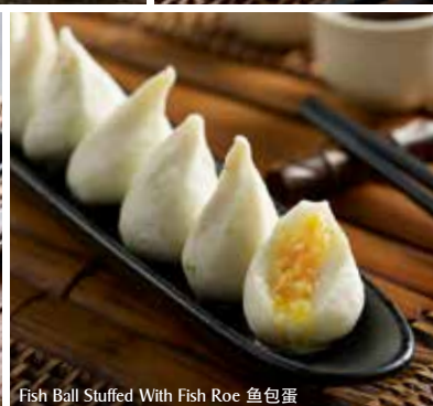
Fish Ball Stuffed With Fish Roe 鱼包蛋