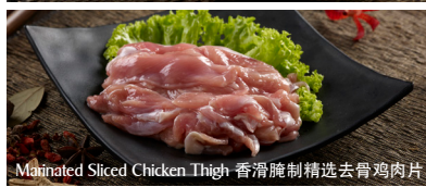
Marinated Sliced Chicken Thigh 香滑腌制精选去骨鸡肉片