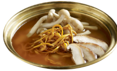
Cordyceps Flower with Mushroom Soup Base (Vegetarian) 虫草花珍菌汤底