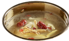
Herbal Chicken Soup Base 药材鸡汤底