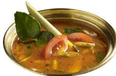
Tom Yum Soup Base 泰式冬炎汤底