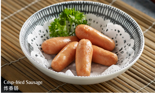
Crisp-fried Sausage 炸香肠