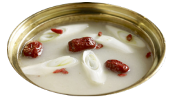
Authentic Pork Bone Soup Base 正宗猪骨汤底