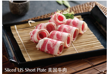
Sliced US Short Plate 美国牛肉