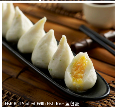
Fish Ball Stuffed With Fish Roe 鱼包蛋