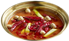
Spicy Szechuan Soup Base 四川麻辣汤底

Each set entitled for one soup base selection only 每人可选一种汤底