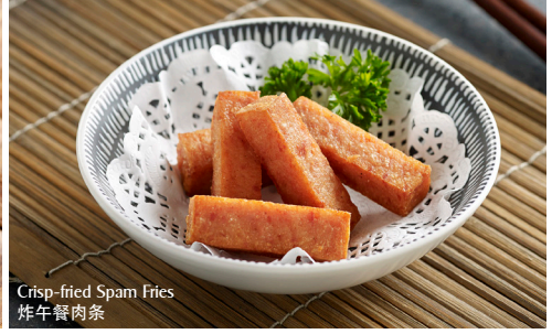
Crisp-fried Spam Fries 炸午餐肉条