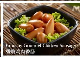
Crunchy Gourmet Chicken Sausage 香脆鸡肉香肠