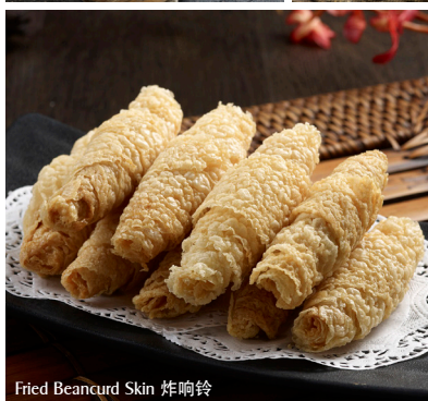
Fried Beancurd Skin 炸响铃