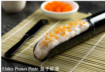
Ebiko Prawn Paste 鱼子虾滑