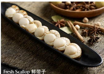
Fresh Scallop 鲜带子