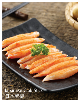
Japanese Crab Stick 日本蟹柳