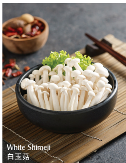
White Shimeji 白玉菇