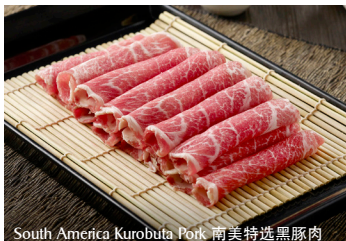
South America Kurobuta Pork 南美特选黑豚肉