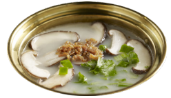
Teochew Style Soup Base 正宗潮州汤底

Terms and Conditions: Valid for dine-in only • Prices are in accordance to Value or Premium menu at respective seating time • Dining duration is 80 minutes based on time of seating, last order will be 20 minutes before end of dining time • Each All-You-Can-Eat set is inclusive of selection of one soup base, free-flow homemade drinks at drinks counter and unlimited snacks and condiments from condiments counter • Surcharge of $3 per person applies during weekends and Public Holidays • Add-on orders will be charged at à la carte prices • All diners seated at the same table are required to select the same menu • Food wastage will be charged at $10 per 100gram • Student and senior citizen discounts are only valid from Mondays to Fridays before 4.30pm, excluding Public Holidays • Present valid student pass or senior citizen card to entitle discount • Child discount is valid for children between 5-12 years old, children below the age of 5 dine for free • Discount given is before surcharge, service charge and prevailing GST • Student, senior citizen and child discounts are not valid in conjunction with other discounts, promotions or vouchers • Prices are subject to service charge and prevailing GST • Items are available while stocks last • Management reserves the right to amend terms and conditions of the promotion without prior notice.