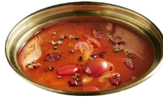
Spicy Mala Tomato Soup Base 麻辣番茄汤底