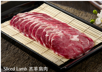
Sliced Lamb 羔羊肩肉