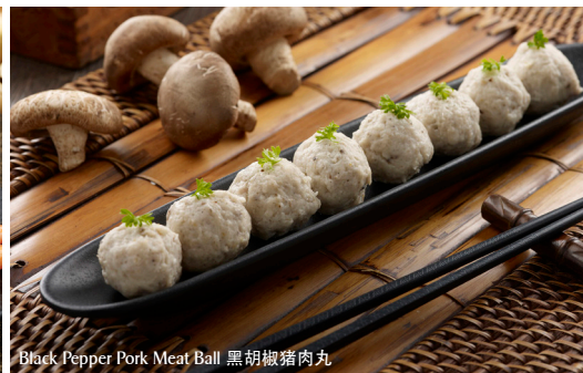
Black Pepper Pork Meat Ball 黑胡椒猪肉丸