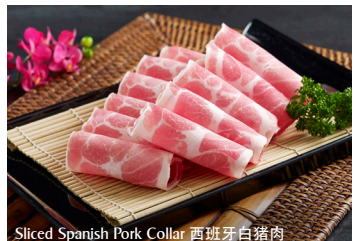
Sliced Spanish Pork Collar 西班牙白猪肉

Pictures are for illustration purposes only