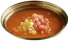
Tomato with Sweet Corn Soup Base 维他命C番茄玉米汤底