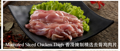
Marinated Sliced Chicken Thigh 香滑腌制精选去骨鸡肉片