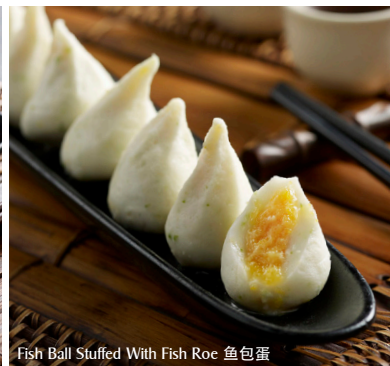
Fish Ball Stuffed With Fish Roe 鱼包蛋