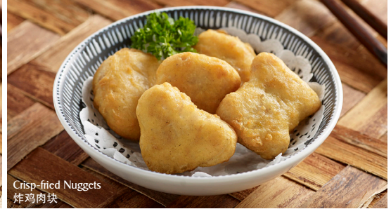
Crisp-fried Nuggets 炸鸡肉块