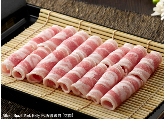
Sliced Brazil Pork Belly 巴西嫩猪肉 (花肉)