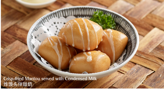
Crisp-fried Mantou served with Condensed Milk 炸馒头伴甜奶