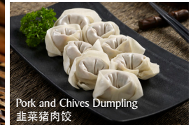
Pork and Chives Dumpling 韭菜猪肉饺