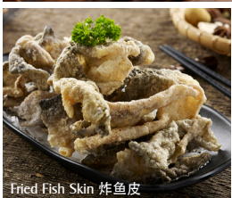
Fried Fish Skin 炸鱼皮