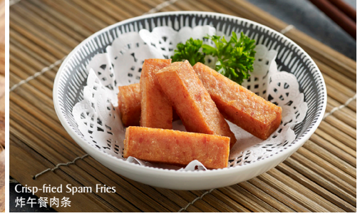
Crisp-fried Spam Fries 炸午餐肉条