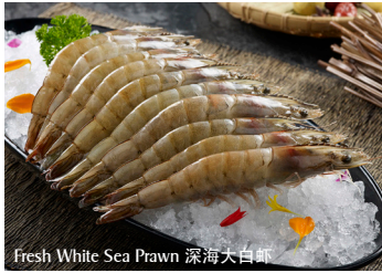
Fresh White Sea Prawn 深海大白虾