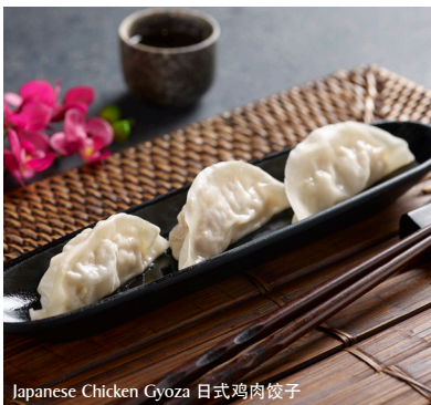
Japanese Chicken Gyoza 日式鸡肉饺子