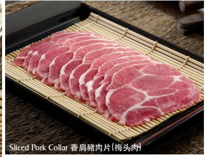
Sliced Pork Collar 香肩猪肉片 (梅头肉)