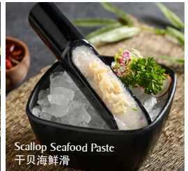
Scallop Seafood Paste 干贝海鲜滑

Pictures are for illustration purposes only.