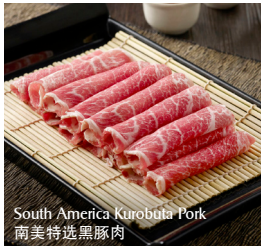
South America Kurubuta Pork 南美特选黑豚肉