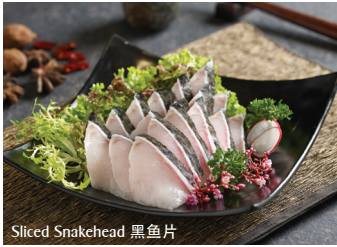
Sliced Snakehead 黑鱼片