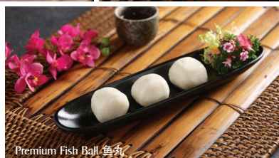
Premium Fish Ball 鱼丸