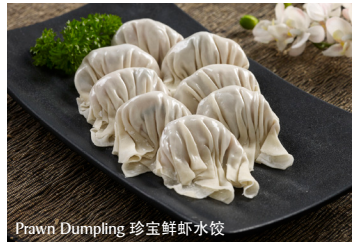
Prawn Dumpling 珍宝鲜虾水饺