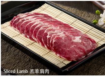
Sliced Lamb 羔羊肩肉