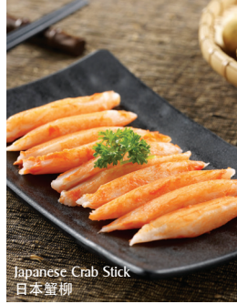
Japanese Crab Stick 日本蟹柳