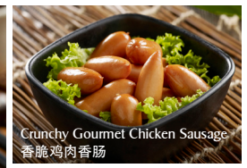
Crunchy Gourmet Chicken Sausage 香脆鸡肉香肠