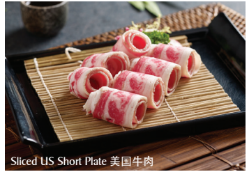
Sliced US Short Plate 美国牛肉