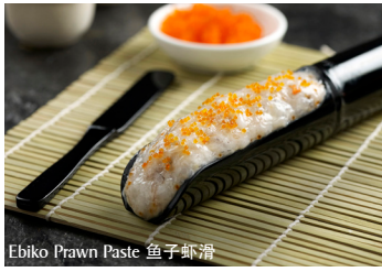
Ebiko Prawn Paste 鱼子虾滑