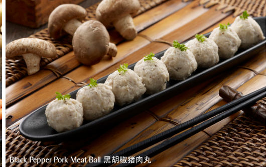
Black Pepper Pork Meat Ball 黑胡椒猪肉丸