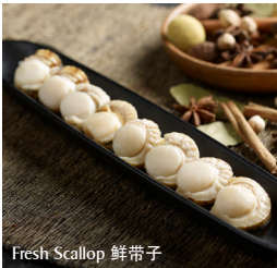
Fresh Scallop 鲜带子