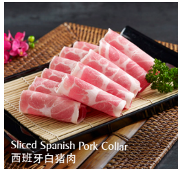
Sliced Spanish Pork Collar 西班牙白猪肉