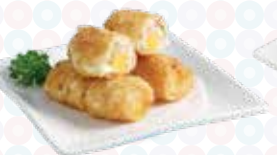
酥脆香芒虾卷 Crispy Prawn and Mango Fritter $8.60 ( )