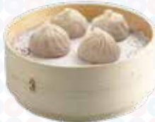
上海小籠包 Steamed Xiao Long Bao (4pc) $7.60 ( )