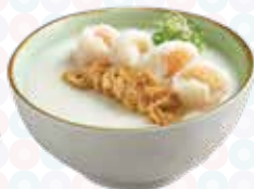
鲜虾粥 Fresh Prawn Congee $14.30 ( )