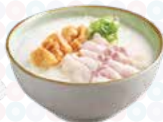
鱼片粥 Sliced Fish Congee $13.30 ( )