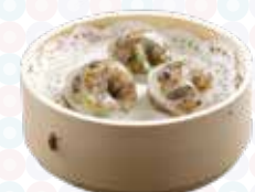
黑松露野菌餃 Steamed Mushroom and Truffle Dumpling (3pc) $10.30 ( )