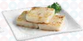
腊味萝卜糕 Pan-fried Radish Cake (3pc) $6.60 ( )