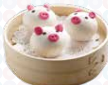
豬仔流沙包 Steamed Molten Salted Egg Yolk Custard Piggy Bun (3pc) $8.30 ( )