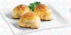
蜜汁叉烧酥 Baked BBQ Pork Pastry (3pc) $8.30 ( )