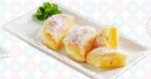
黄金奶黄酥 Baked Golden Custard Pastry (3pc) $8.30 ( )