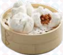
蚝皇叉燒包 Steamed BBQ Honey Pork Bun (3pc) $7.30 ( )