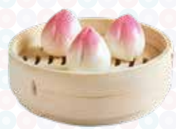
南瓜子蓮蓉迷你壽桃 Lotus Seed Paste with Pumpkin Seed Longevity Bun (3pc) $6.60 ( )