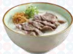
生滚牛肉粥 Sliced Beef Congee $12.80 ( )