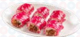
脆网叉烧肠粉 Crispy Rice Roll with BBQ Pork Filling $8.90 ( )