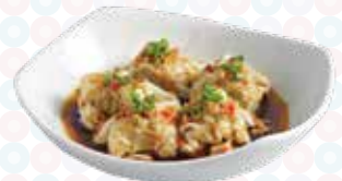
紅油抄手 Pork Wonton in Chilli Vinaigrette (5pc) $8.30 ( )