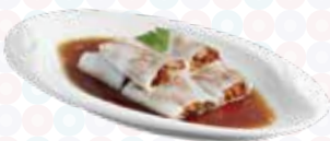
叉烧蒸肠粉 Steamed Rice Roll with BBQ Pork Filling $7.60 ( )