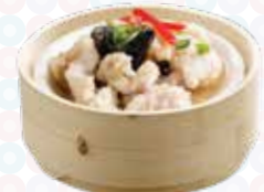
豉蒜蒸排骨 Steamed Spare Rib with Black Bean Sauce and Minced Garlic $6.60 ( )