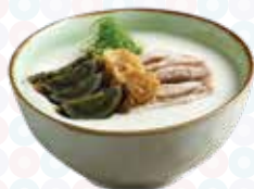
皮蛋煲肉粥 Century Egg and Shredded Pork Congee $10.30 ( )