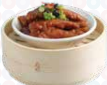
豉汁蒸鳳爪 Steamed Chicken Claw with Black Bean Sauce $6.60 ( )