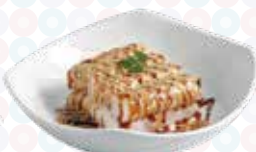
香港车仔街边肠粉 Hong-Kong Street Style Steamed Rice Rolls with Sweet and Peanut Sauce $6.20 ( )