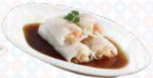
鲜虾蒸肠粉 Steamed Rice Roll with Fresh Prawn Filling $8.20 ( )