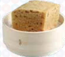
香滑黑糖馬來糕 Steamed Black Sugar Sponge Cake $5.60 ( )