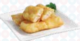
鲜虾腐皮卷 Beancurd Skin Prawn Fritter $8.60 ( )