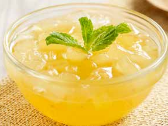
芦荟酸柑梅子冻 Chilled Aloe Vera with Lime Juice and Sour Plum $5.30