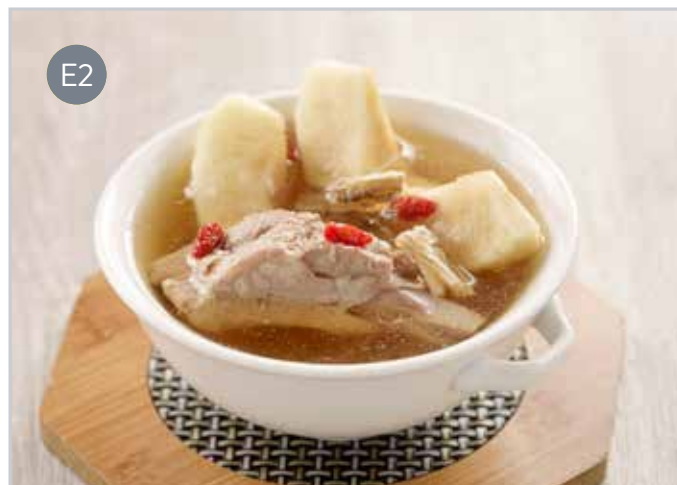
雪梨排骨汤 Double-boiled Superior Pear and Pork Rib Soup $14.30