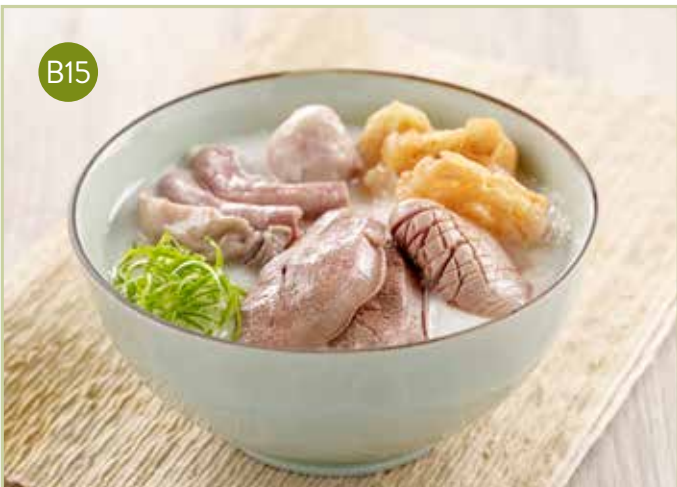
状元及第粥 Mixed Pig's Organ Congee $11.80