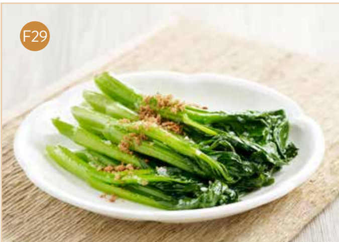
蒜蓉炒菜心 Stir-fried Cai Xin with Minced Garlic $14.80