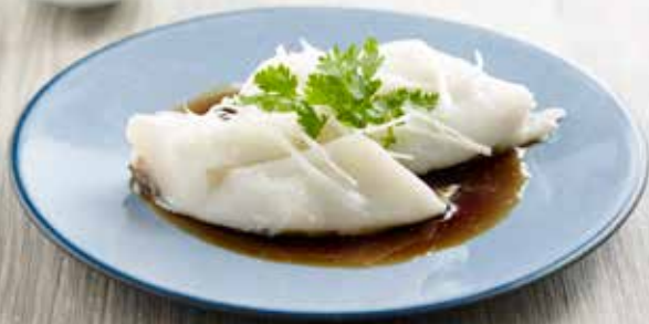
清蒸鲽鱼 Steamed Flounder in Hong Kong Style $27.80