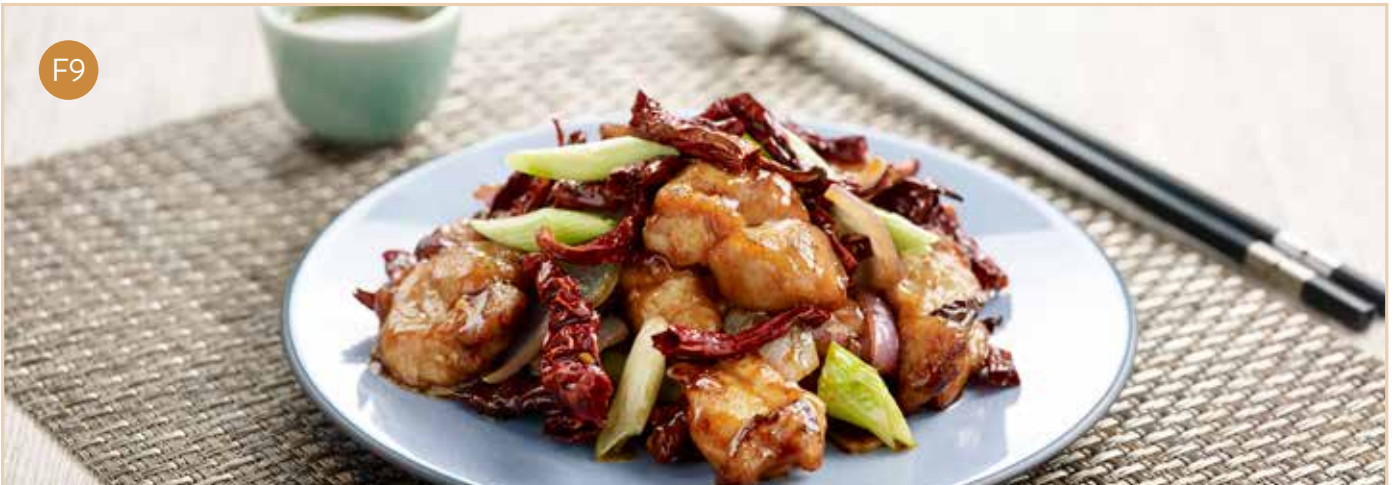
宫保鸡柳 Stir-fried Gong Bao Chicken Fillet $17.80