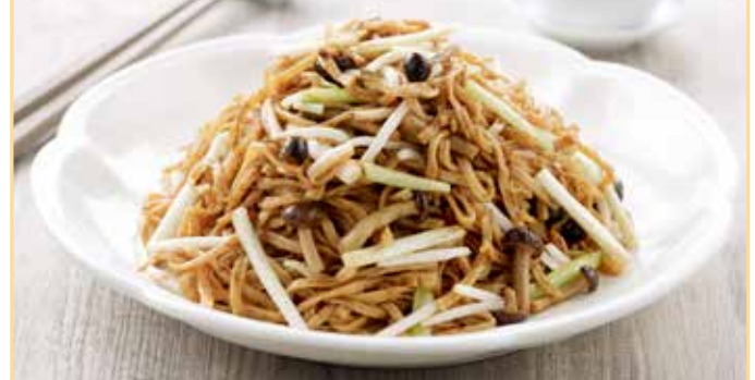
虾籽焖伊面 Stewed Ee-Fu Noodle with Shrimp Roe $15.80