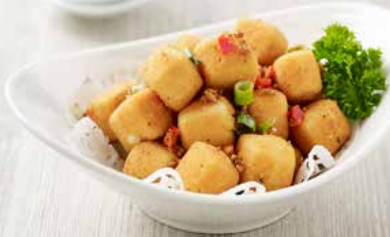
脆皮椒盐豆腐 Crisp-fried Tofu with Salt and Pepper $11.30