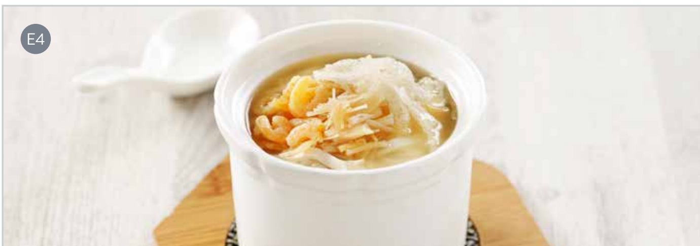
鱼鳔豆腐羹 Dried Fish Maw with Tofu Thick Soup $13.30