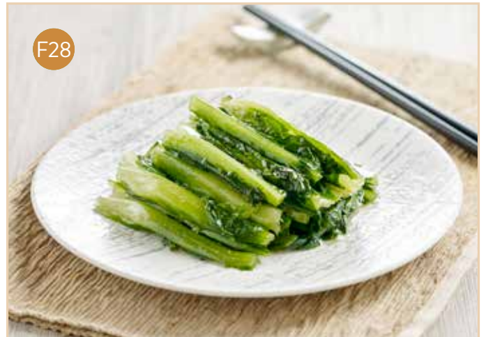
清炒油麦菜 Stir-fried Local Lettuce $14.80