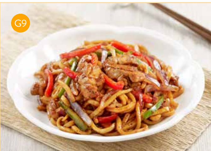
黑椒鸡柳炒乌冬面 Wok-fried Udon with Black Pepper Chicken Fillet $16.80