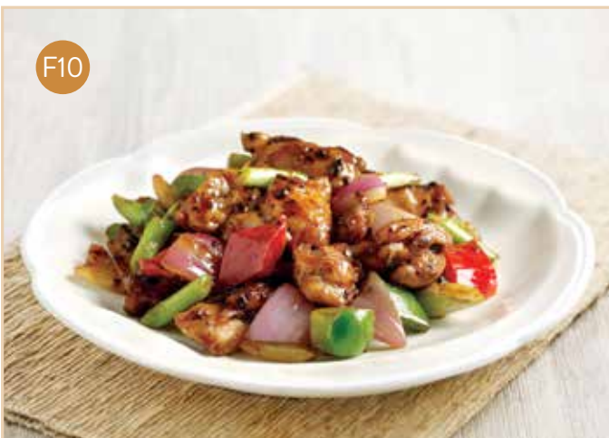
豉椒鸡柳 Stir-fried Chicken Fillet with Black Bean Sauce $17.80