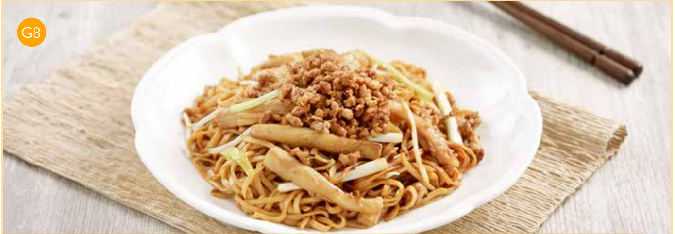
XO酱茄子焖伊面 Stewed Ee-fu Noodle with Eggplant in XO Sauce $16.80