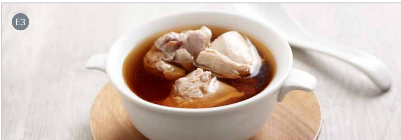
清炖鸡汤 Double-boiled Superior Chicken Soup $13.30