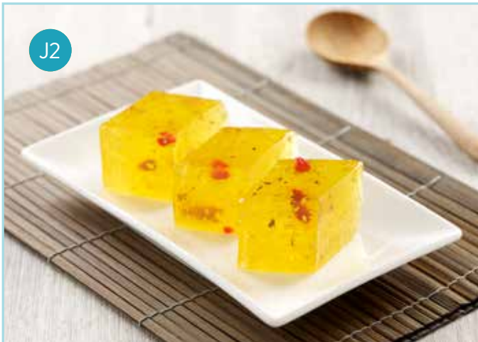
桂花糕 Osmanthus Cake $5.80