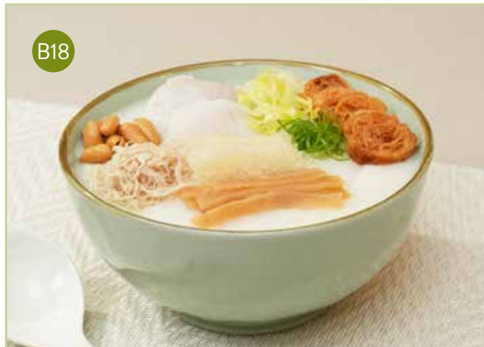
荔湾艇仔粥 'Ting Zai' Style Congee $11.80