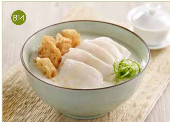
鱼片粥 Sliced Fish Congee $13.30