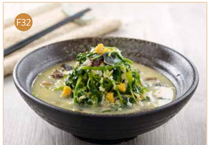
肉碎上汤金银蛋苋菜 Poached Chinese Spinach with Trio Egg and Minced Pork $16.80