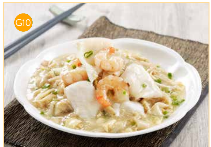
海鲜滑蛋河粉 Braised Hor Fun with Seafood and Scrambled Egg $17.80