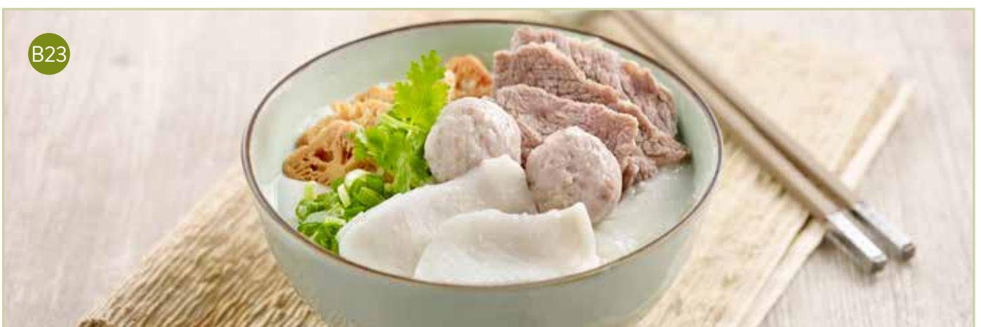
双拼粥* Duo Combination Congee $12.80