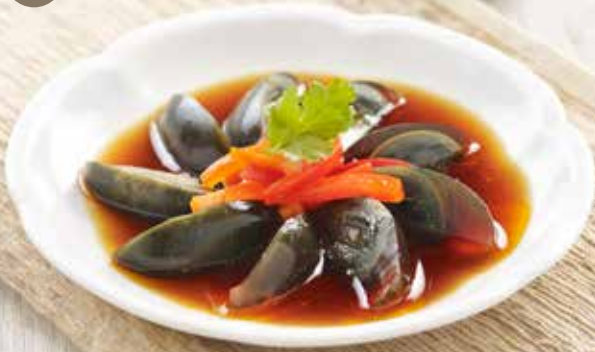
烧椒皮蛋 Century Egg with Vinaigrette and Chilli Oil $8.30