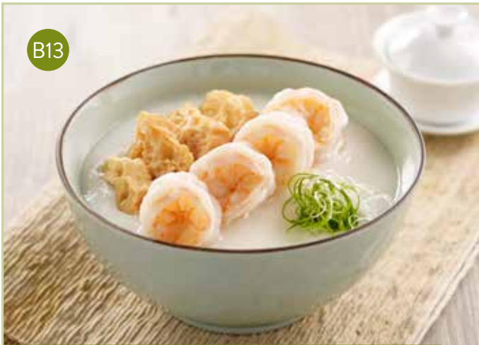
鲜虾球粥 Fresh Prawn Congee $14.30