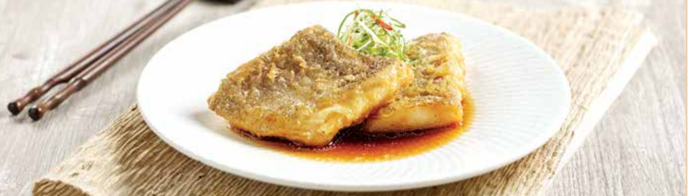
油浸鲽鱼 Crisp-fried Flounder with Supreme Soya Sauce $27.80