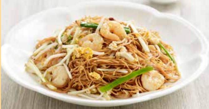
家乡炒面线 Wok-fried Traditional Hometown Vermicelli $15.80