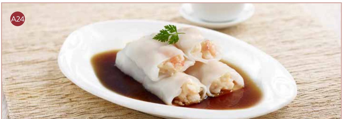
叉烧蒸肠粉 Steamed Rice Roll with BBQ Pork Filling $7.60