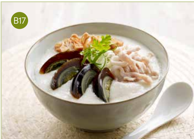
皮蛋爽肉粥 Century Egg and Shredded Pork Congee $10.30