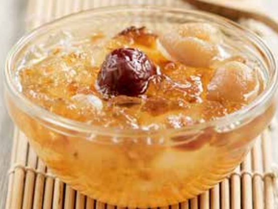
银耳炖桃胶 (热/冷) Double-boiled Peach Resin (Hot/Cold) $5.80