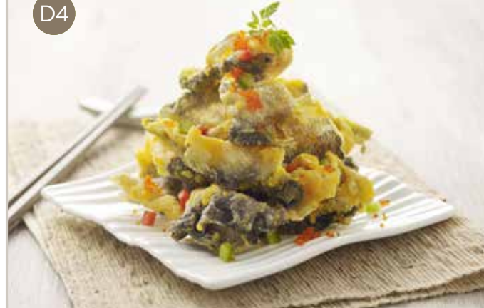
酥炸咸蛋鱼皮 Crisp-fried Fish Skin with Salted Egg Yolk $13.80