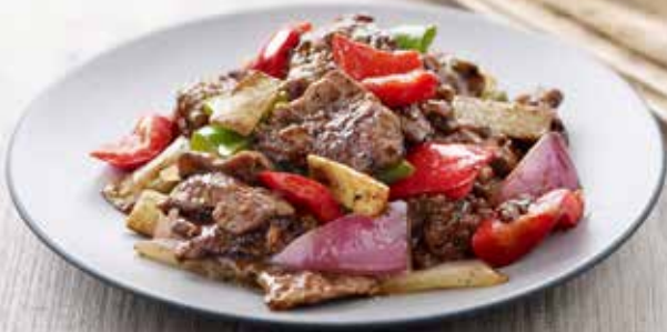
黑椒炒肥牛 Stir-fried Sliced Marbled Beef with Black Pepper $22.80