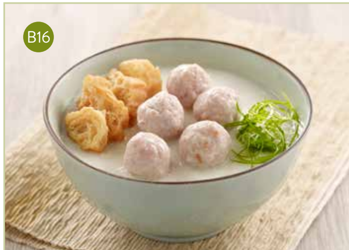
爽滑肉丸粥 Handmade Meatball Congee $11.80