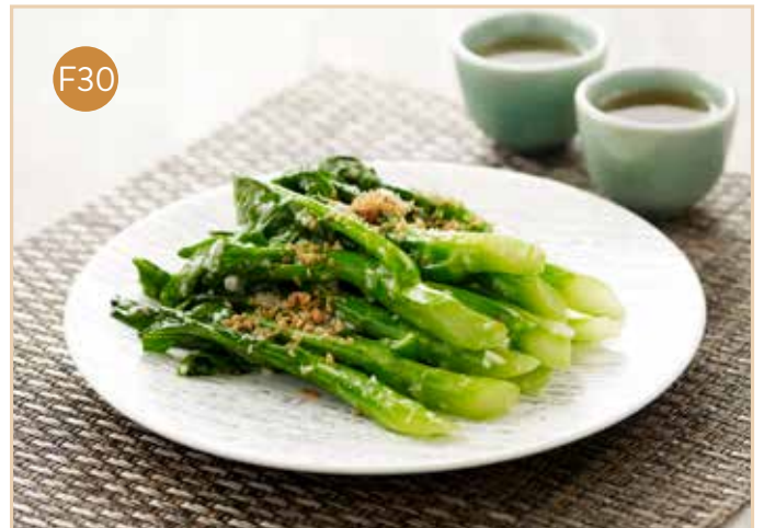
蒜蓉炒芥兰 Stir-fried Kai Lan with Minced Garlic $15.80