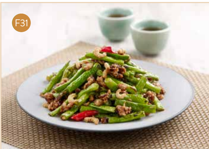
榄菜四季豆 Stir-fried French Bean with Minced Pork and Preserved Olive Vegetable $15.80