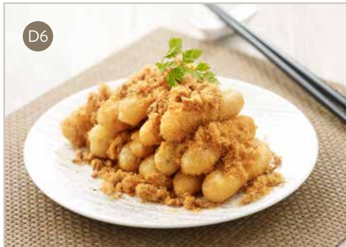
肉松炸茄子 Crisp-fried Eggplant with Pork Floss $13.80