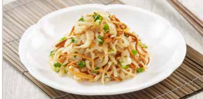
香葱虫草花拌海蜇 Chilled Jellyfish with Cordyceps Flower in Scallion Oil $12.80