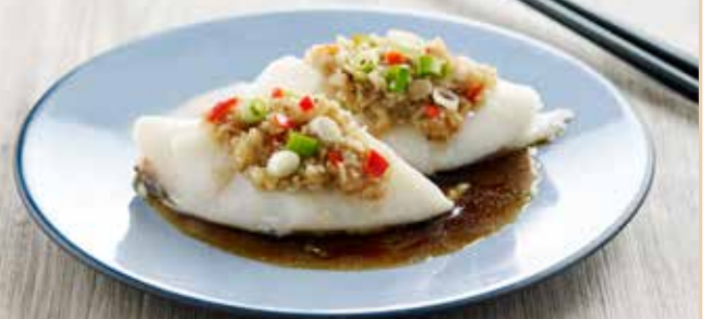
蒜蓉蒸鲽鱼 Steamed Flounder with Minced Garlic and Chilli $27.80