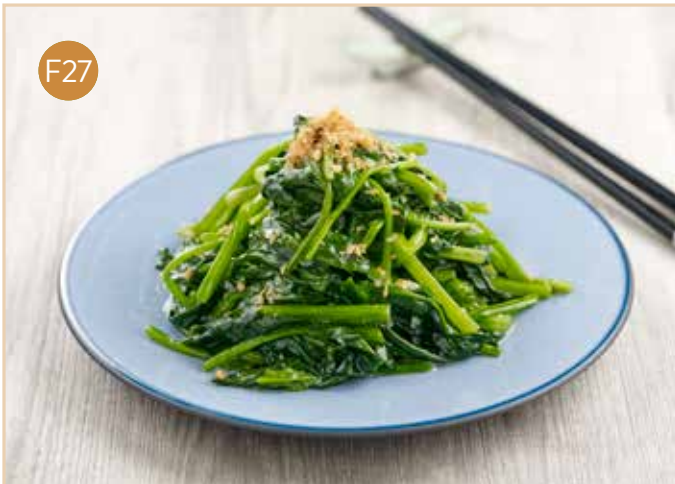
蒜蓉炒菠菜 Stir-fried Spinach with Minced Garlic $14.80