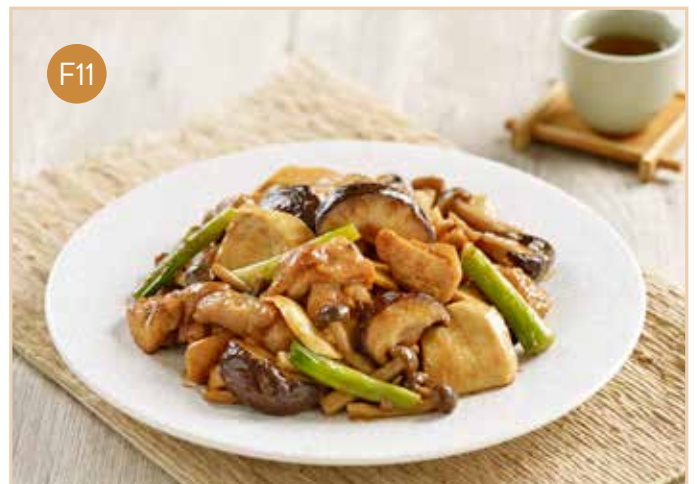
酱皇野菌鸡柳 Stir-fried Chicken Fillet with Wild Mushroom $17.80