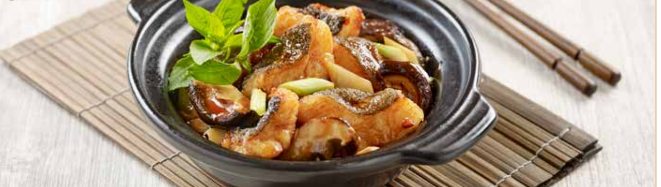
九层塔焗鲽鱼 Braised Crisp-fried Flounder with Mushroom and Basil Leaf $27.80