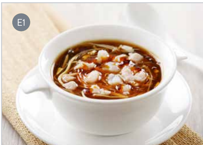
海鲜酸辣汤 Hot and Spicy Soup with Seafood $10.30