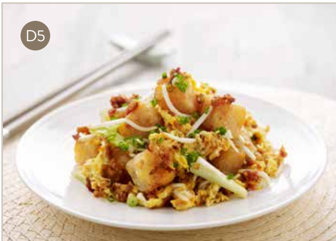
XO 酱炒萝卜糕 Wok-fried Carrot Cake in XO Sauce $12.80