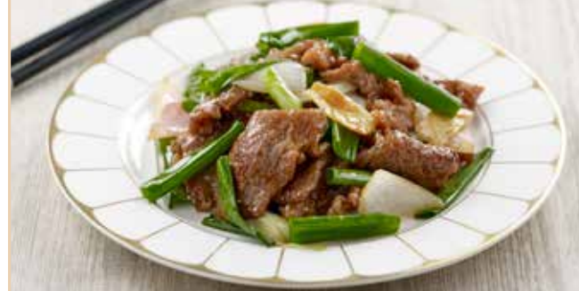
姜葱炒肥牛 Stir-fried Sliced Marbled Beef with Ginger and Spring Onion $22.80