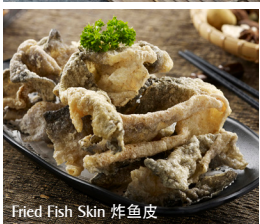
Fried Fish Skin 炸鱼皮