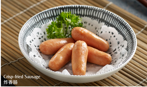
Crisp-fried Sausage 炸香肠