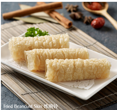
Fried Beancurd Skin 炸响铃