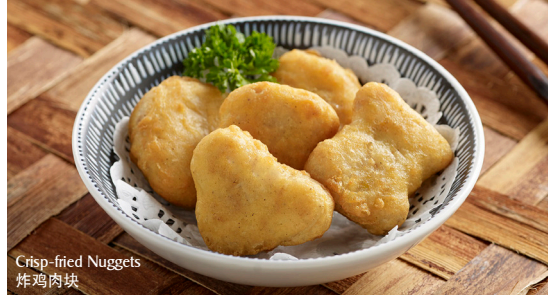
Crisp-fried Nuggets 炸鸡肉块