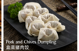
Pork and Chives Dumpling 韭菜猪肉饺