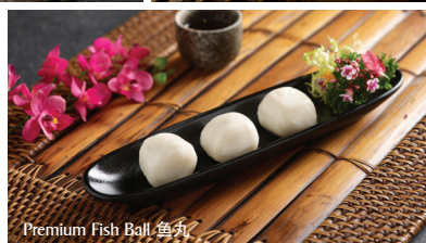
Premium Fish Ball 鱼丸