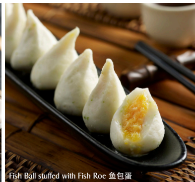
Fish Ball stuffed with Fish Roe 鱼包蛋