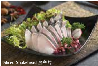
Sliced Snakehead 黑鱼片