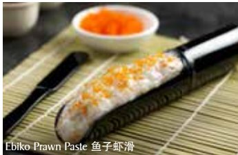
Ebiko Prawn Paste 鱼子虾滑