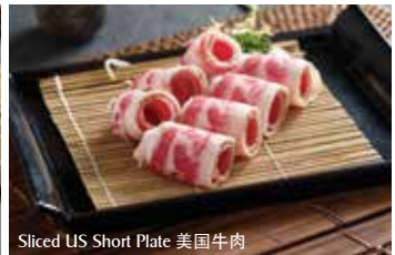
Sliced US Short Plate 美国牛肉