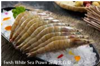
Fresh White Sea Prawn 深海大白虾