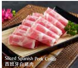
Sliced Spanish Pork Collar 西班牙白猪肉