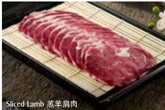
Sliced Lamb 羔羊肩肉