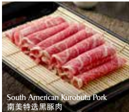
South American Kurobuta Pork 南美特选黑豚肉