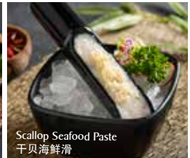
Scallop Seafood Paste 干贝海鲜滑

Pictures are for illustration purposes only.