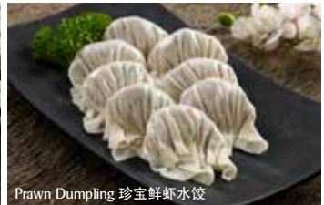
Prawn Dumpling 珍宝鲜虾水饺