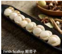
Fresh Scallop 鲜带子