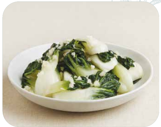
C30 蒜蓉奶白菜 Stir-fried Baby Cabbage with Garlic $15.80 | $24.80 Regular (例) | Large (大)