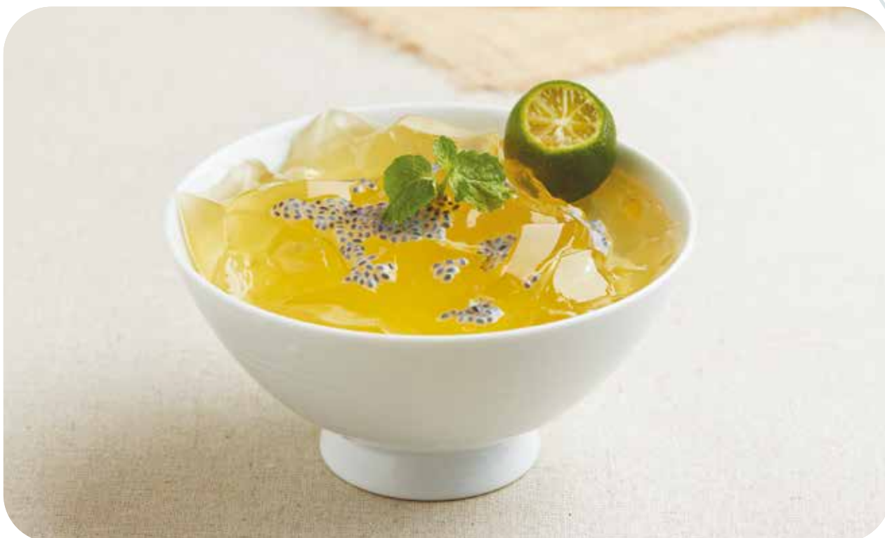
杨枝甘露 (冷) Mango Sago (chilled) $5.90 Per Portion (每份)