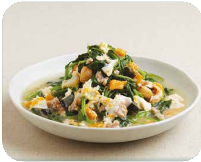
C27 金银蛋苋菜 Poached Chinese Spinach with Egg Trio in Superior Stock $16.80 | $26.80 Regular (例) | Large (大)