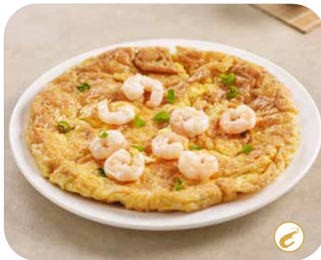
C8 阿婆虾仁煎蛋 Grandma's Prawn Omelette $11.80 Per Portion (每份)