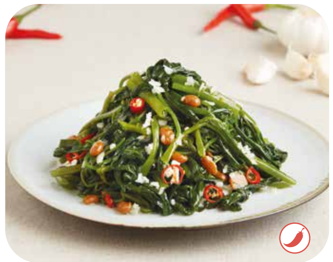
C32 泰式空心菜 Thai Style Stir-fried Kang Kong $14.80 | $23.30 Regular (例) | Large (大)