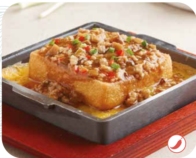
C5 菜香铁板豆腐 Hot Plate Tofu with Preserved "Cai Xin" and Minced Pork $16.30 Per Portion (每份)