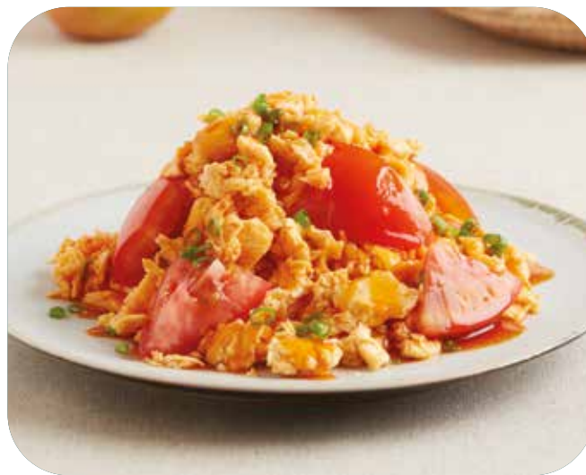
C6 阿婆番茄炒蛋 Grandma's Scrambled Egg with Tomato $11.80 Per Portion (每份)