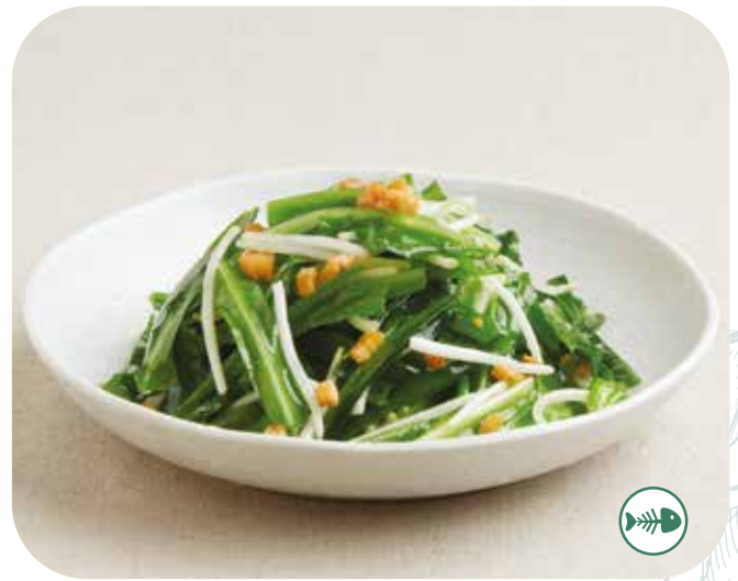
C28 咸鱼青龙菜 Stir-fried Chinese Chive with Salted Fish $16.80 | $26.80 Regular (例) | Large (大)