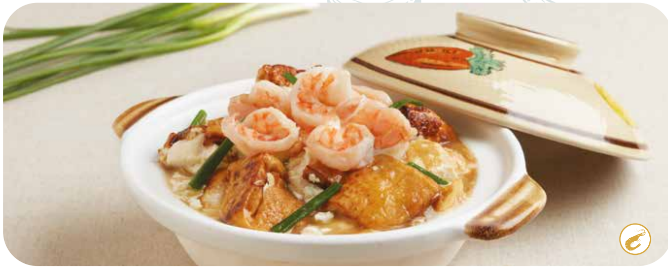
C4 砂锅豆腐虾 Braised Tofu with Prawn in Claypot $17.80 Per Portion (每份)