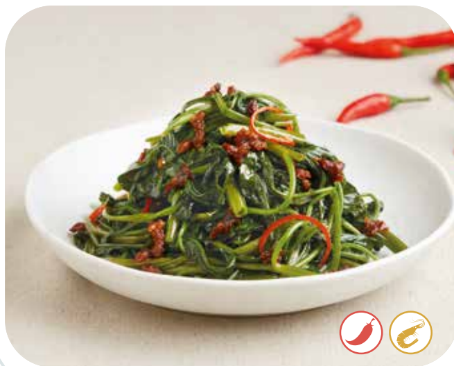
C31 马来风光 Sambal Kang Kong $14.80 | $23.30 Regular (例) | Large (大)