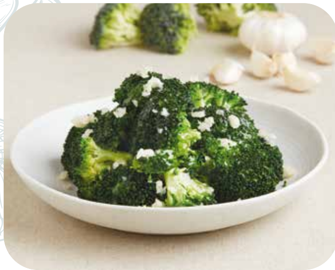
C29 蒜蓉西兰花 Stir-fried Broccoli with Garlic $15.80 | $24.80 Regular (例) | Large (大)