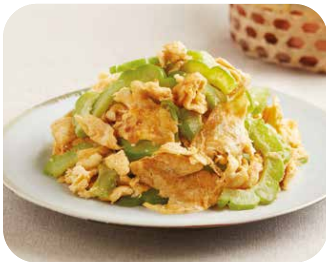
C7 阿婆苦瓜炒蛋 Grandma's Scrambled Egg with Bitter Gourd $11.80 Per Portion (每份)