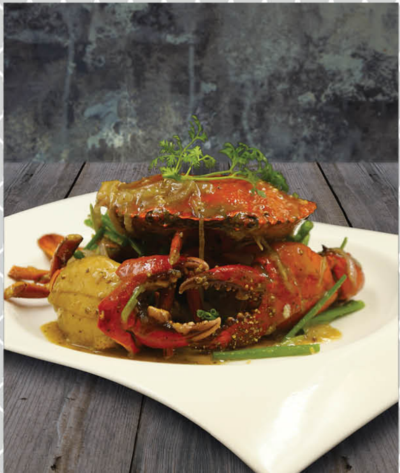
炒白胡椒 White Pepper