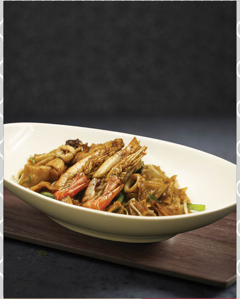
海鲜干炒河粉 Sautéed Rice Noodles with Seafood (小S)