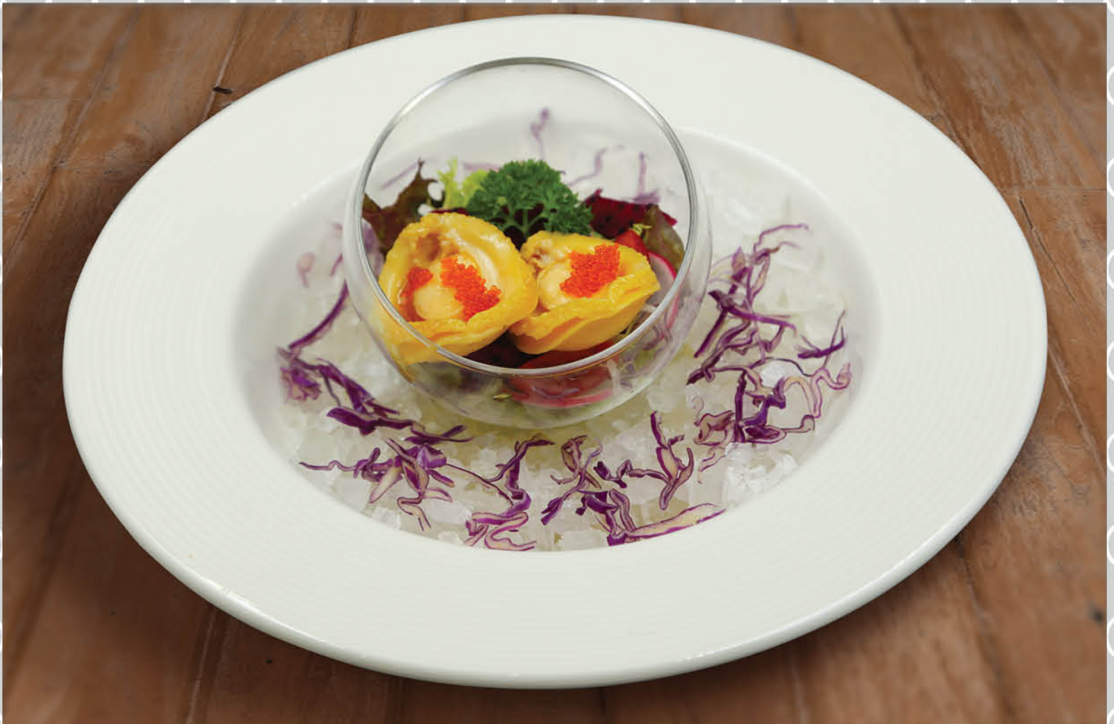
冰镇南非十头鲍鱼 1份(2粒) 10-Head Abalone Chilled Topped with Caviar