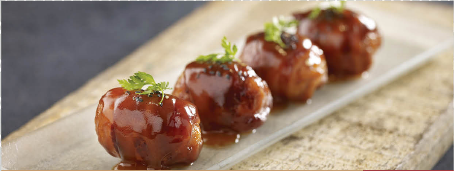
芝士腌肉卷 Deep-Fried Cheese Bacon Roll