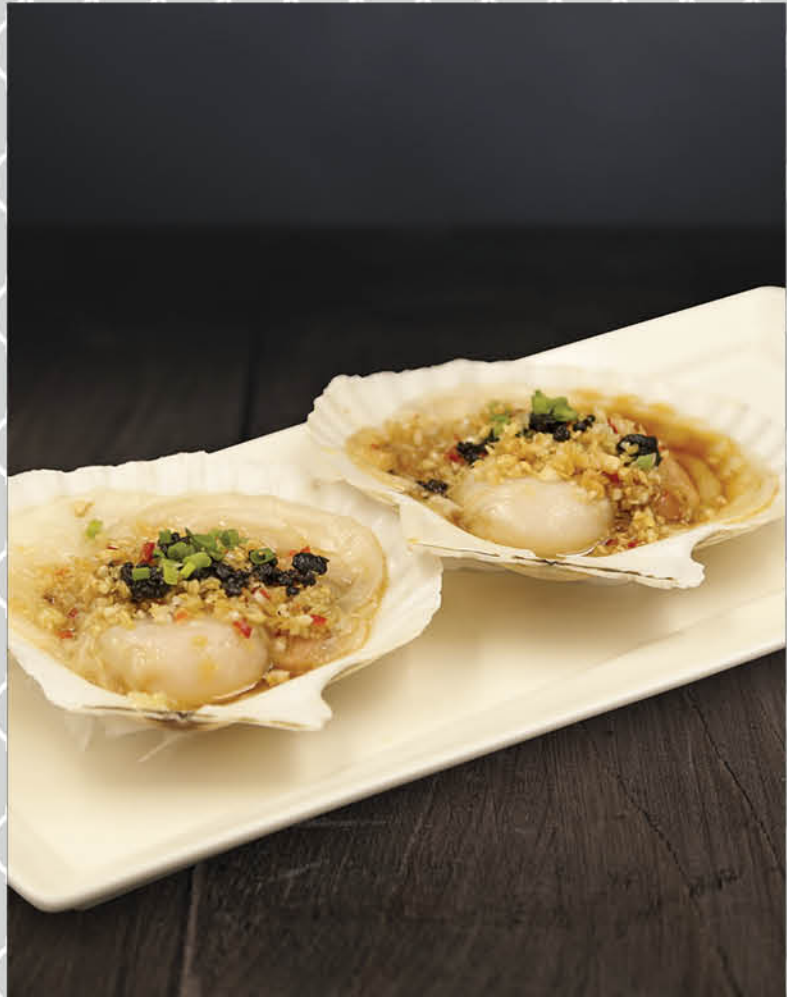
豉汁蒸扇贝 Scallops Steamed with Black Bean Sauce