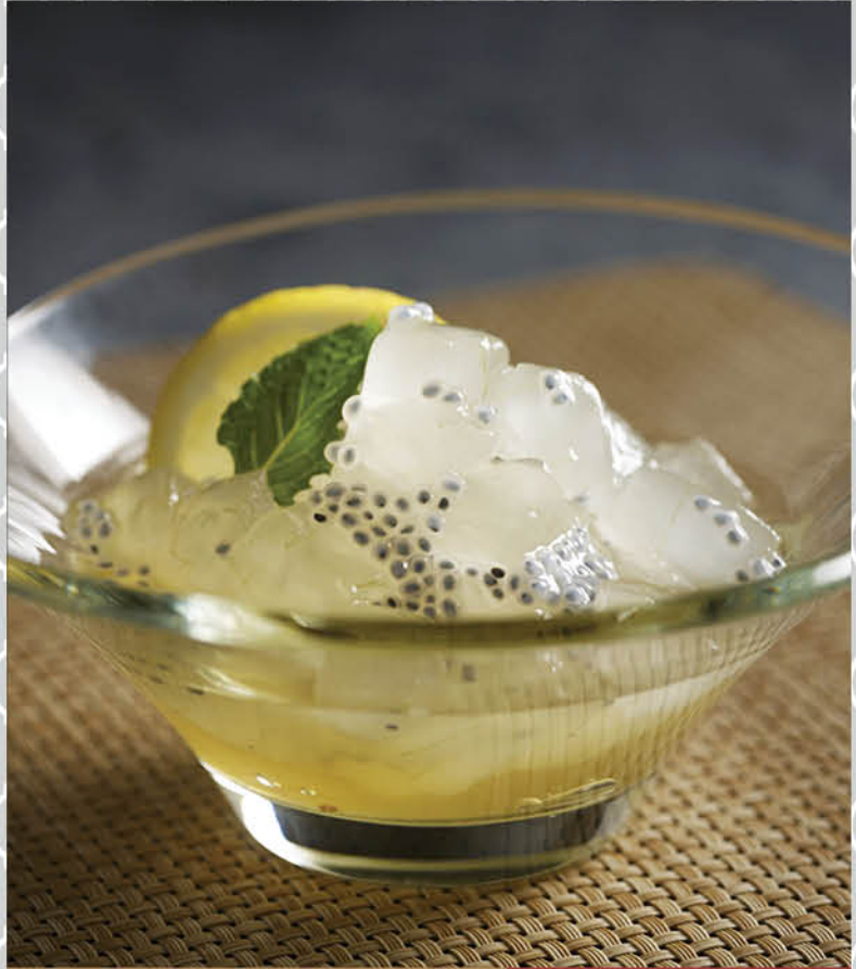
冰冻柠檬芦荟 Chilled Aloe Vera in Lemonade