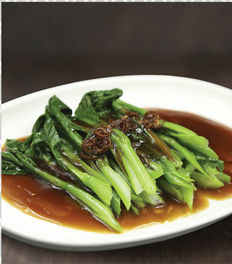
蚝油炒 Sautéed with Oyster Sauce