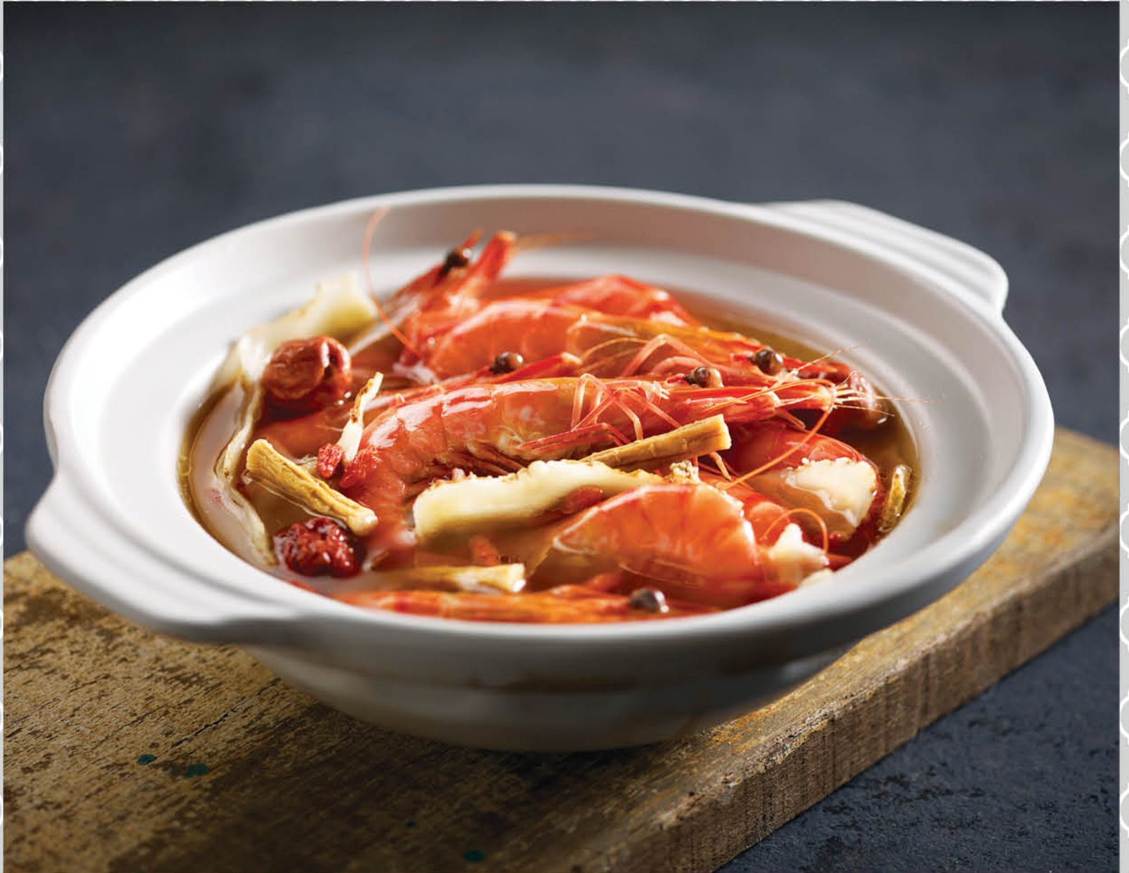
沙煲药材(加MMK 5,000) Poached with Superior Stock & Chinese Herbs (Additional MMK5,000)