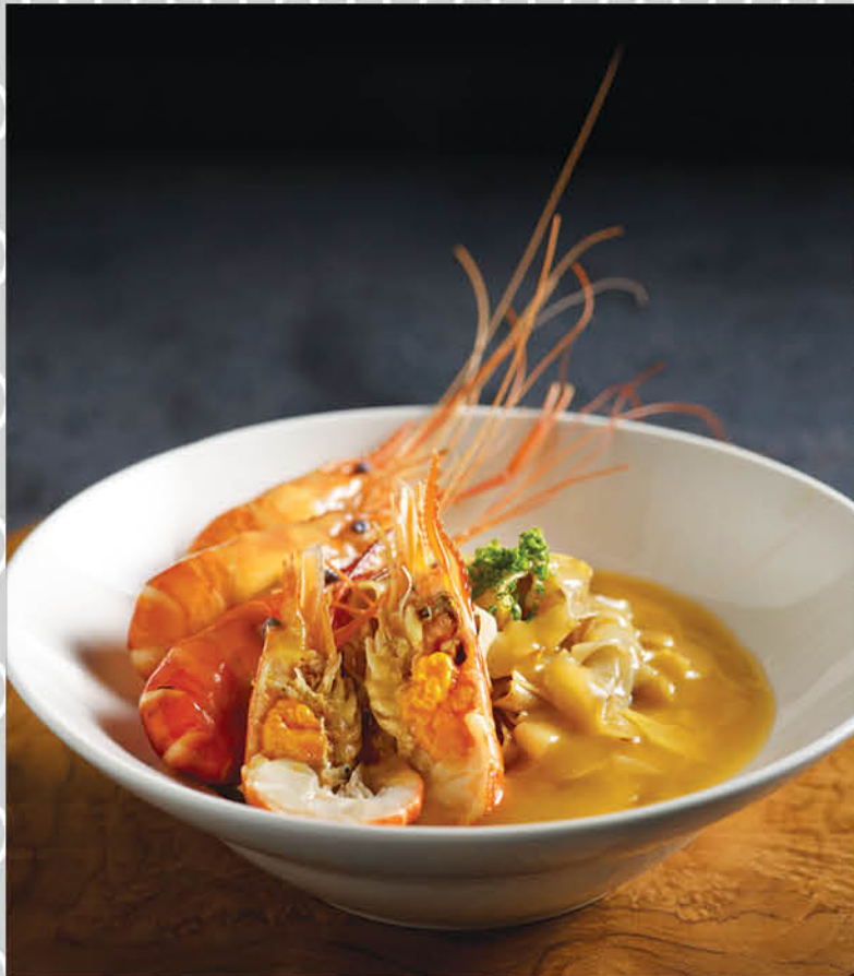
滑蛋浓汁生虾河粉 Rice Noodle with Prawns and Scrambled Eggs