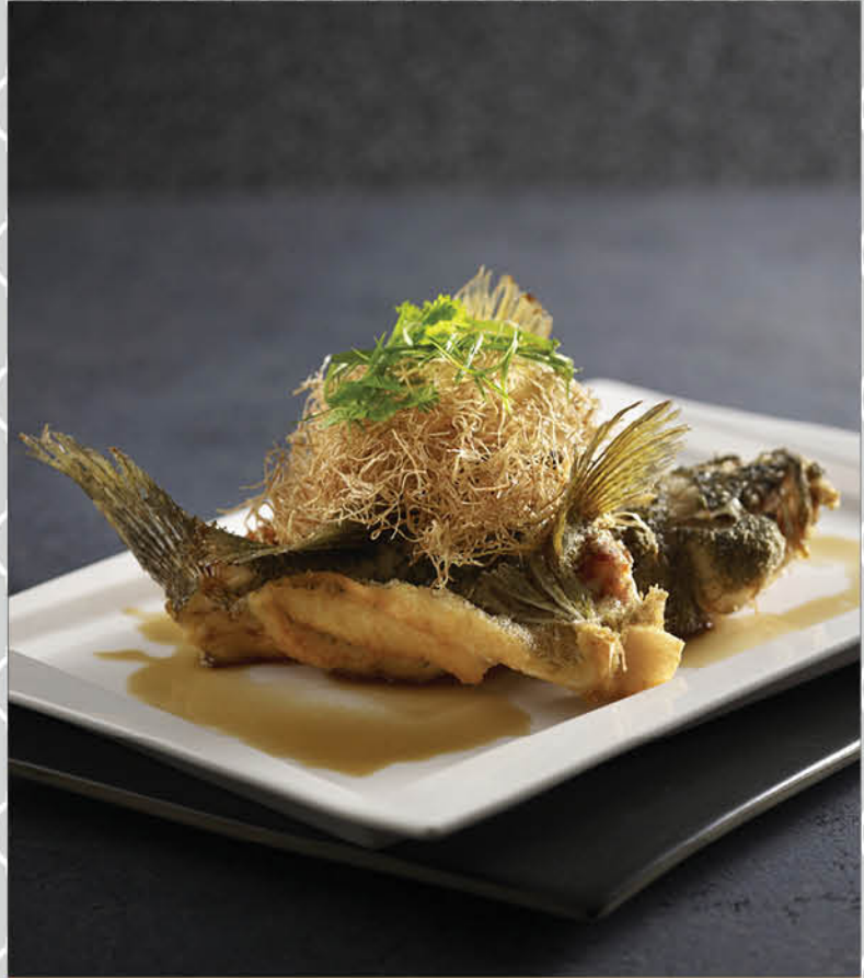
油浸 Deep-Fried with Supreme Soya Sauce