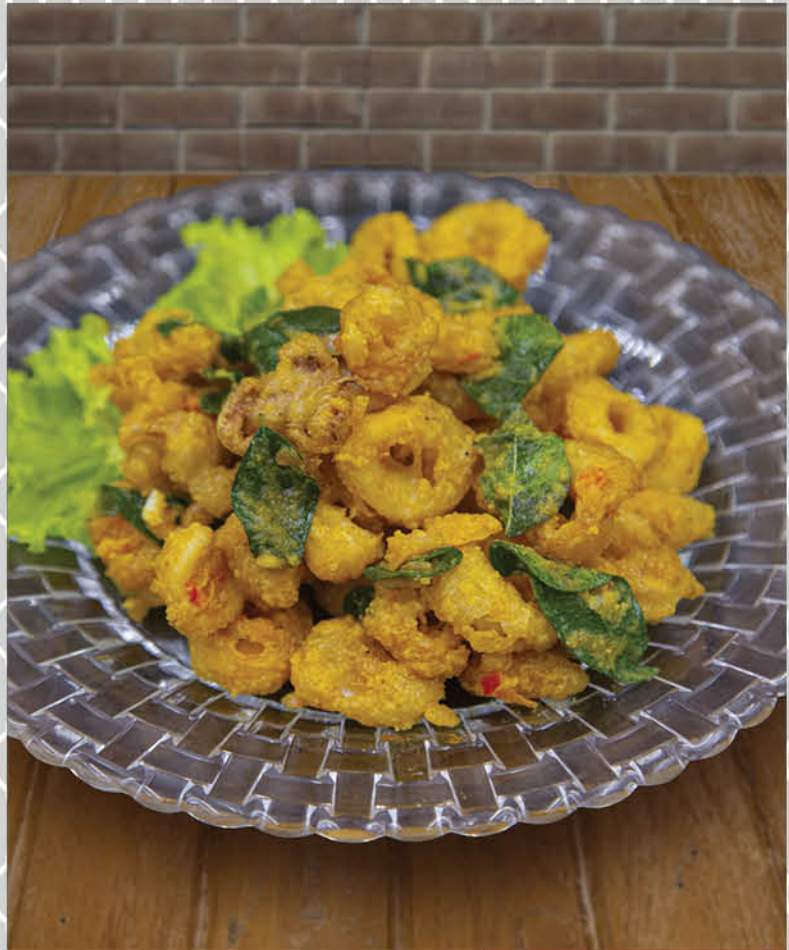
酥炸咸蛋苏东 Crispy-Fried Squid with Salted Egg Yolk (小S)