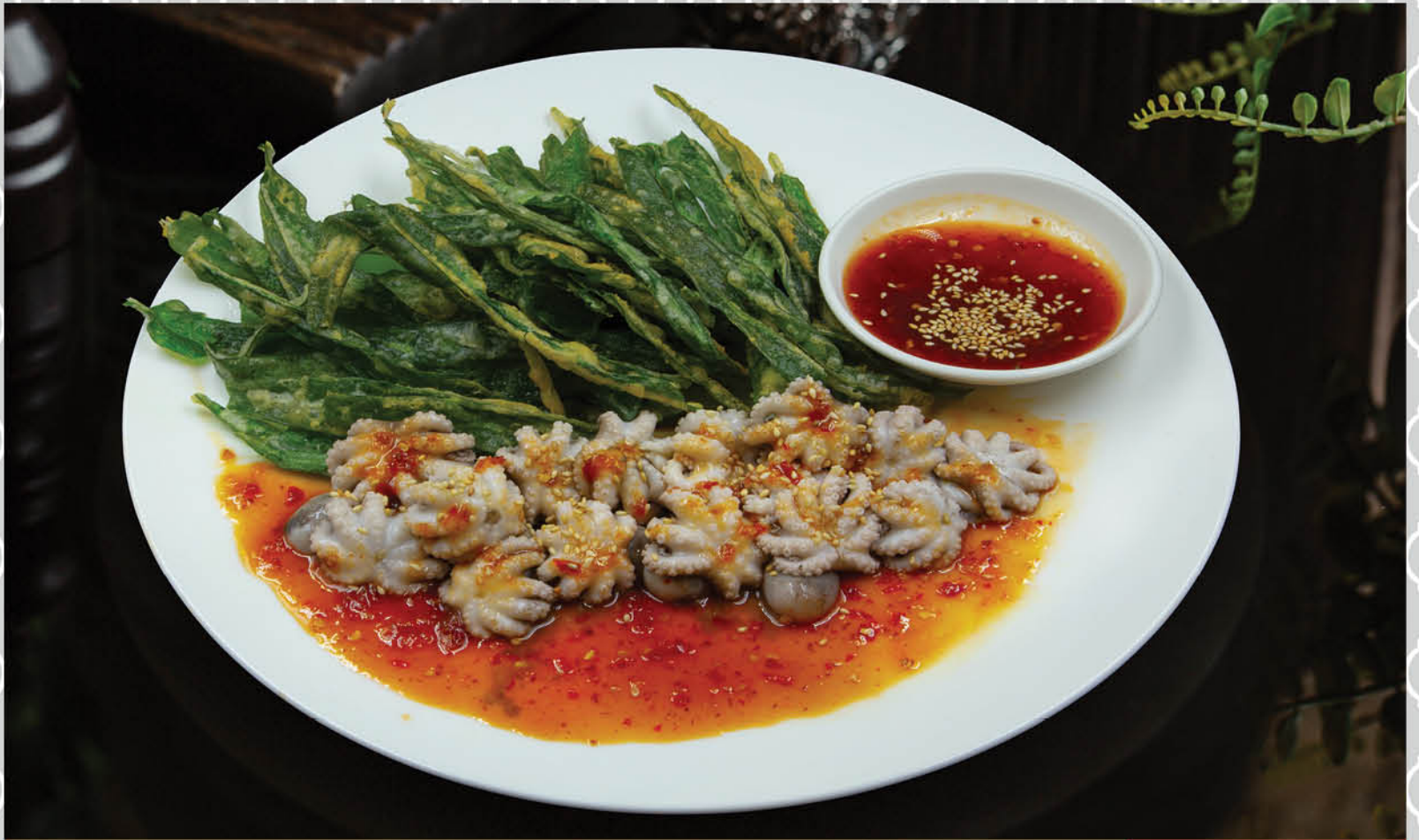
酥炸通心菜小八爪鱼 Crispy Kong Kong topped with Baby Octopus in Homemade Seafood Sauce