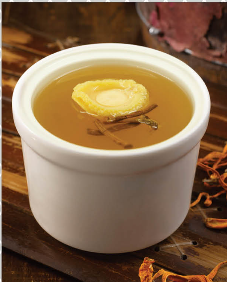
石斛炖鲍鱼汤 (位上) Double-Boiled Abalone with Dendrobium Nobile in Superior Broth