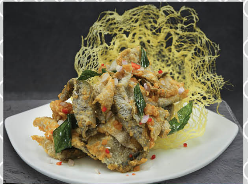
酥炸咸蛋鱼皮 Crisp-Fried Fish Skin with Salted Egg Yolk