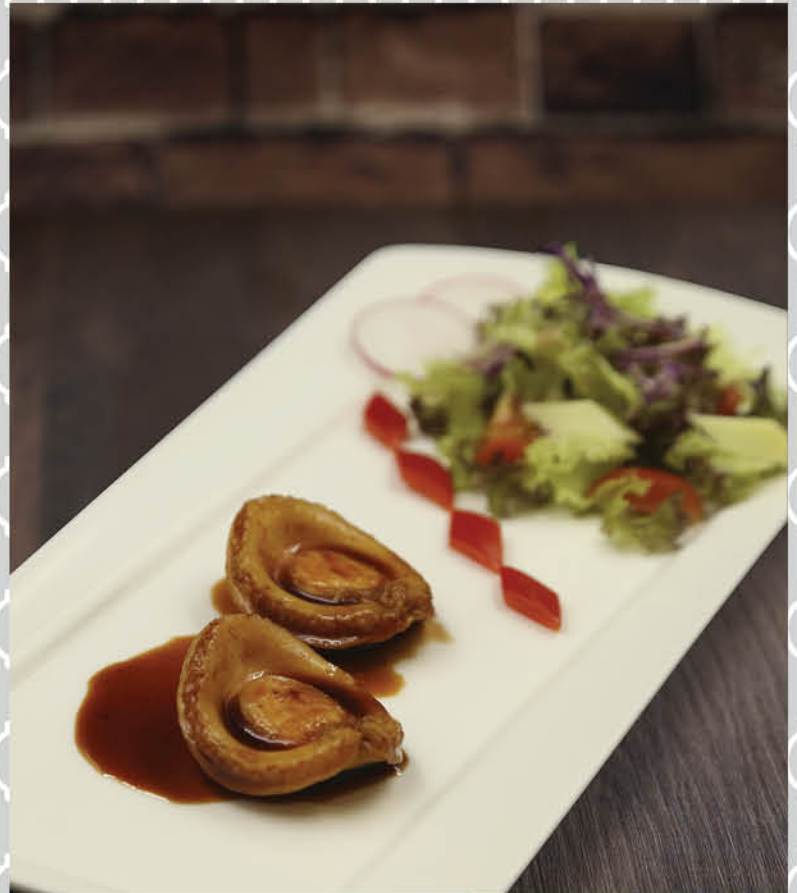
辣口煎十头鲍鱼 1份(2粒) 10-Head Abalone Grilled with Spicy Sauce