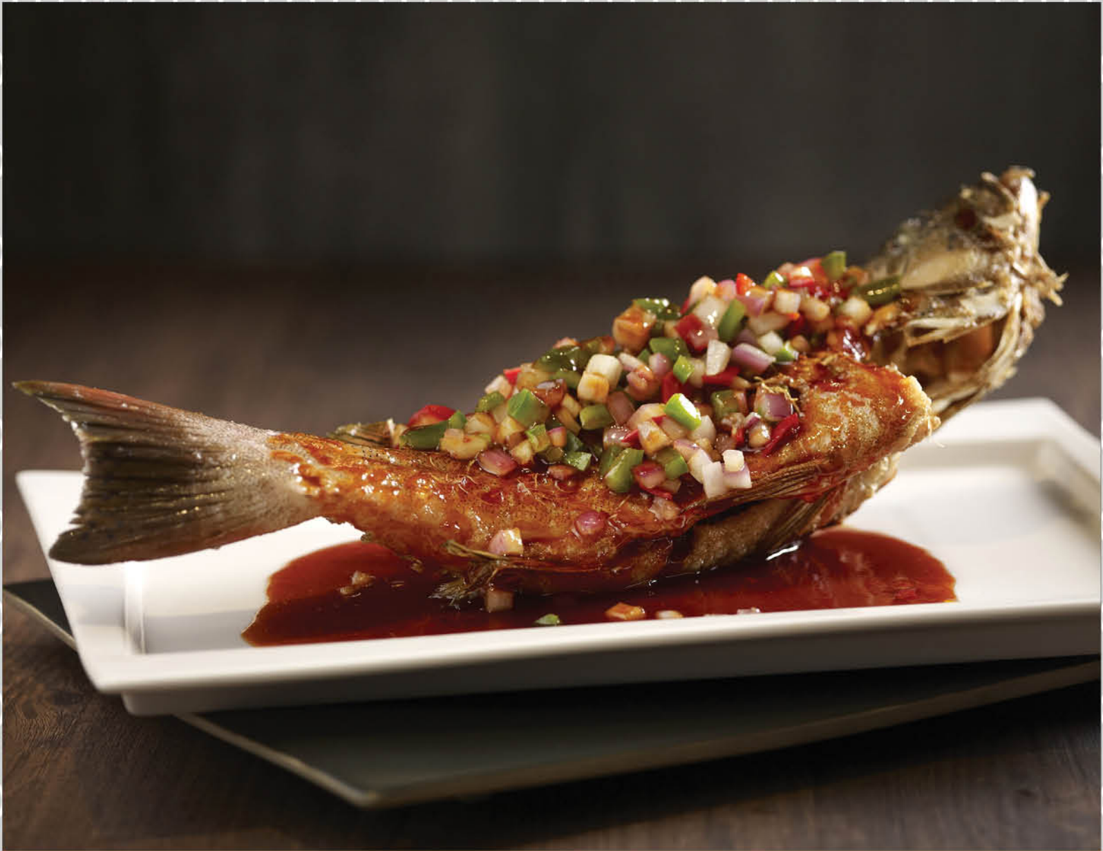
糖醋炸 Deep-Fried in Sweet and Sour Sauce