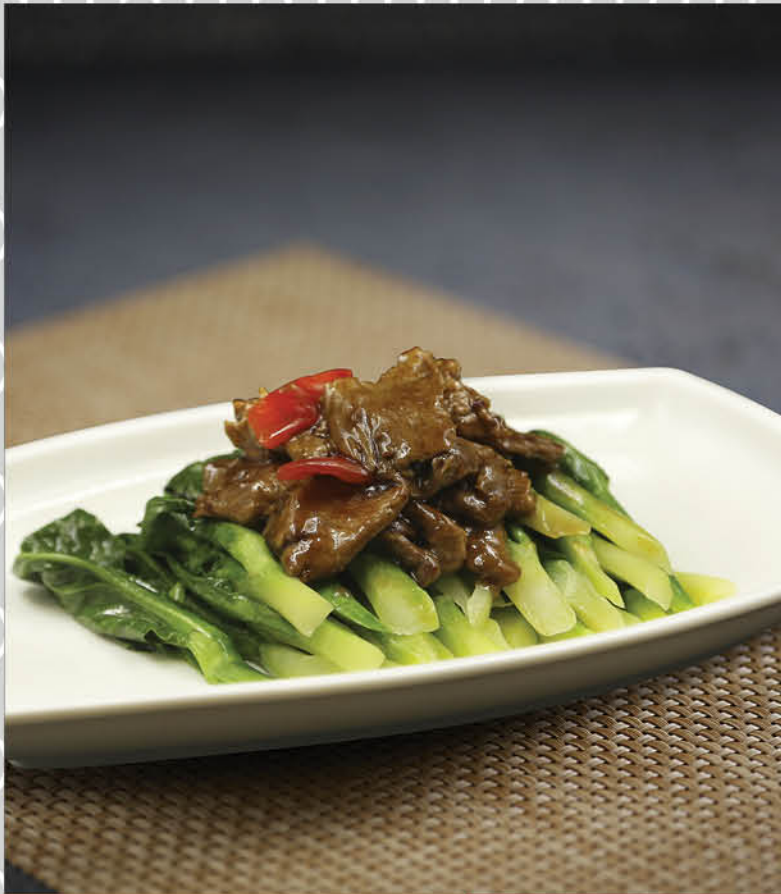
芥兰炒牛肉片 Sautéed Kai Lan with Sliced Beef (小S)