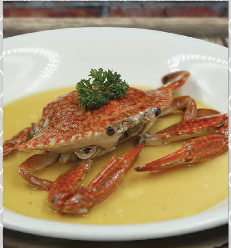
花雕鸡油蒸 Steamed in Chinese Wine