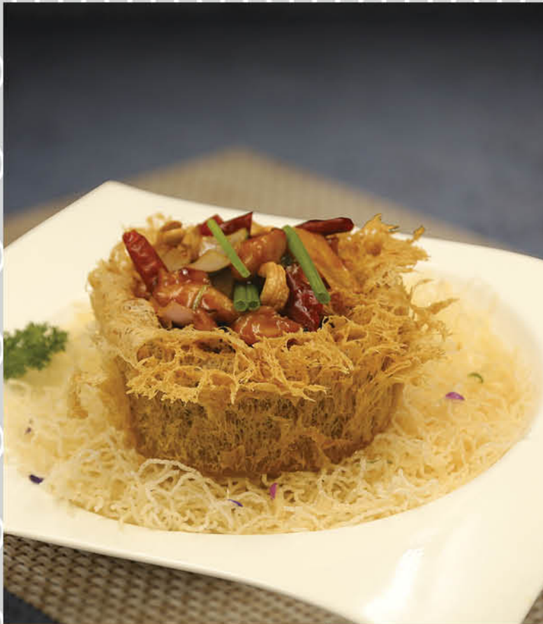
佛钵飘香 Crispy Golden Yam Ring with Spicy-Fried Kung Pao Chicken