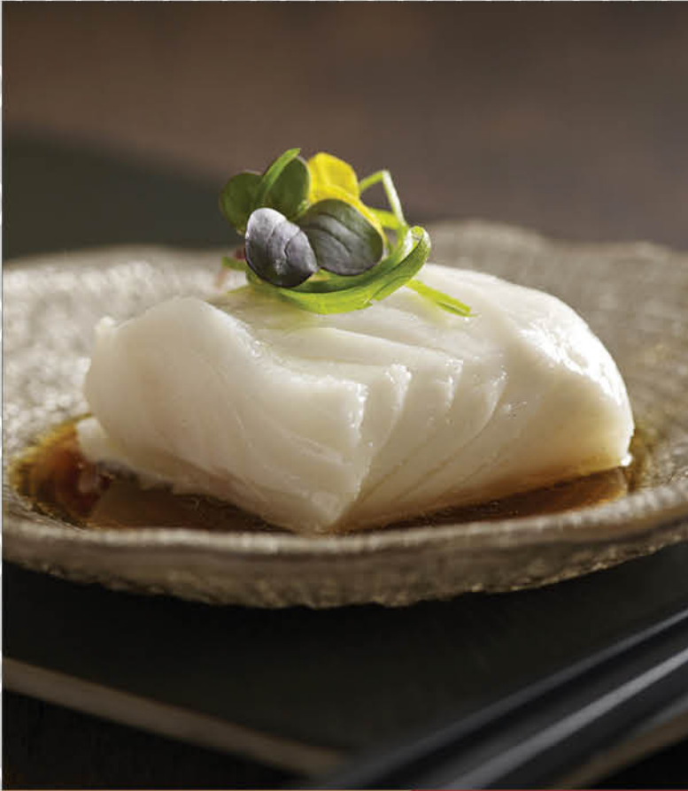
清蒸鳕鱼 Steamed Cod Fish with Supreme Soya Sauce