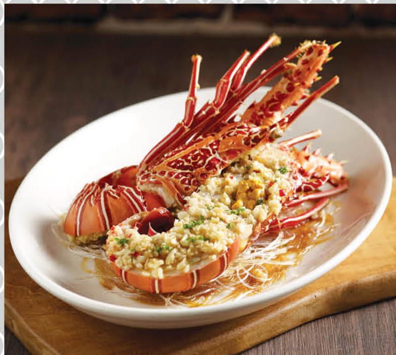
蒜茸蒸 Steamed with Minced Garlic