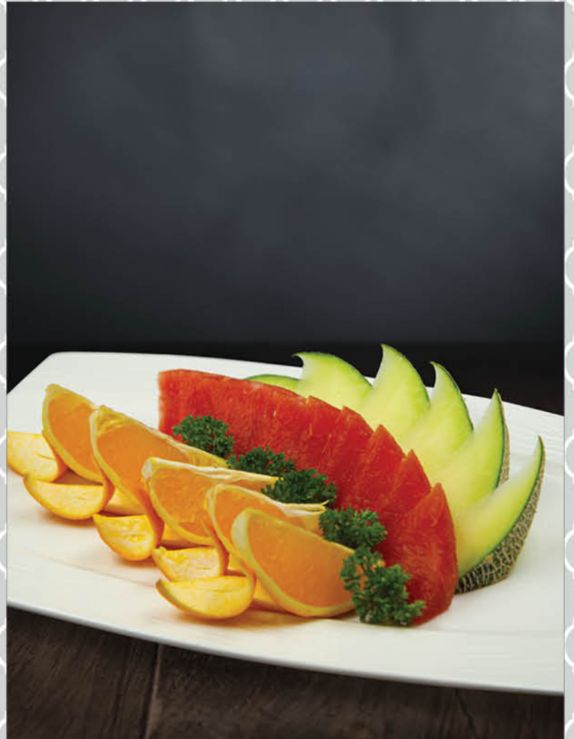
水果拼盘 Fresh Fruit Platter