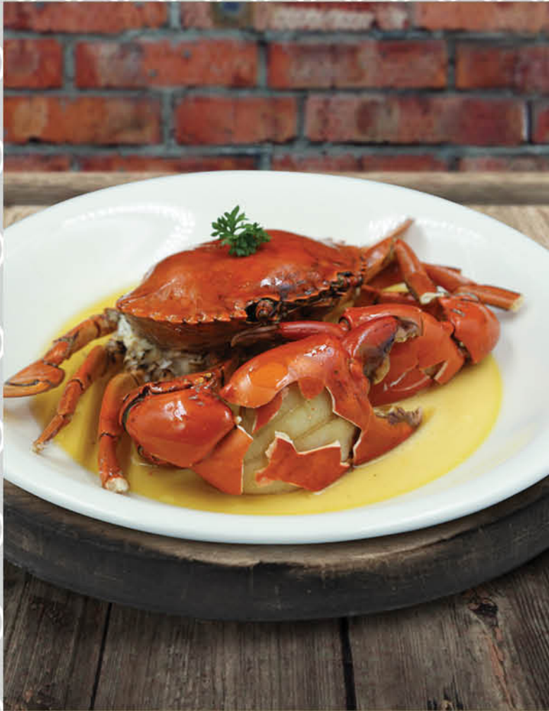
花雕鸡油蒸 Steamed in Chinese Wine