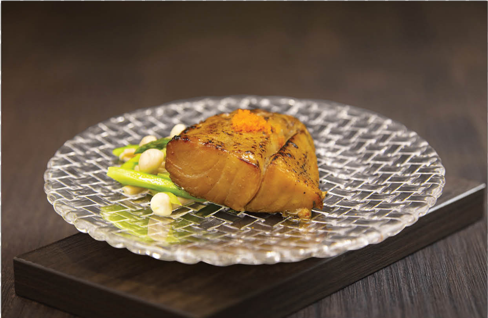
蜜汁焗金目鲈 Baked Seabass with Honey Sauce