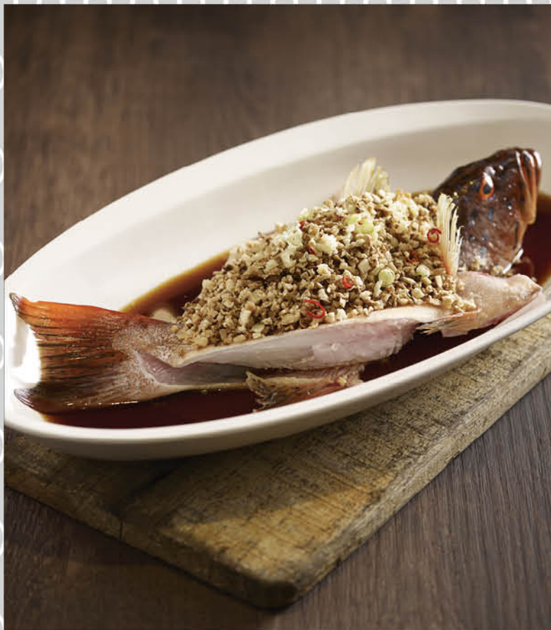
菜脯蒸 Steamed with Preserved Radish