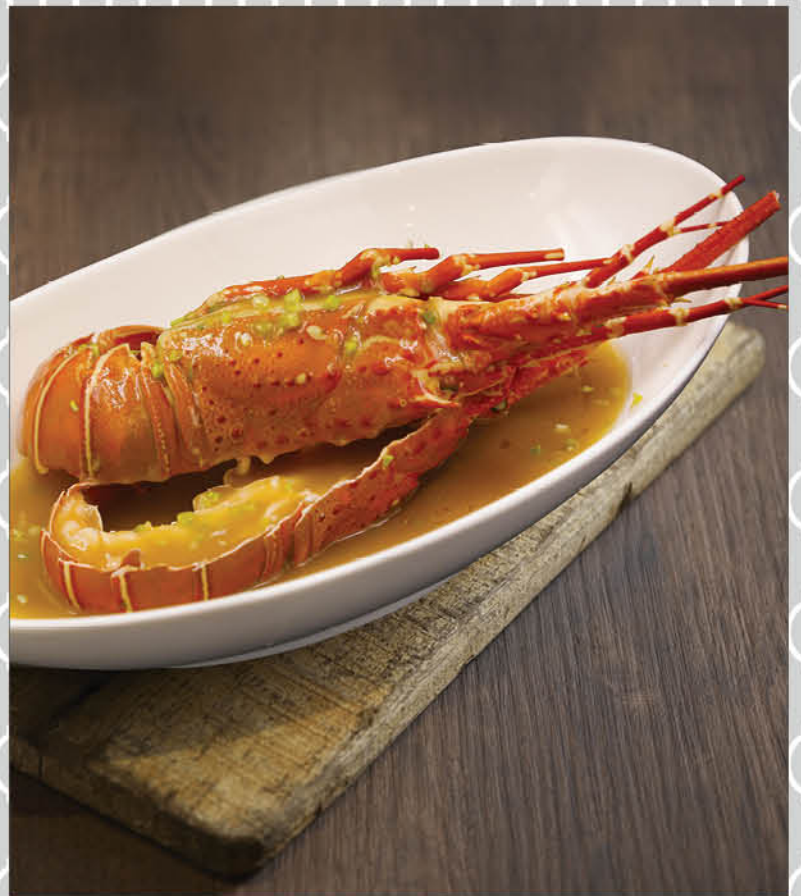
上汤焗 Steamed in Superior Broth