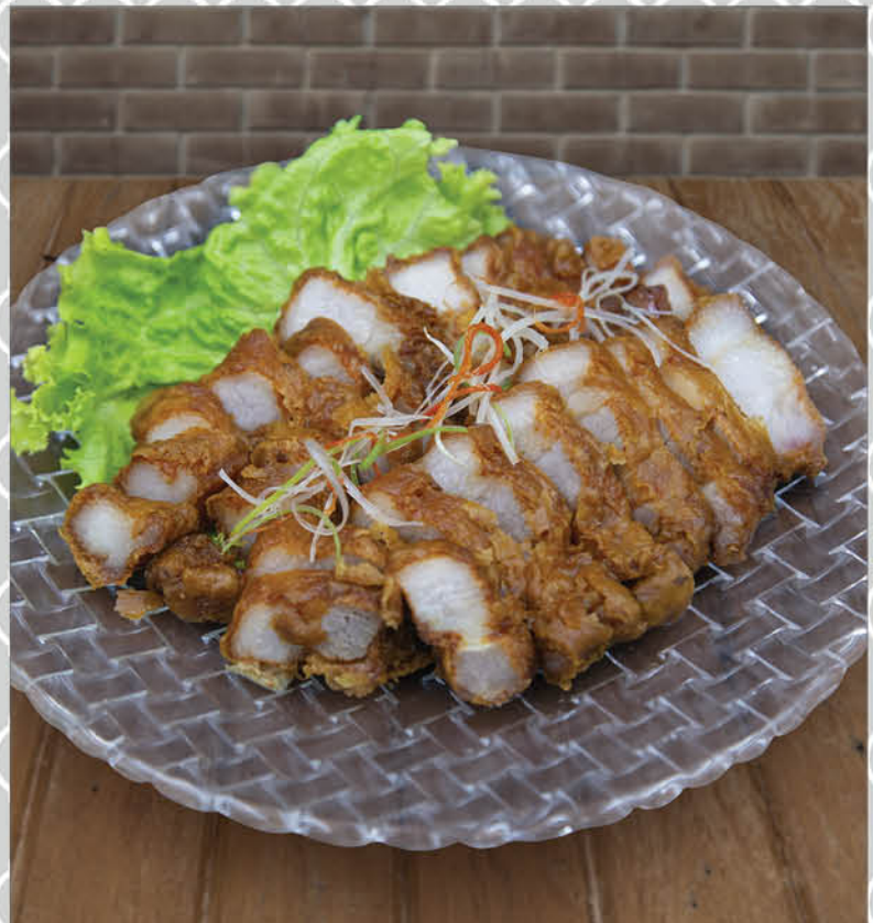
酒香五花肉 Deep-Fried Pork Belly with Rose Wine (小S)