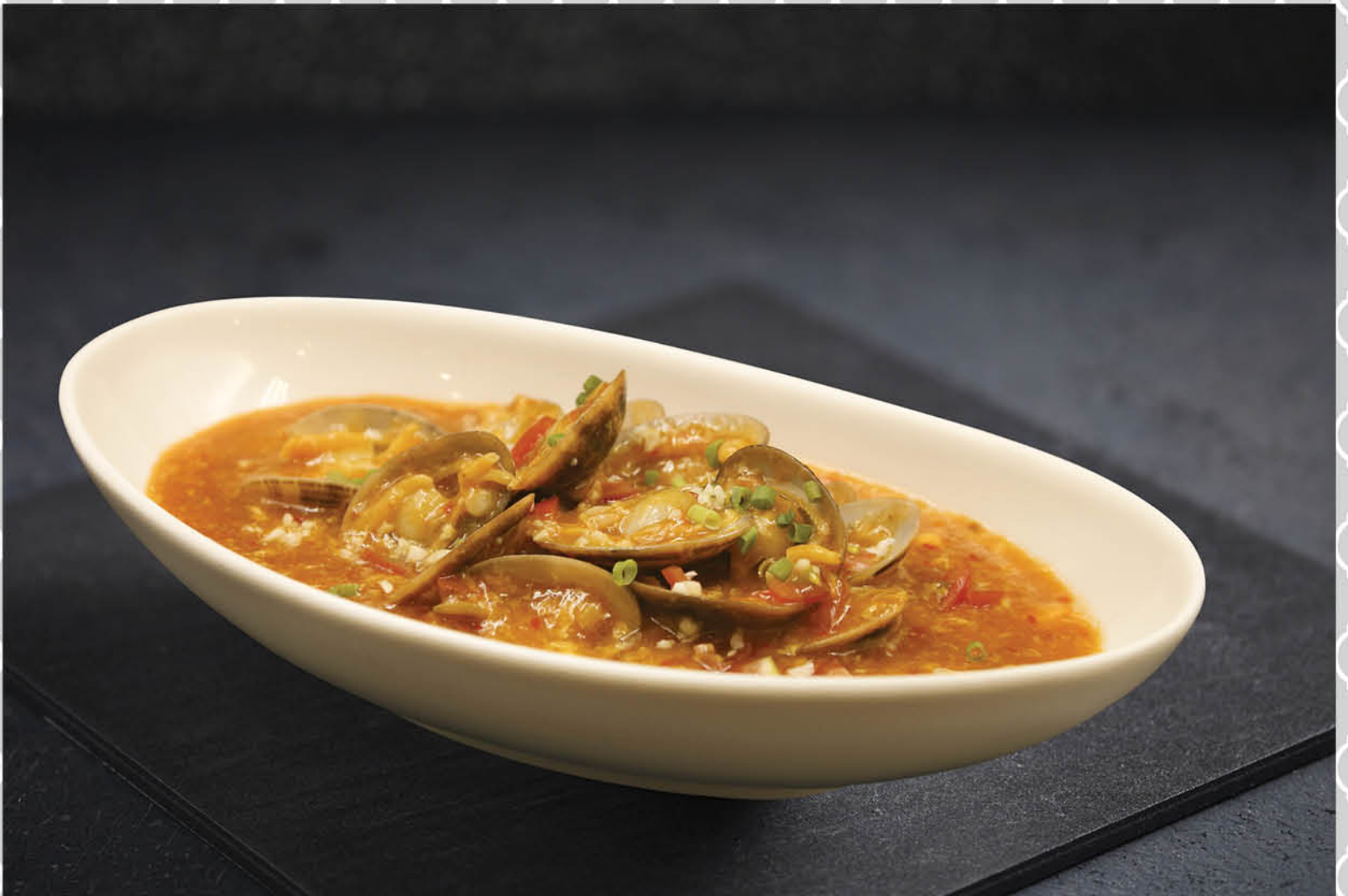
辣子炒花蛤 Venus Clam Sautéed with Chilli (小S)