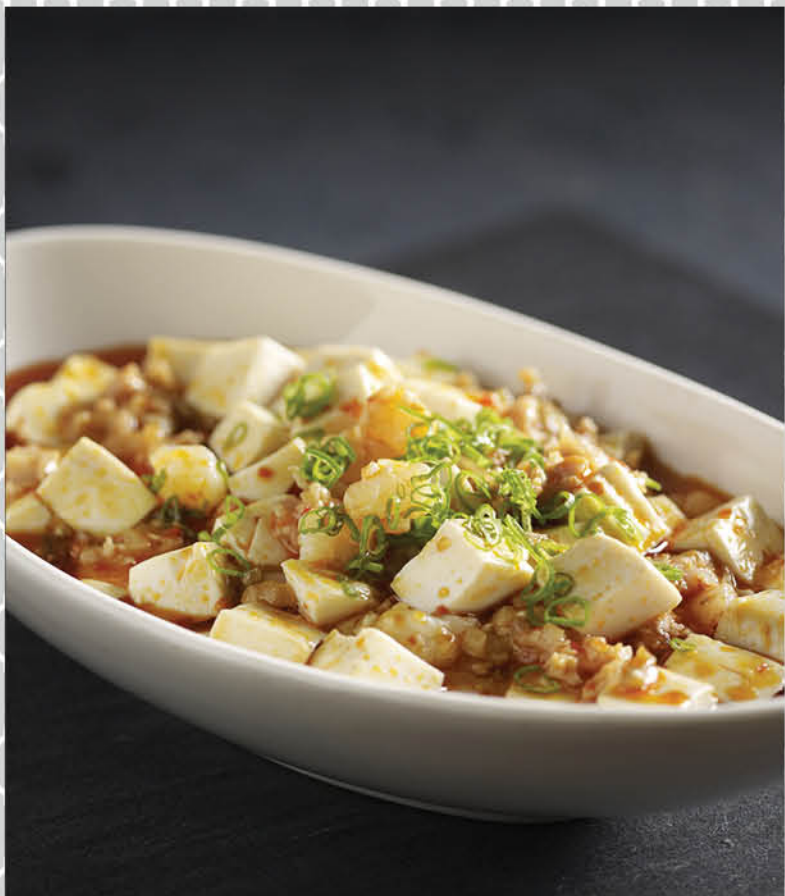
麻婆虾仁豆腐 Ma Po Tofu with Prawns (小S)