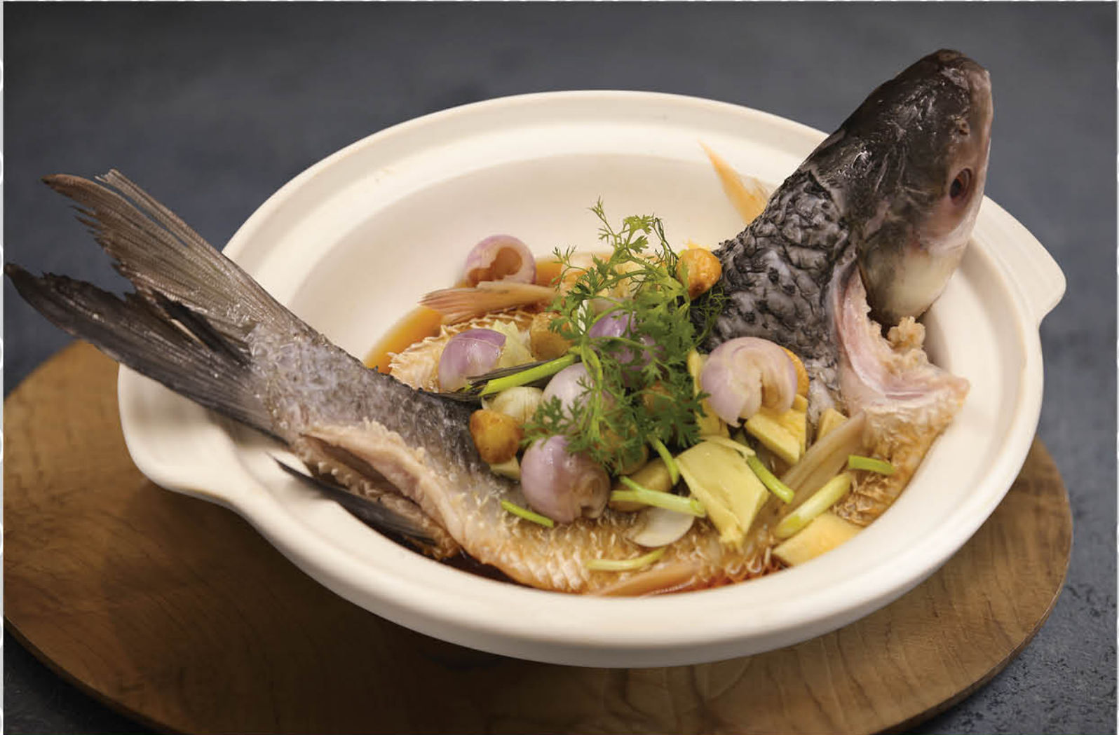
砂锅生焗 Braised with Supreme Soya Sauce in Claypot