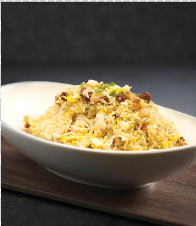
扬州炒饭 Yang Zhou Fried Rice (小S)