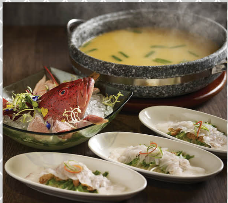
过桥 Poached with Superior Broth (Additional MMK 15,000)