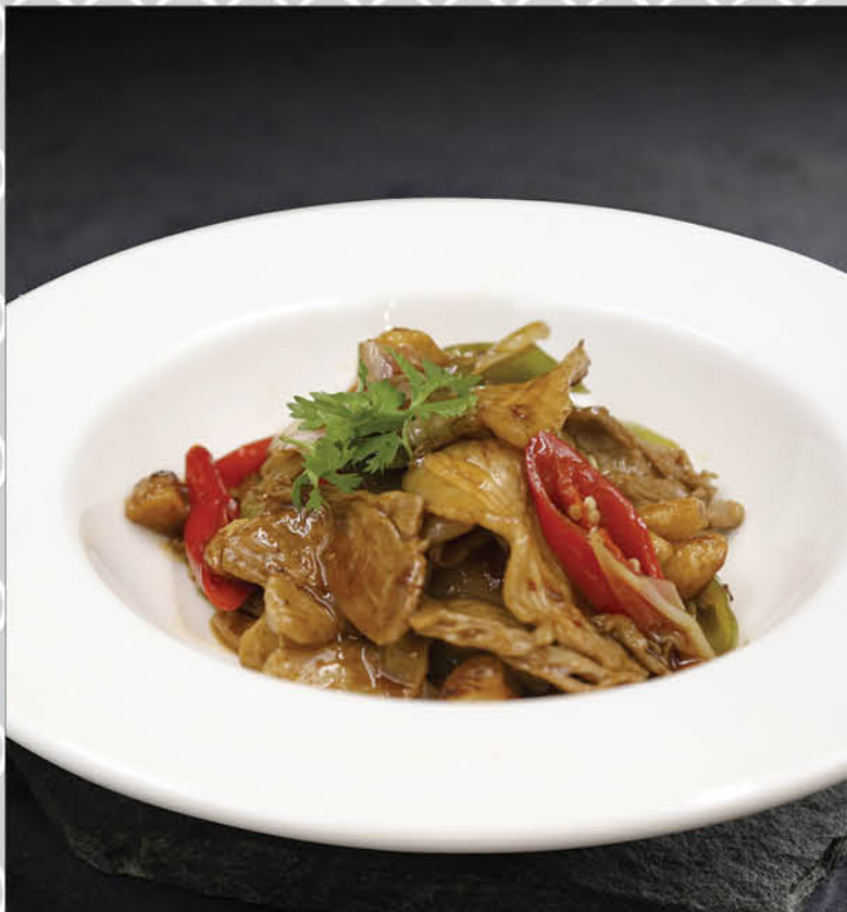
家乡回锅肉 Double Cooked Slices Pork Belly (小S)