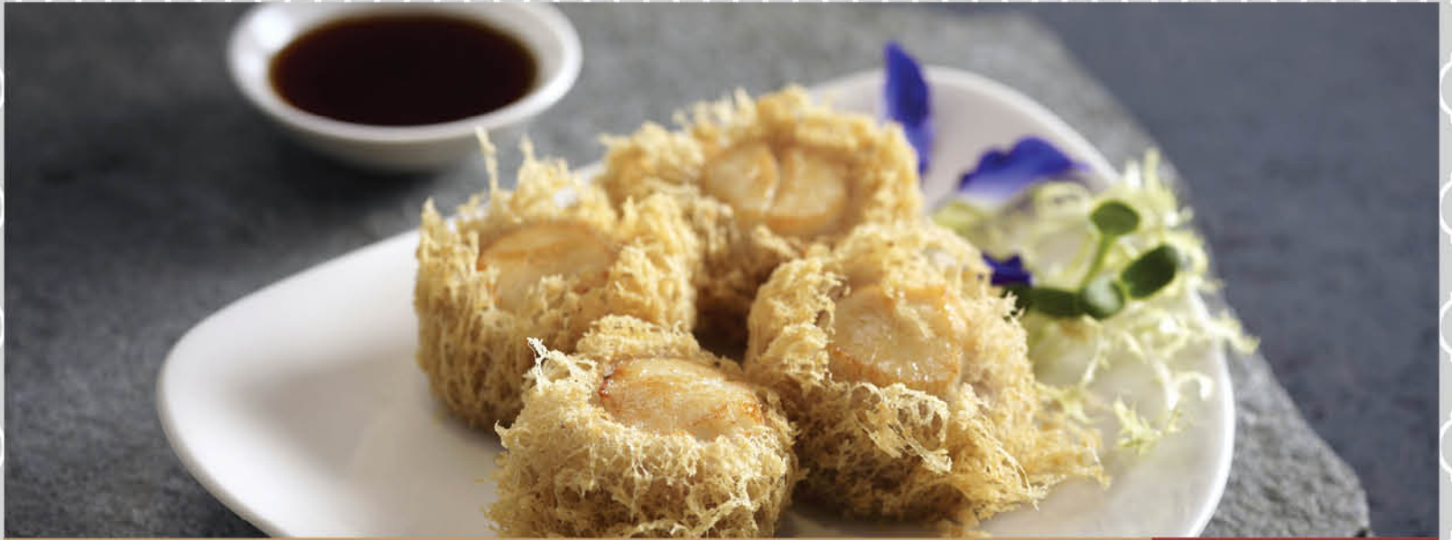
荔茸炸带子 Crispy-Fried Yam Ring Stuffed with Scallop