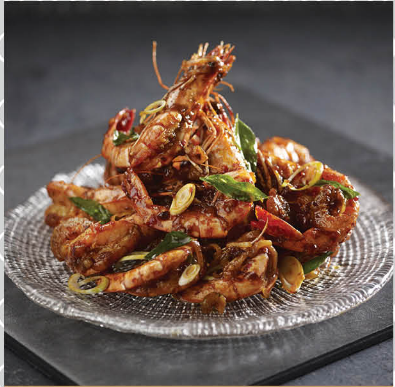
炒甘香 Sautéed with Spicy Garlic Sauce