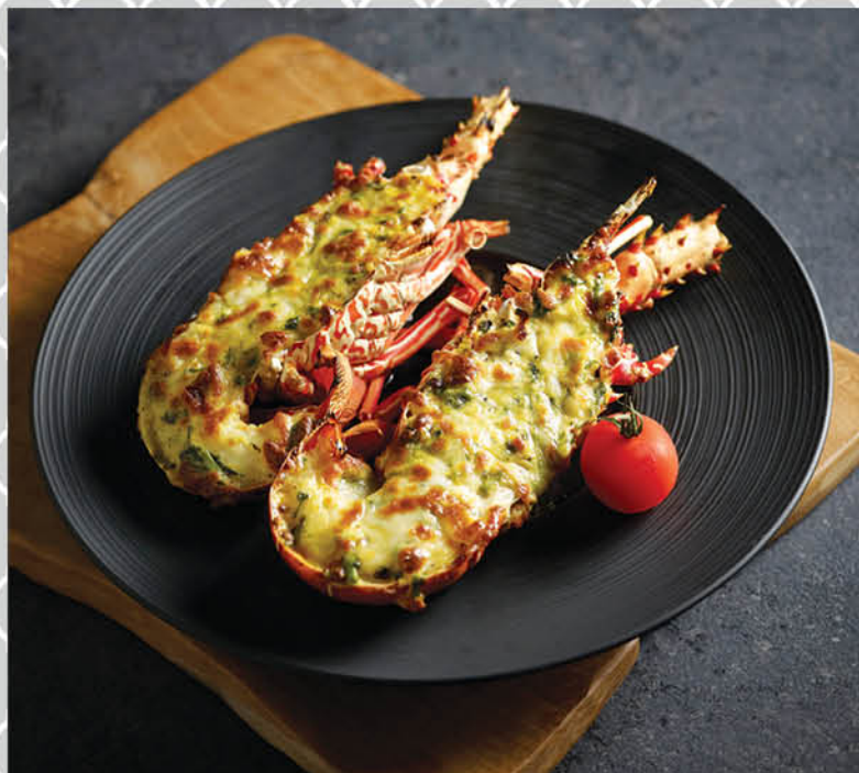
芝士焗 Baked with Cheese