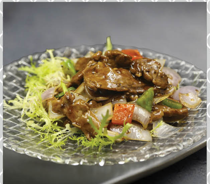
黑胡椒炒牛肉片 Sautéed Sliced Beef in Black Pepper Sauce (小S)