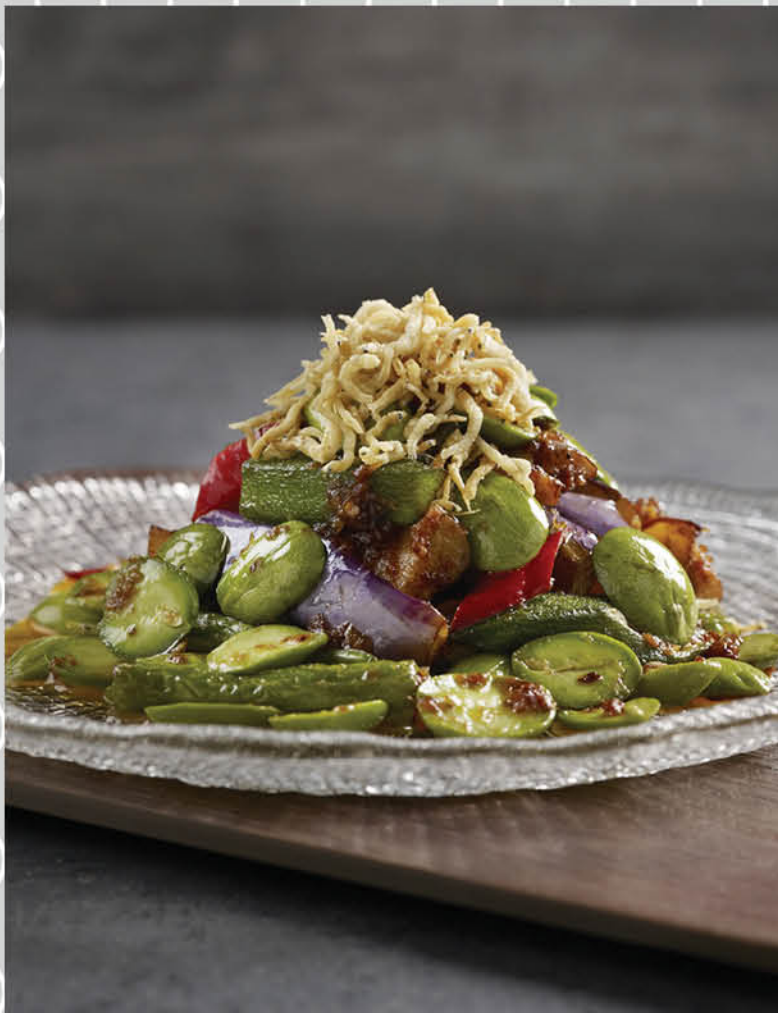
臭豆辣小炒 Sautéed Spicy Petai Beans (小S)