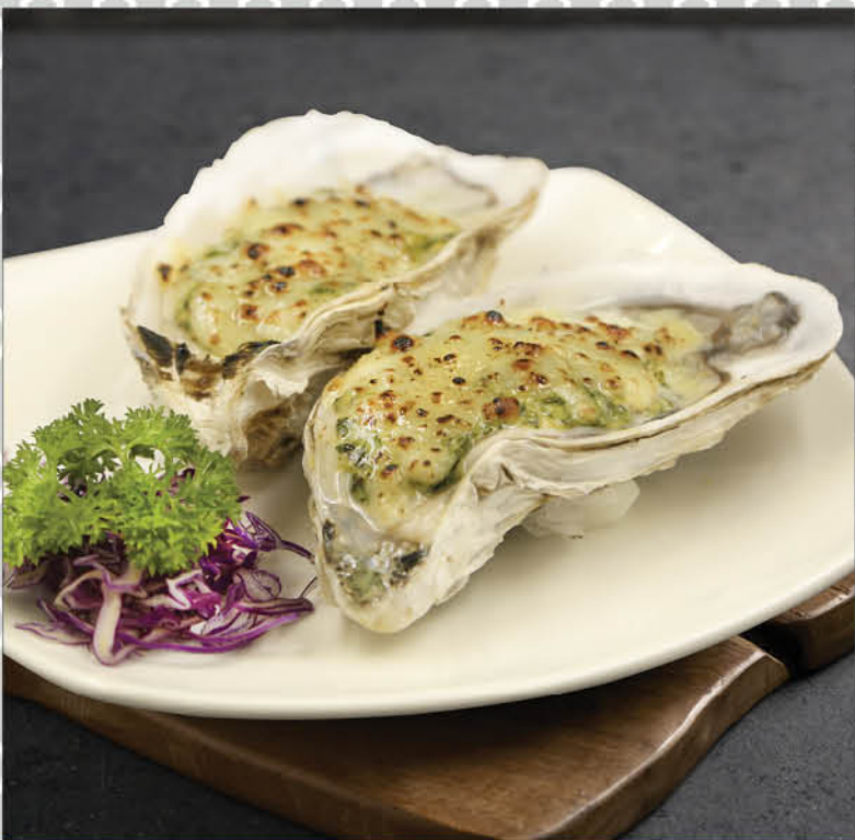
芝士焗 Baked with Cheese