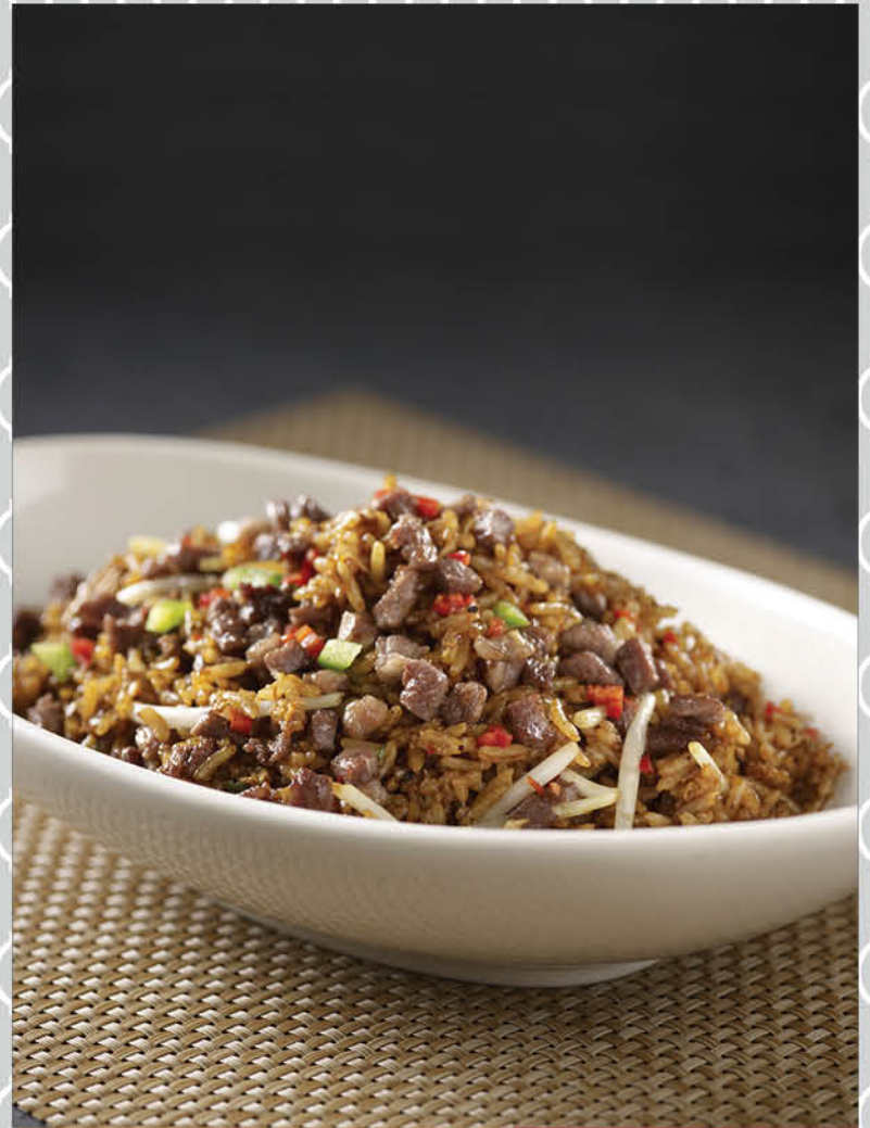
牛魔皇炒饭 Fried Rice with Seasoned Black Pepper Beef Cubes (小S)