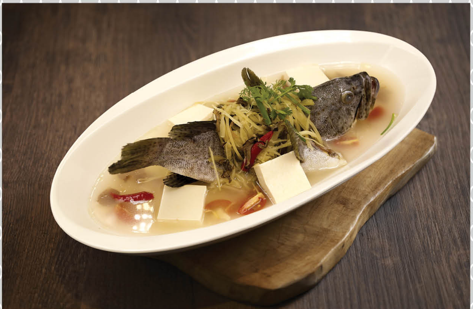
潮式蒸 Steamed in Teochew Style