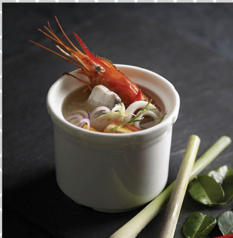
海鲜冬炎汤 (位上) Tom Yum Seafood Soup