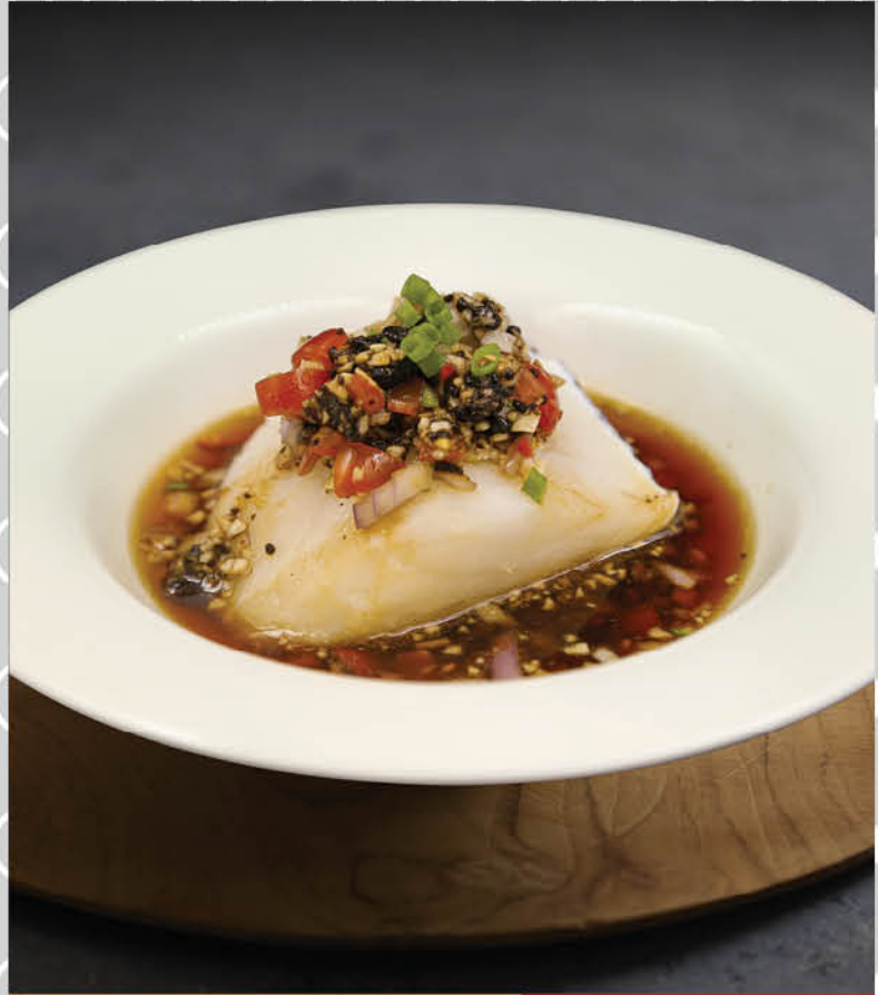
豉汁蒸鳕鱼 Steamed Cod Fish with Black Bean Sauce