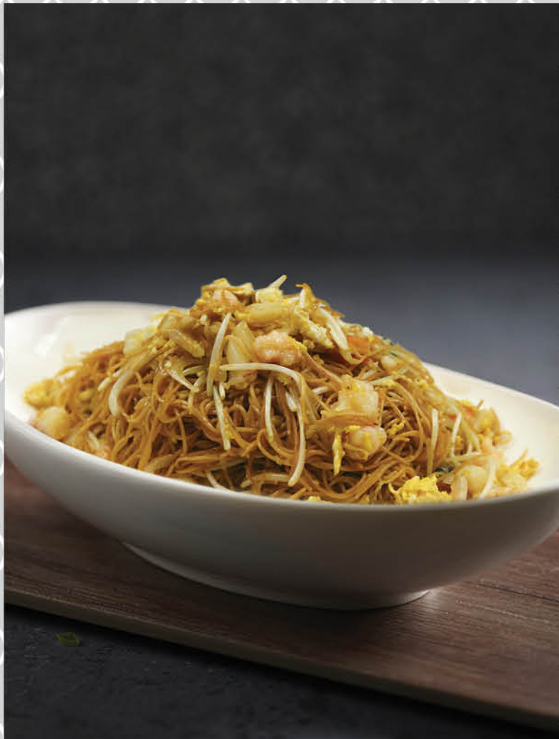
家乡海鲜炒面线 Sautéed Hong Kong Rice Noodle with Seafood (小S)