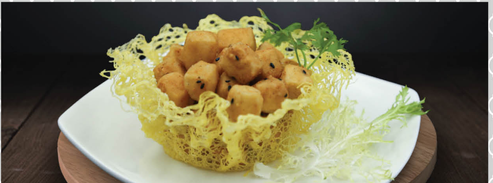
金砖椒盐豆腐 Golden Crispy Tofu Cube with Salt and Pepper