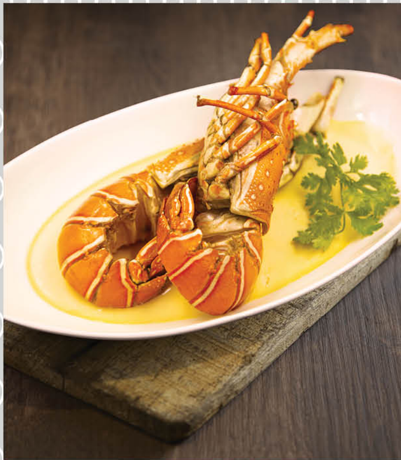
花雕鸡油蒸 Steamed with Chinese Wine and Egg White