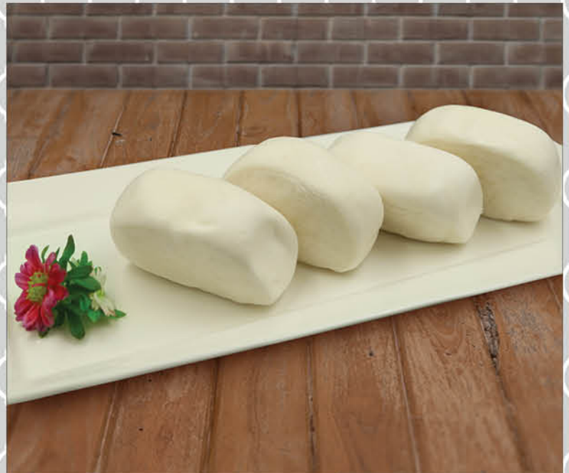
蒸馒头 Steamed Buns