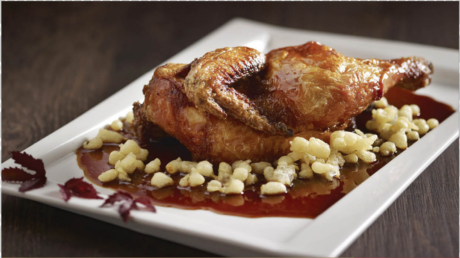
成醋香辣烧鸡 Crispy Roasted Chicken with Vinaigrette in Szechuan Style

24,800 MMK 半只 (HALF) 51,600 MMK 一只 (WHOLE)