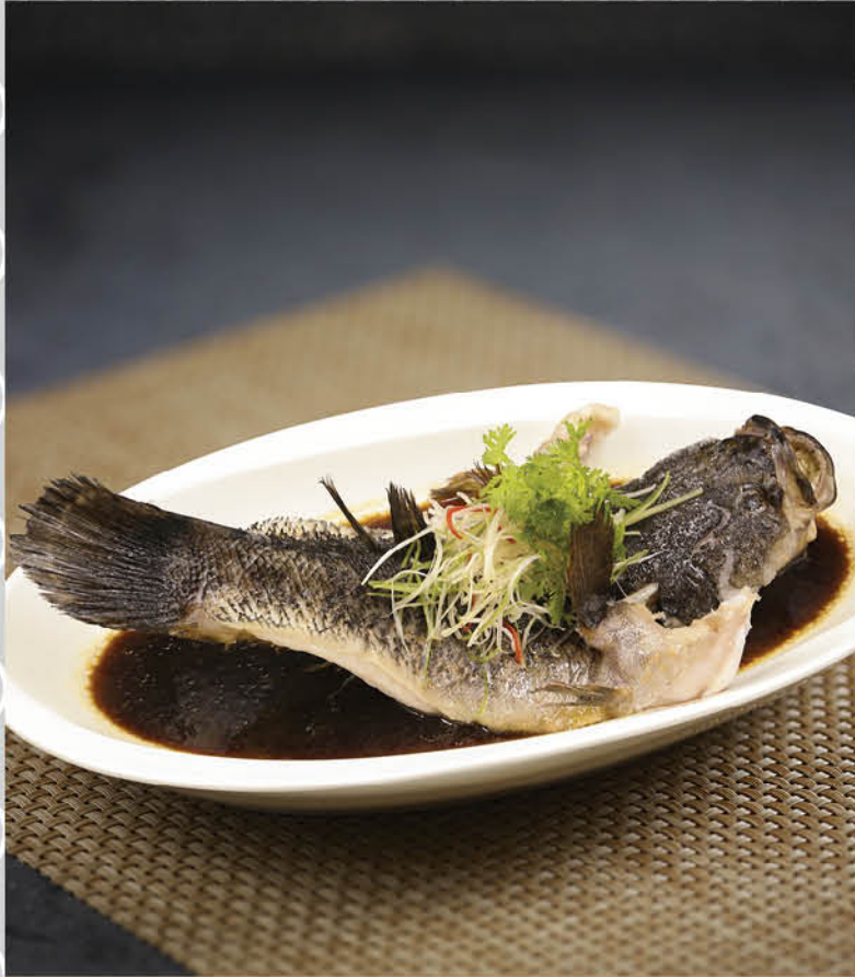
清蒸 Steamed with Supreme Soya Sauce