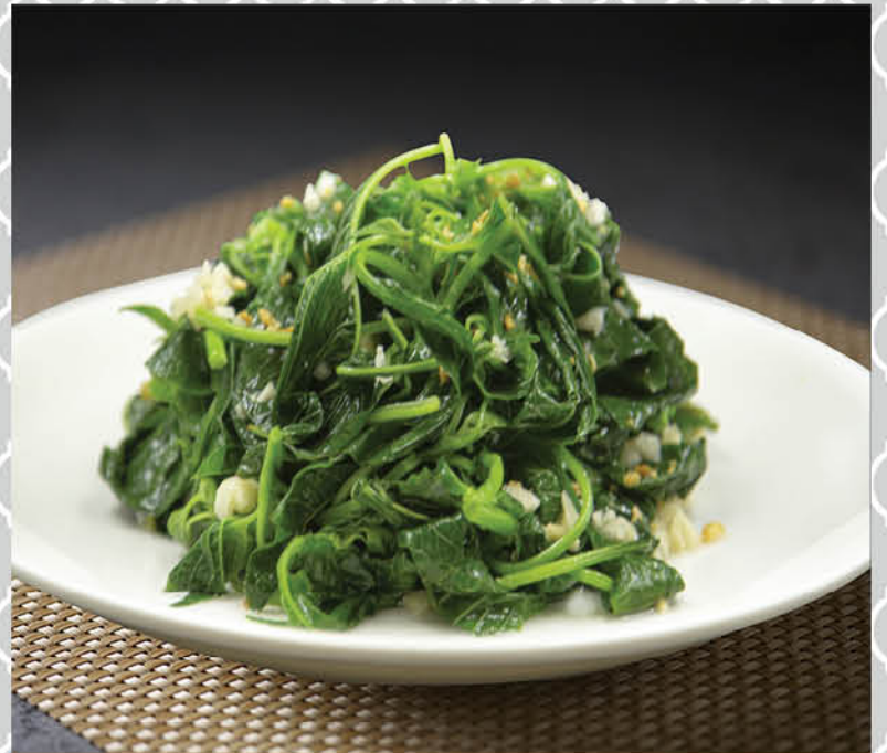
蒜茸炒 Sautéed with Minced Garlic