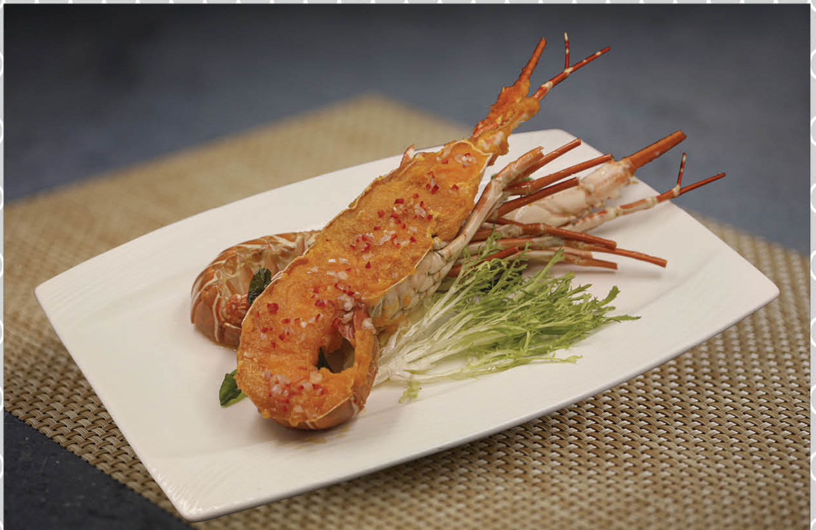
咸蛋焗 Baked in Salted Egg Yolk