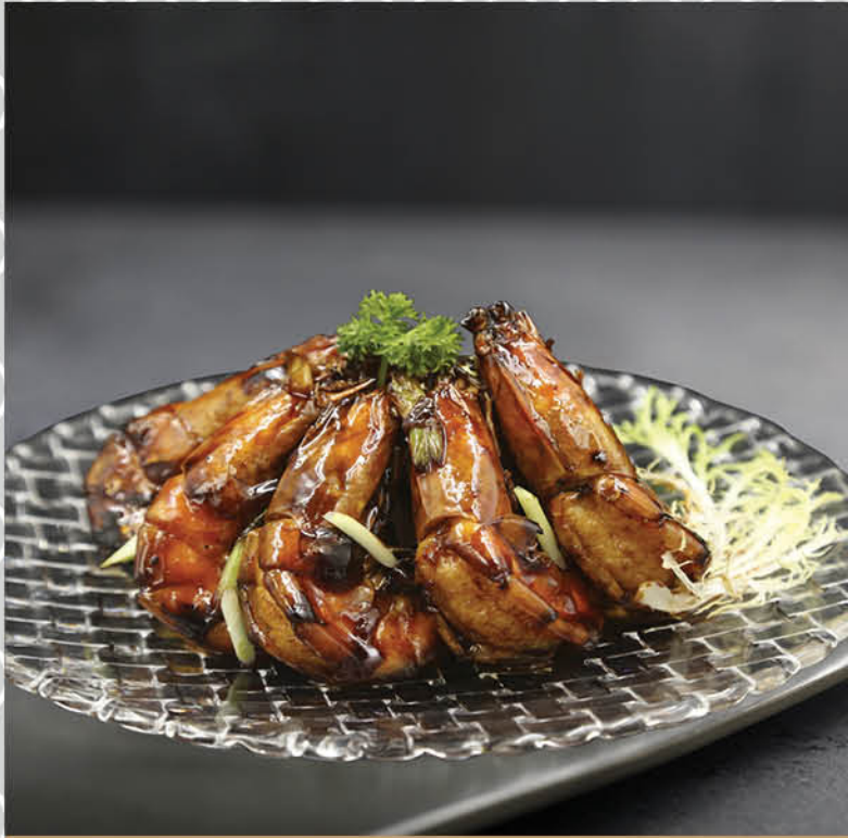
生抽王焗 Pan-fried with Supreme Soya Sauce