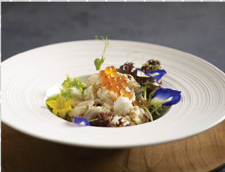
鲜蟹肉师傅沙律 Chef's Special Fresh Crab Meat Gourmet Salad