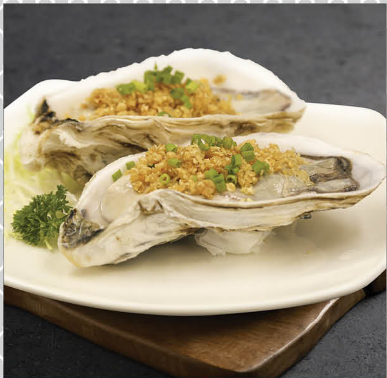
蒜茸蒸 Steamed with Minced Garlic

生蚝(小) Oyster Small at Least Two PCS Market Price 每粒 PER PIECE (最少两粒 MIN 2 PCS)