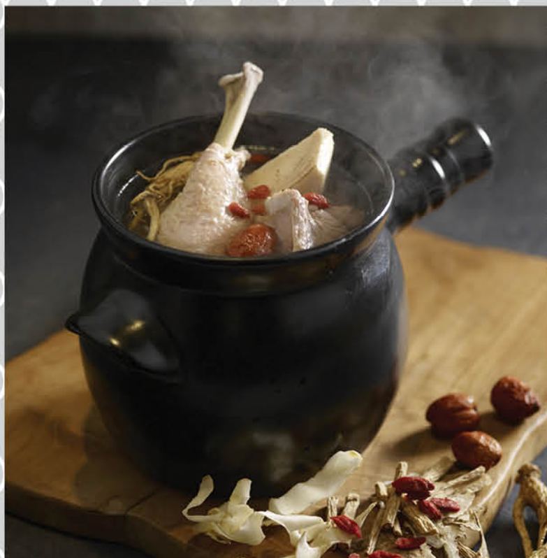
时日炖汤 - (3-4位) Daily Double-Boiled Soup