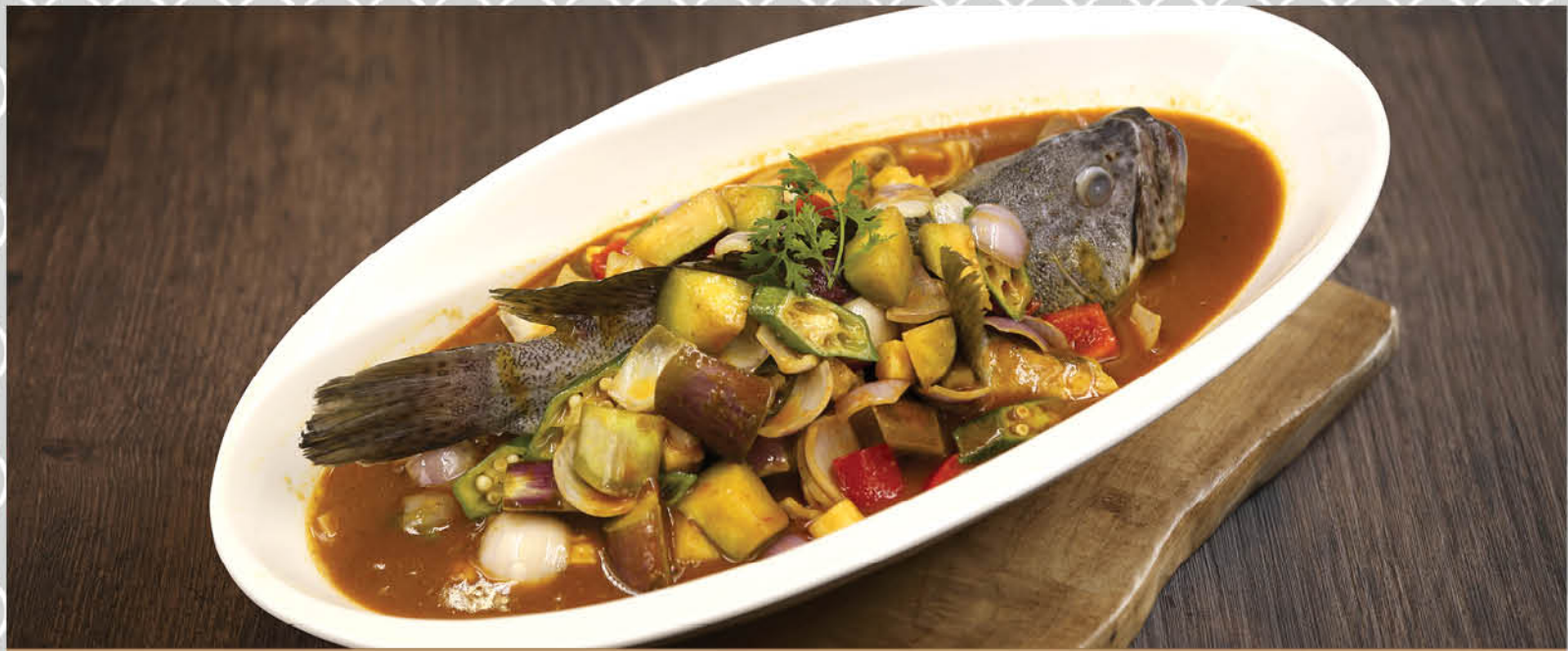
亚三蒸 Steamed with Assam Spicy Sauce

西星斑 Star Garoupa Market Price 100克 PER 100G