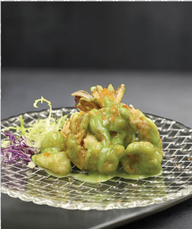
芥末虾球 Crispy-Fried Crystal Prawns with Wasabi Mayonnaise (小S)