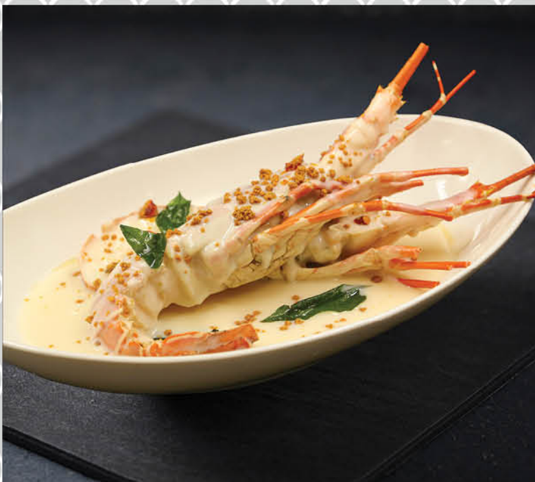
金沙奶油 Signature Creamy Butter Topped with Coconut Crumbs