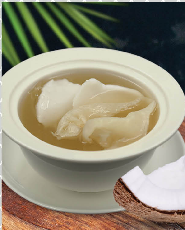
香椰鱼皇汤 (位上) Double Boiled Fish Soup with Young Coconut Flesh