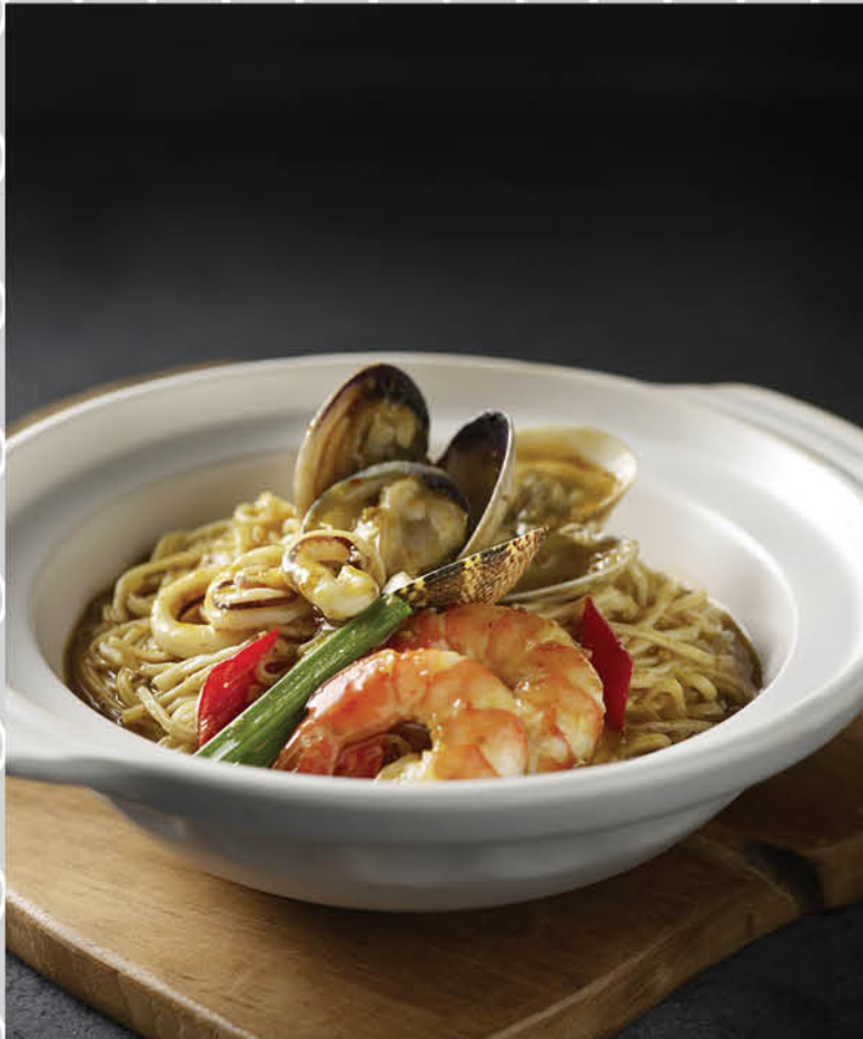
海鲜焖伊面 Stewed Ee-Fu Noodles with Assorted Seafood (小S)