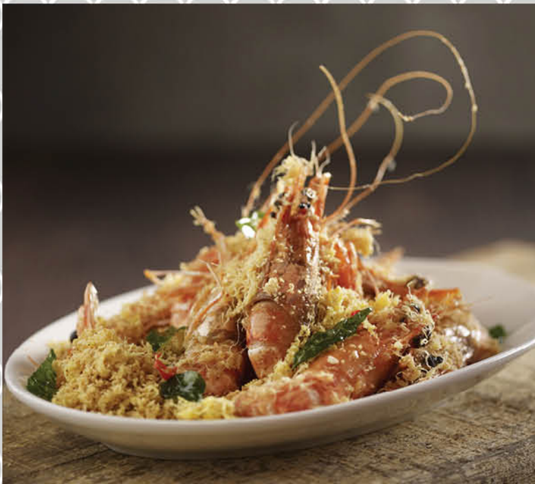
麦片蛋丝 Tossed with Cereal