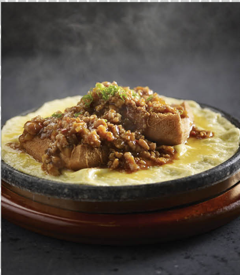
石板菜香豆腐 Stone Plate Tofu with Preserved 'Cai Xin' and Minced Pork (小S)