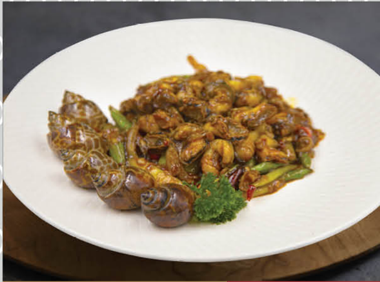
麻辣炒花螺 Spicy Sauce Fried Flower Snail (小S)