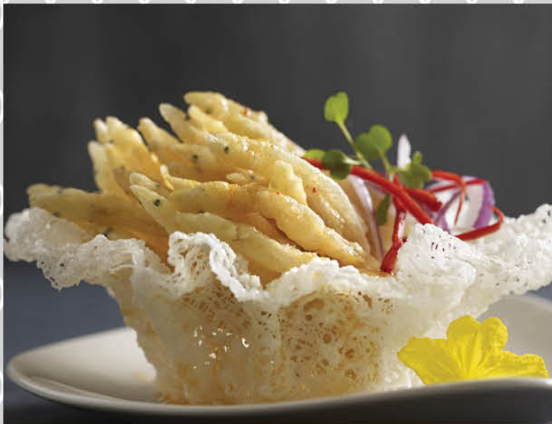
泰式白饭鱼 Thai Style Crispy-Fried Silver Bait