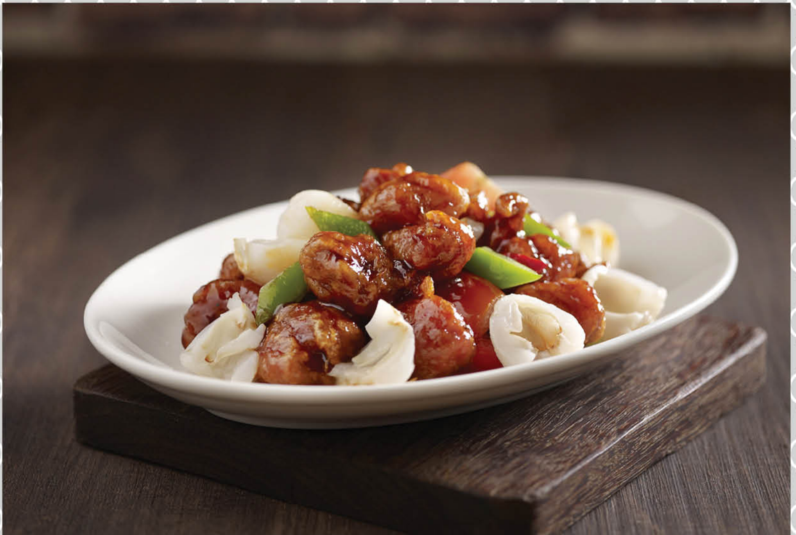
荔枝咕嚕肉 Sweet and Sour Pork with Lychee (小S)