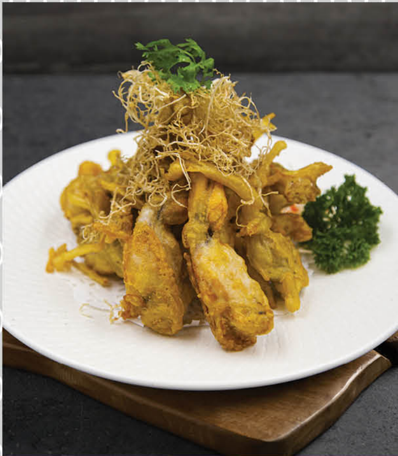
香脆姜丝炸田鸡 Deep-Fried Ginger Crispy Frog (小S)