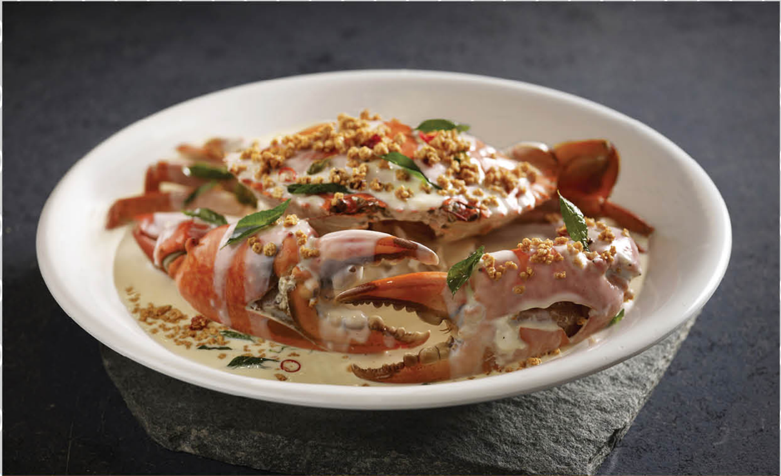
金沙奶油 Signature Creamy Butter Topped with Coconut Crumbs