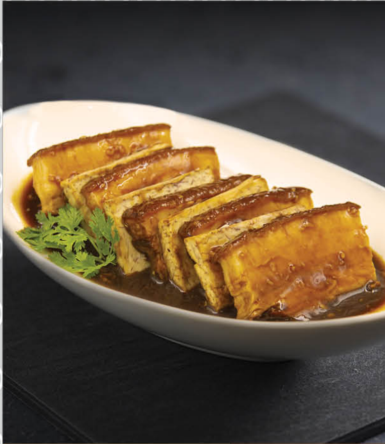
芋頭扣肉 Stewed Pork Belly with Golden Taro