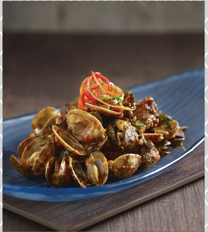
花蛤 炒甘香 Venus Clam Sautéed with Spicy Garlic Sauce (小S)