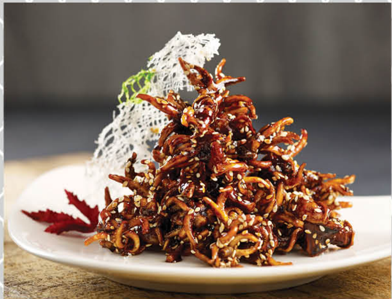
酥脆苏东仔 Crispy-Fried Baby Squid