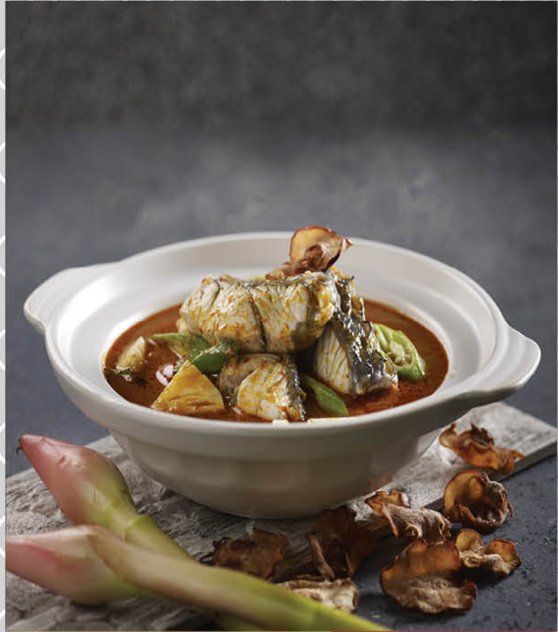
亚三蒸石斑鱼 Steamed Garoupa with Assam Spicy Sauce (小 S)