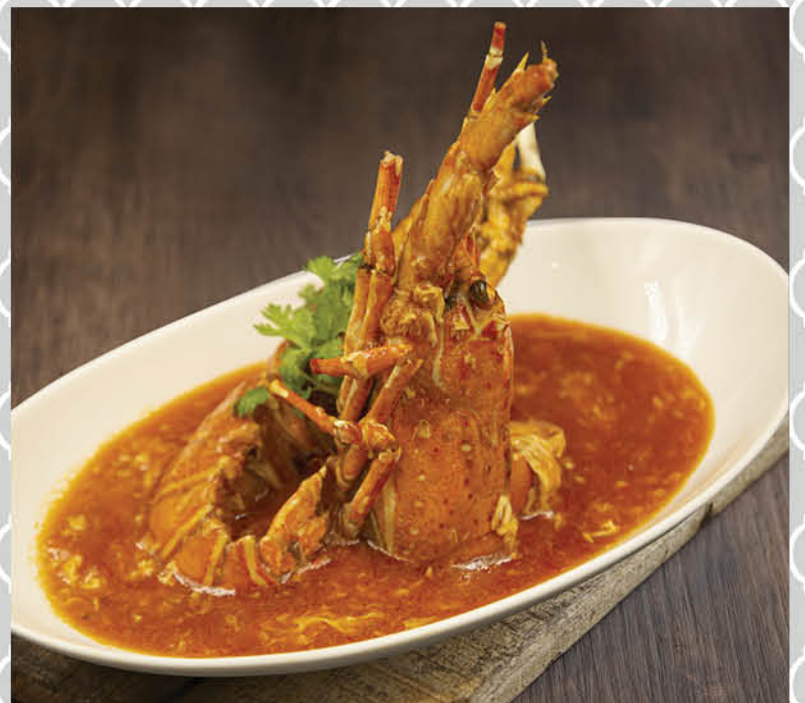
新加坡辣椒焗 Popular Singapore Style Chilli