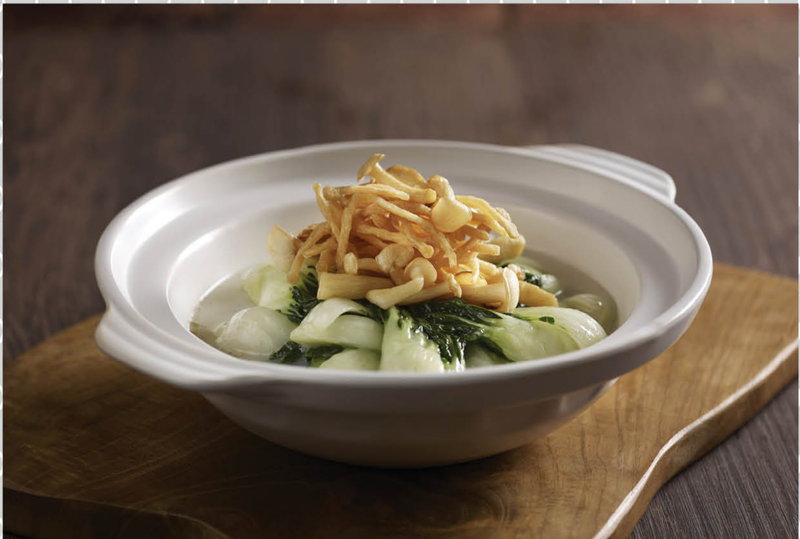
鱼汤浸奶白菜煲 Braised Baby Cabbage in Superior Fish Stock (小S)