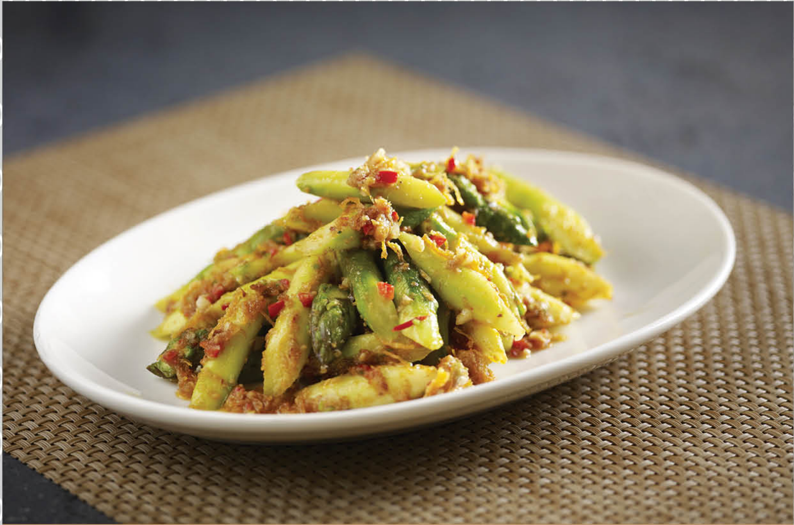
XO炒 Sautéed with XO Sauce