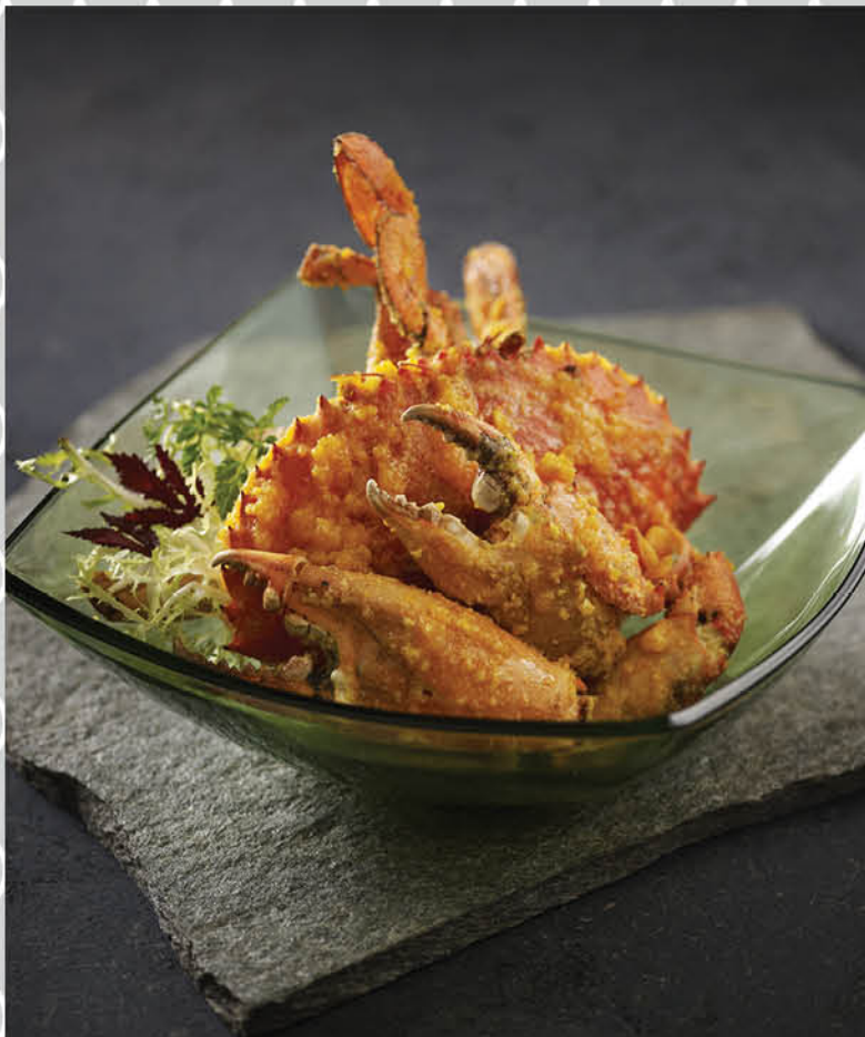
黄金焗咸蛋 Baked with Salted Egg Yolk