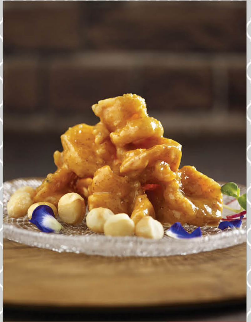
酱爆虾球 Crispy-Fried Crystal Prawns Tossed with Salad Sauce, Macadamia Nuts and Ebiko (小S)