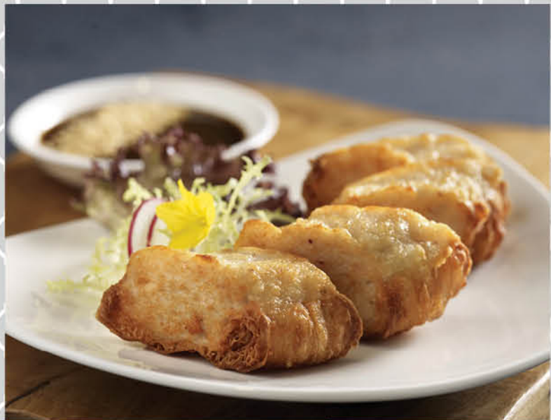
黄金炸油条 Crispy Dough Fritters Stuffed with Seafood Paste