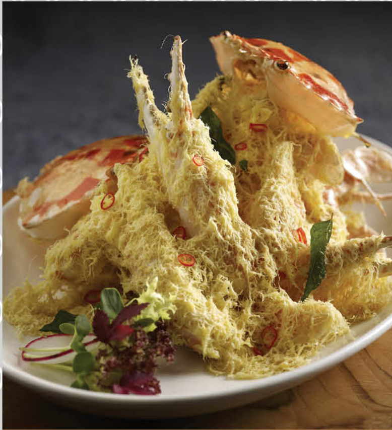
麦片蛋丝 Tossed with Cereal