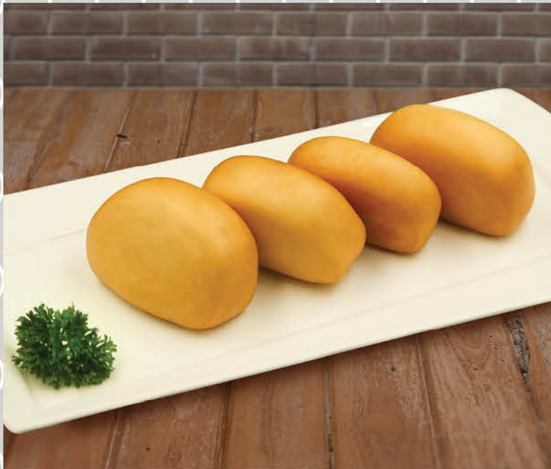
炸馒头 Deep-Fried Buns