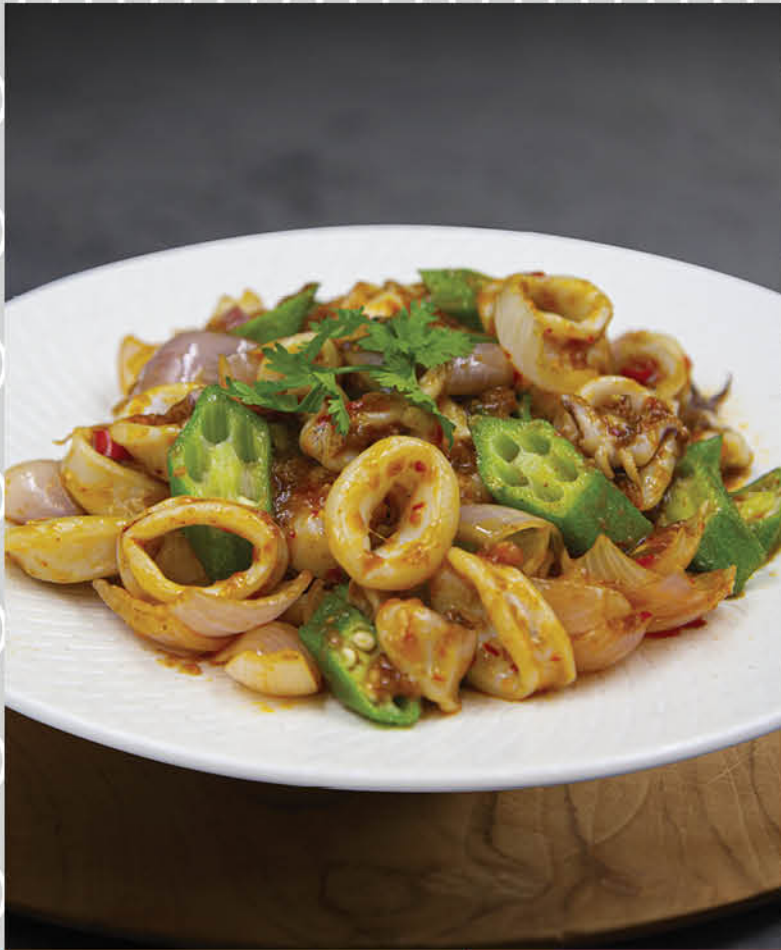
三巴炒苏东 Squid Fried With Sambal Sauce (小S)