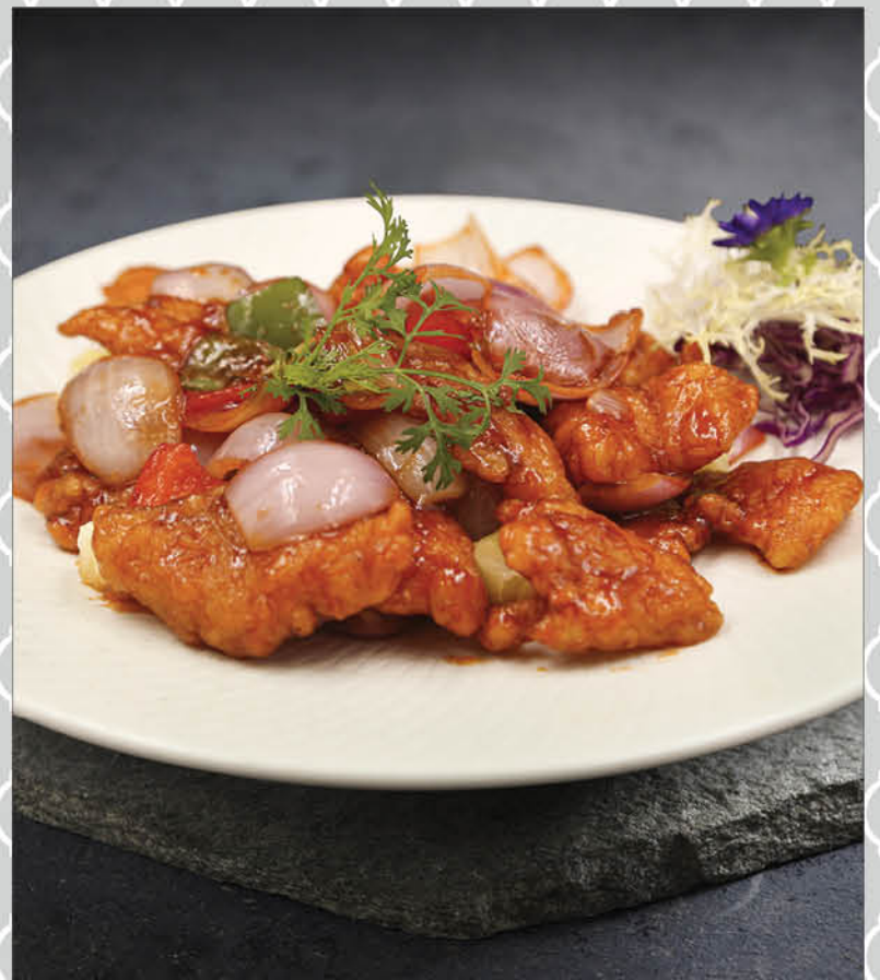
糖醋炸石斑鱼 Deep-Fried Garoupa with Sweet and Sour Sauce (小 S)