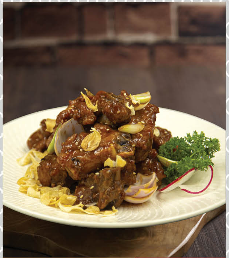
特色好味排骨 Stewed Pork Ribs with Homemade Honey Soya Sauce (小S)