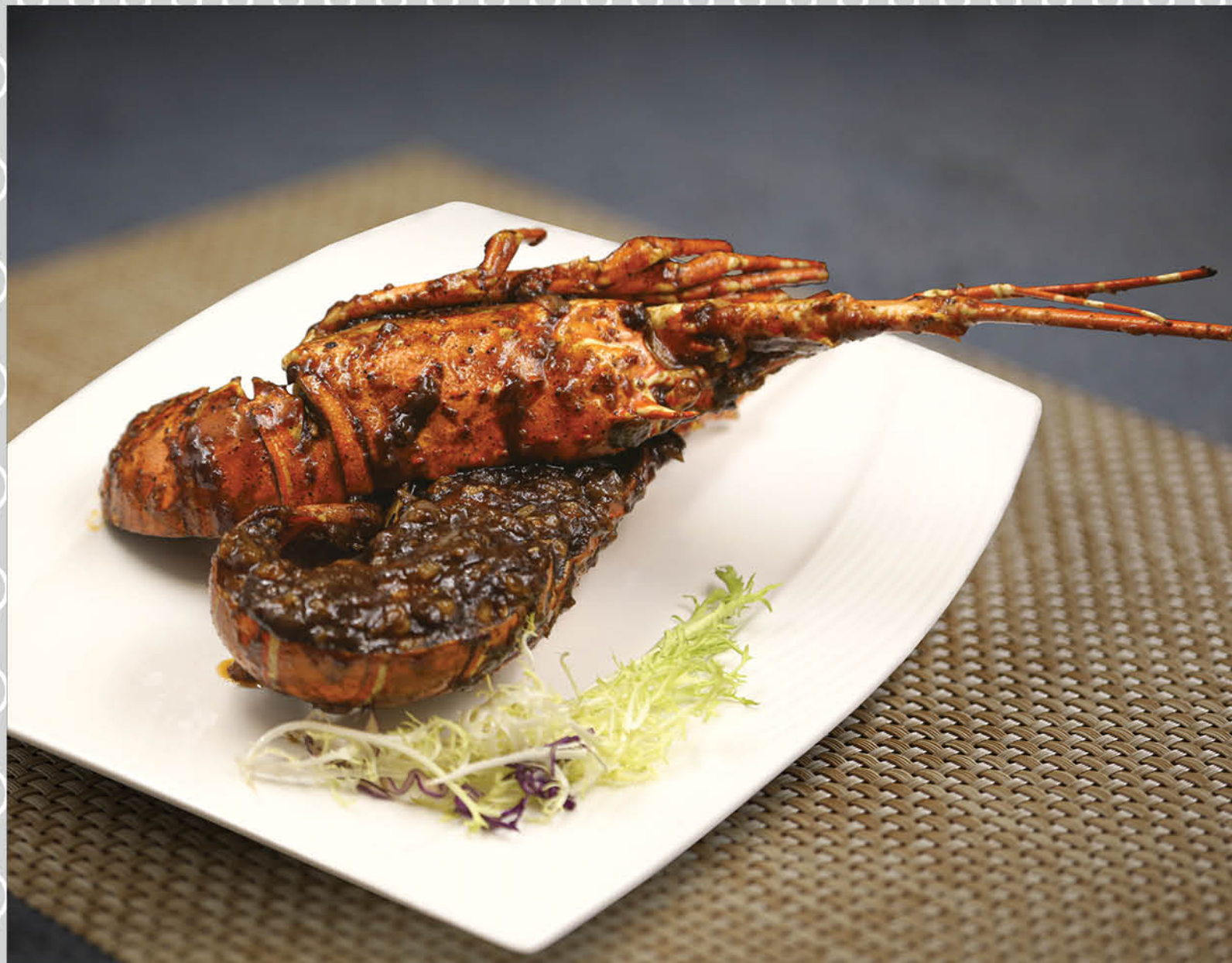
炒黑胡椒 Black Pepper