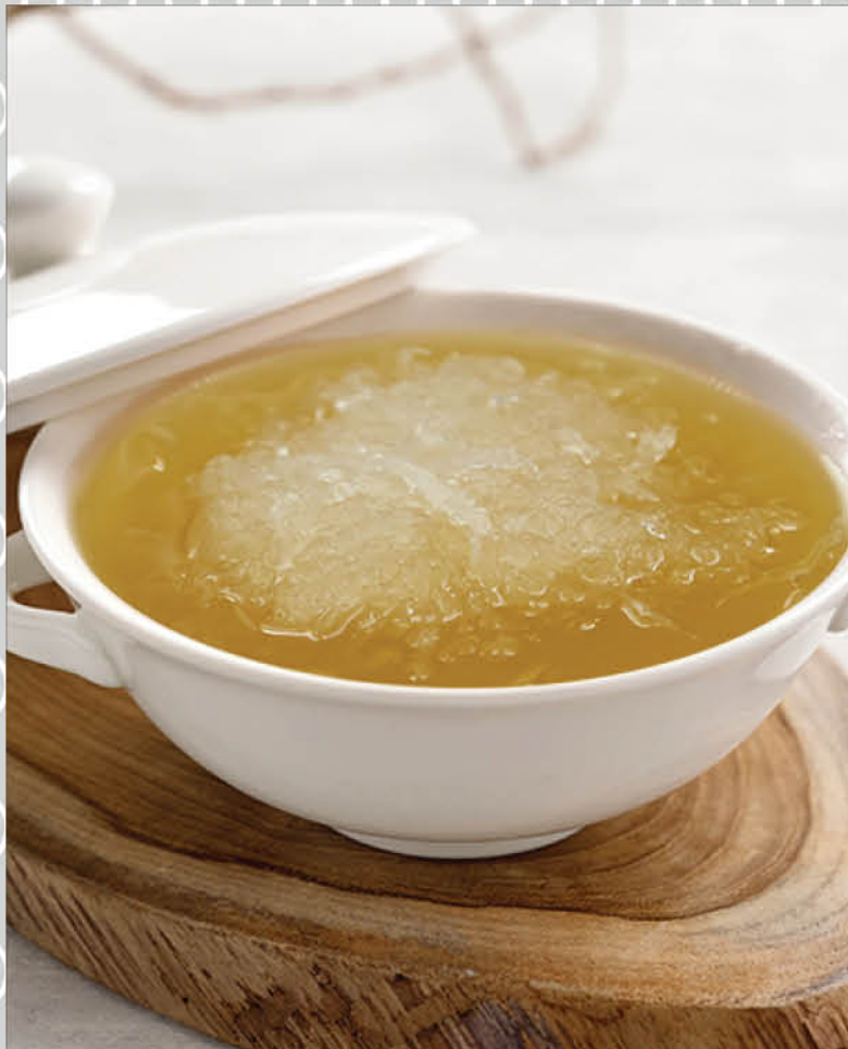
燕窝鱼王汤 (位上) Double-Boiled Bird's Nest In Supreme Fish Soup