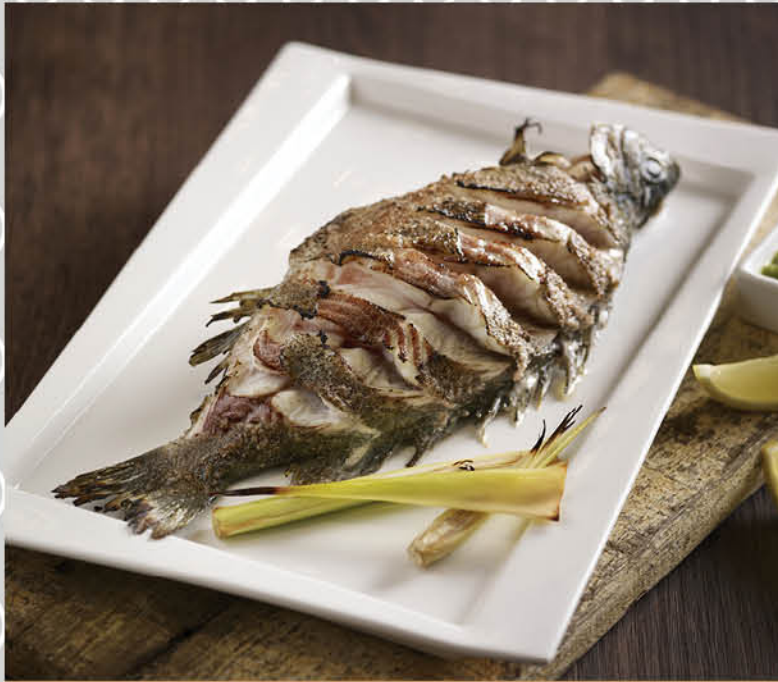
盐烧焗 Baked with Sea Salt