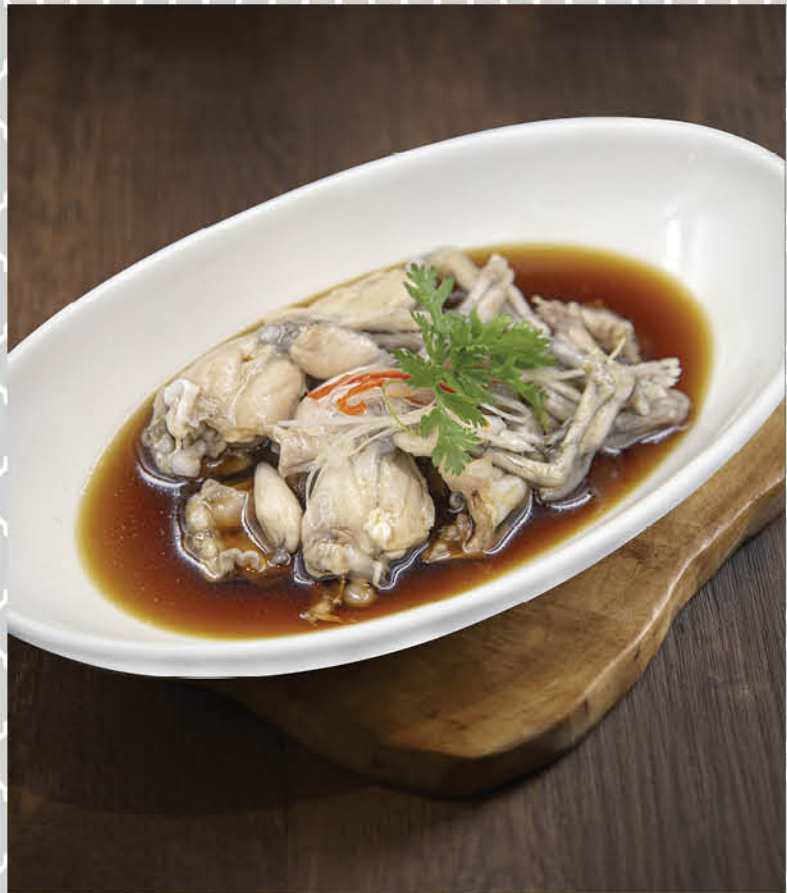
鸡精蒸田鸡 Brand's Chicken Drink Steamed Frog (小S)