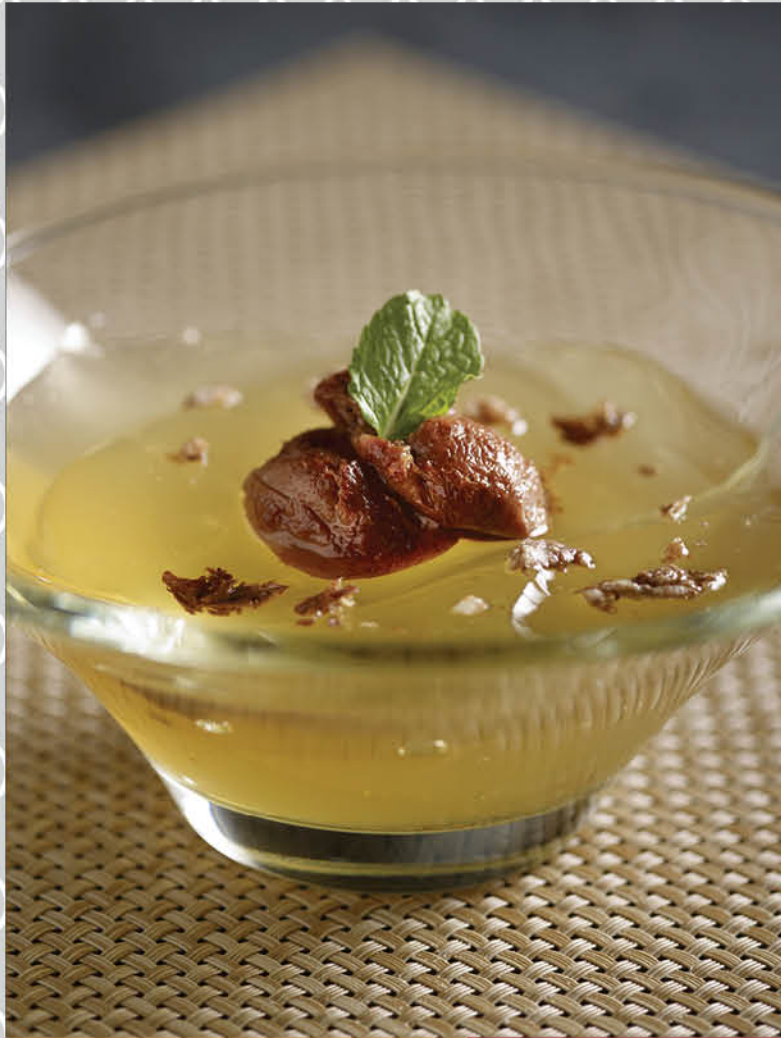
话梅香茅果冻 Chilled Lemongrass Jelly in Lemonade and Sour Plum Juice