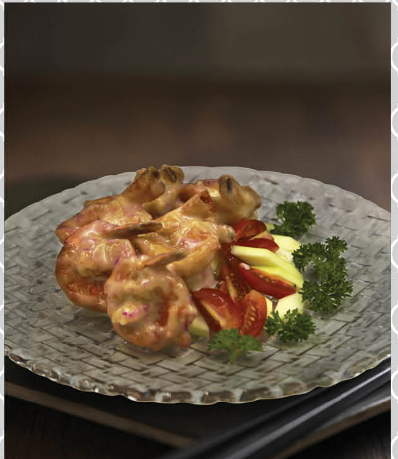
沙律虾球 Crispy-Fried Crystal Prawns with Mayonnaise (小S)