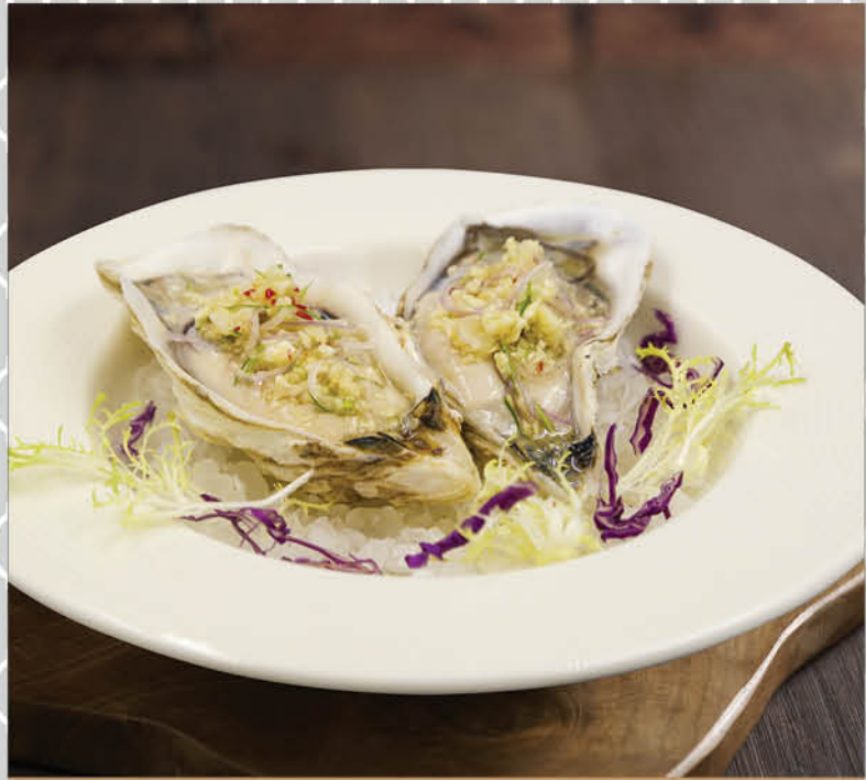
泰式冻吃 Chilled in Thai Style