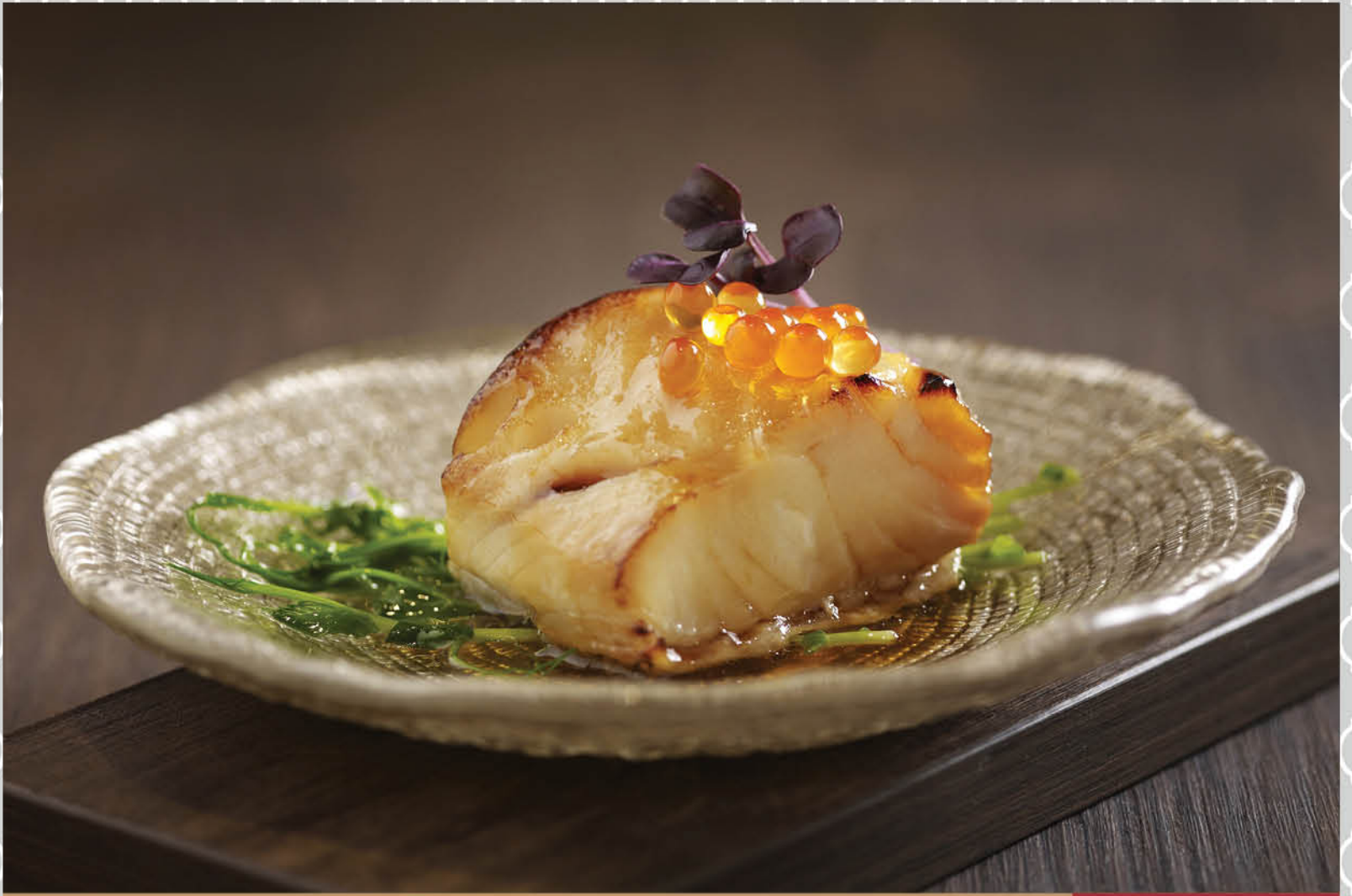
蜜汁焗鳕鱼 Baked Cod Fish with Honey Sauce