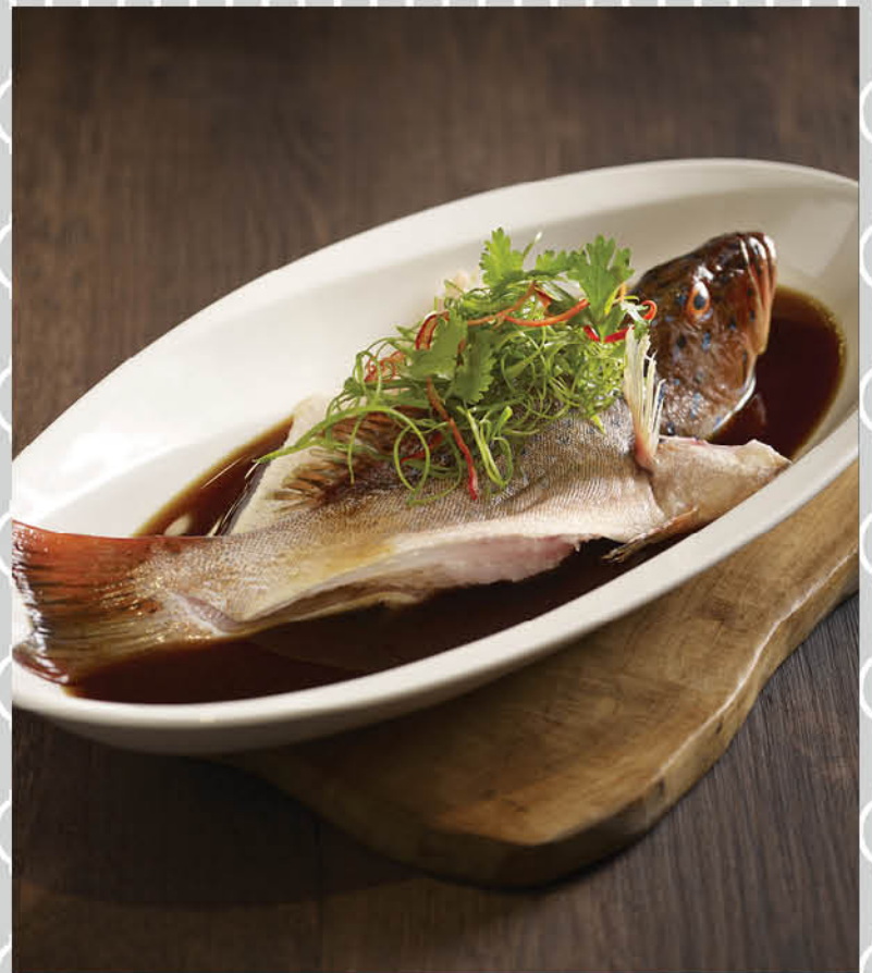
清蒸 Steamed with Supreme Soya Sauce