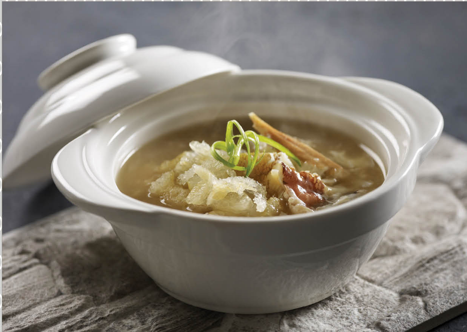
蟹肉鱼鳔羹 (位上) Braised Dried Fish Maw and Crab Meat Soup