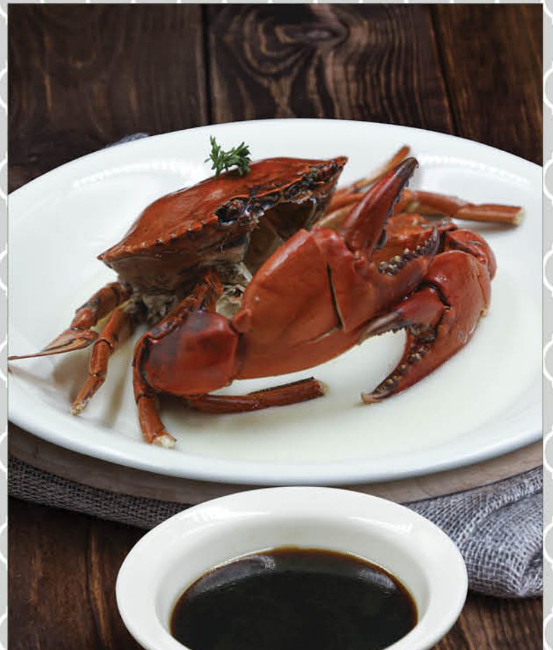
清蒸 Steamed with Supreme Soya Sauce