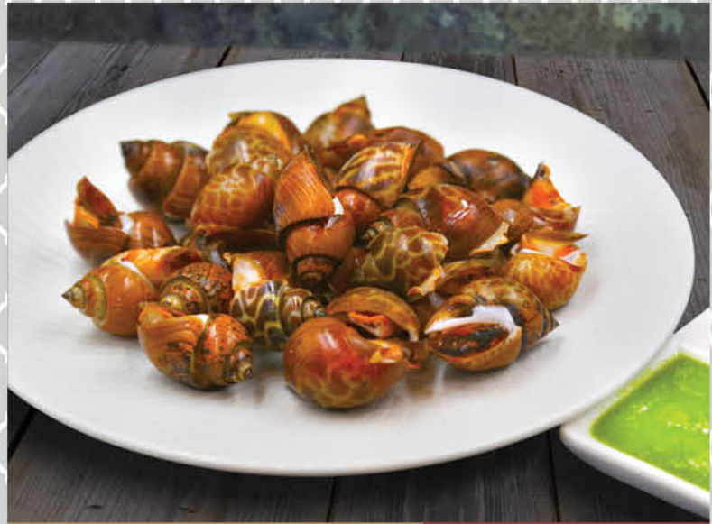
白灼花螺 Poached Flower Snail (小S)