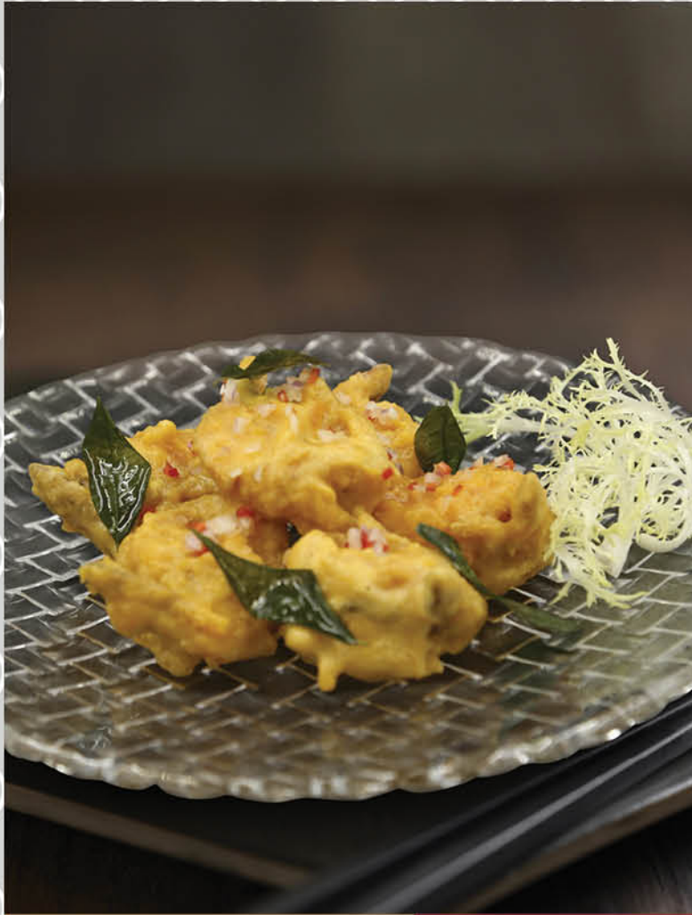
咸蛋虾球 Crispy-Fried Crystal Prawns with Salted Egg Yolk (小S)