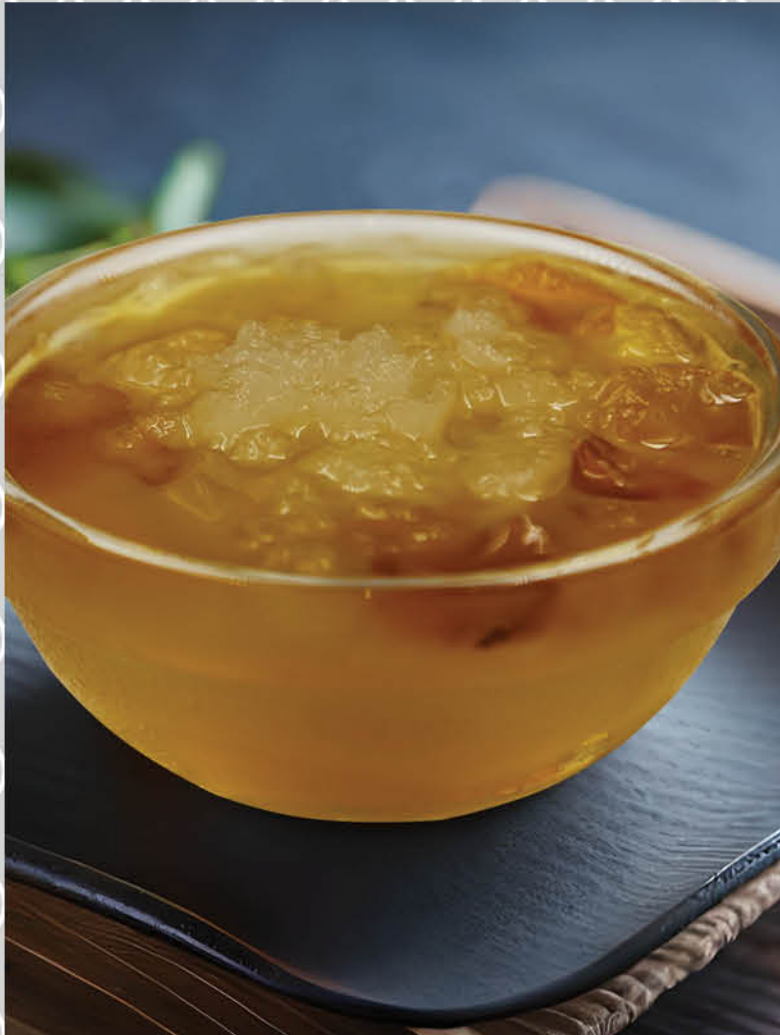
炖雪蛤 (冷/热) Double-Boiled Hashima with Peach Resin (Cold/Warm)