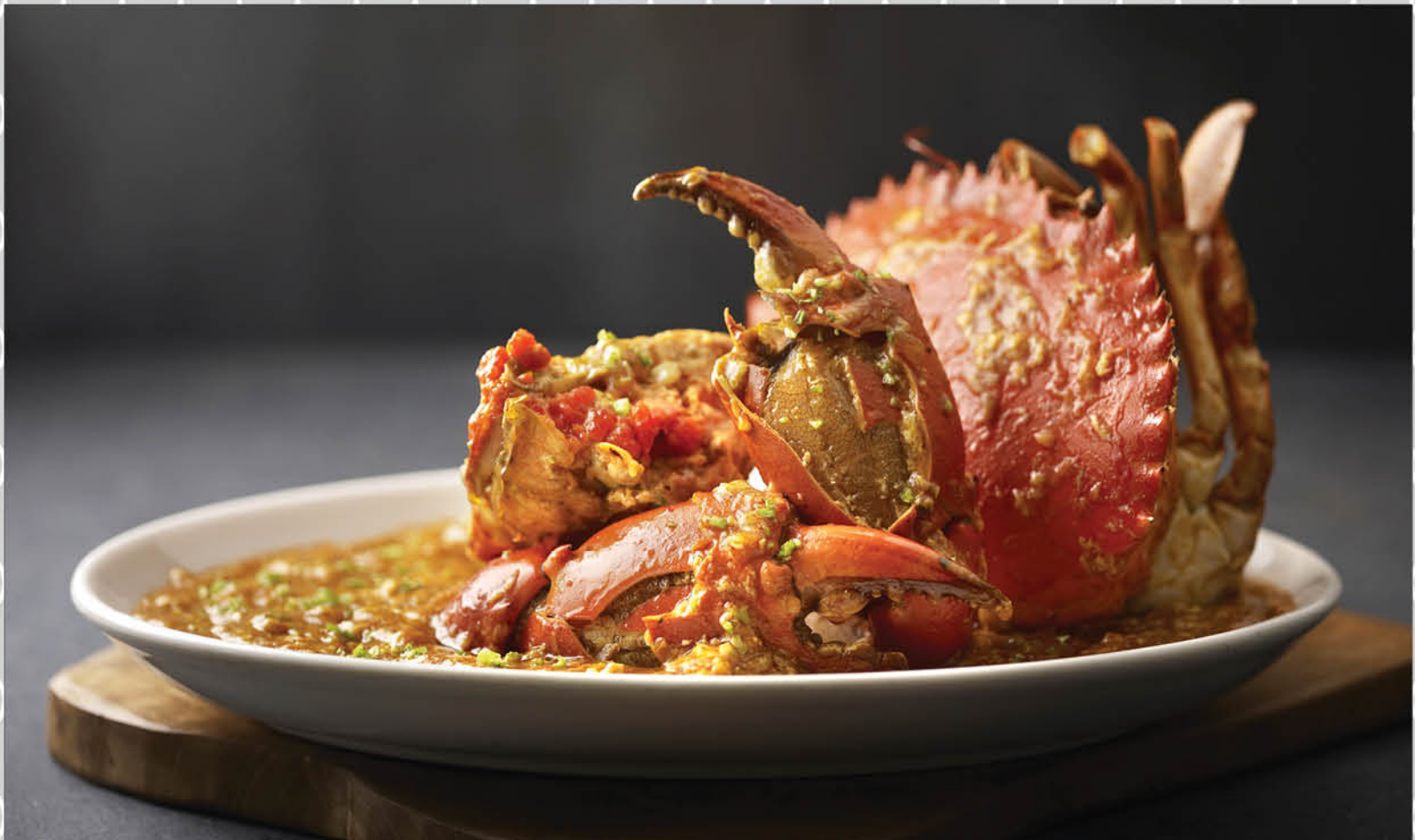
新加坡辣椒焗 Popular Singapore Chilli Style