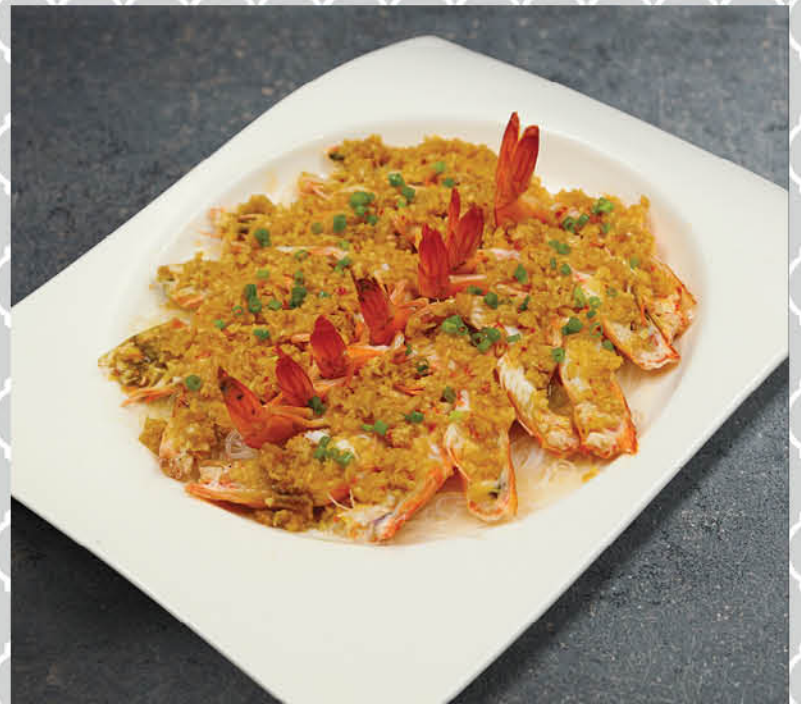
蒜茸蒸 Steamed with Minced Garlic