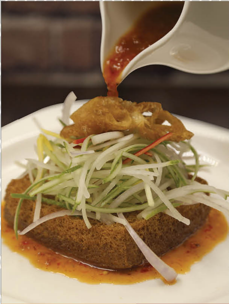
泰式炸手工豆腐 Crispy Tofu in Thai Sauce (小S)