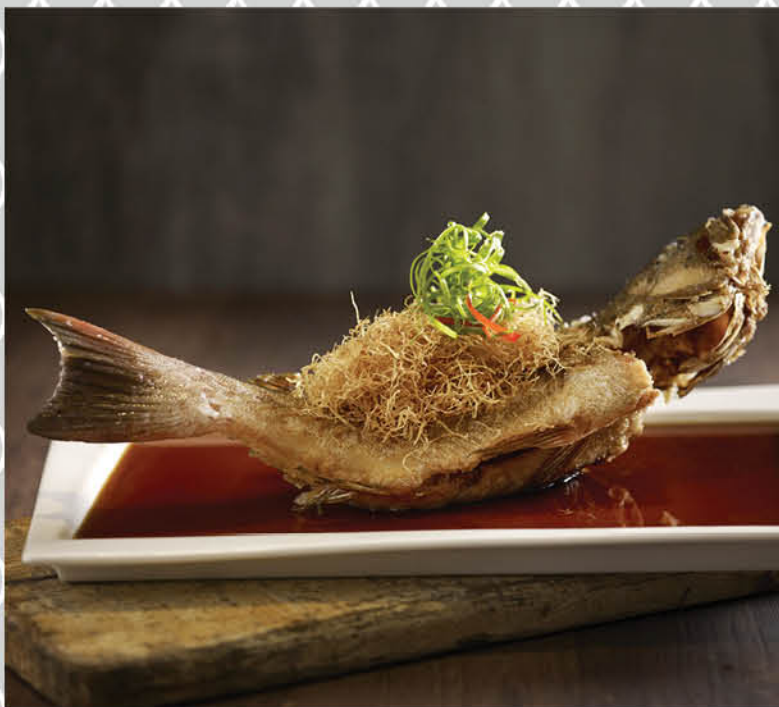
油浸 Deep-Fried with Supreme Soya Sauce