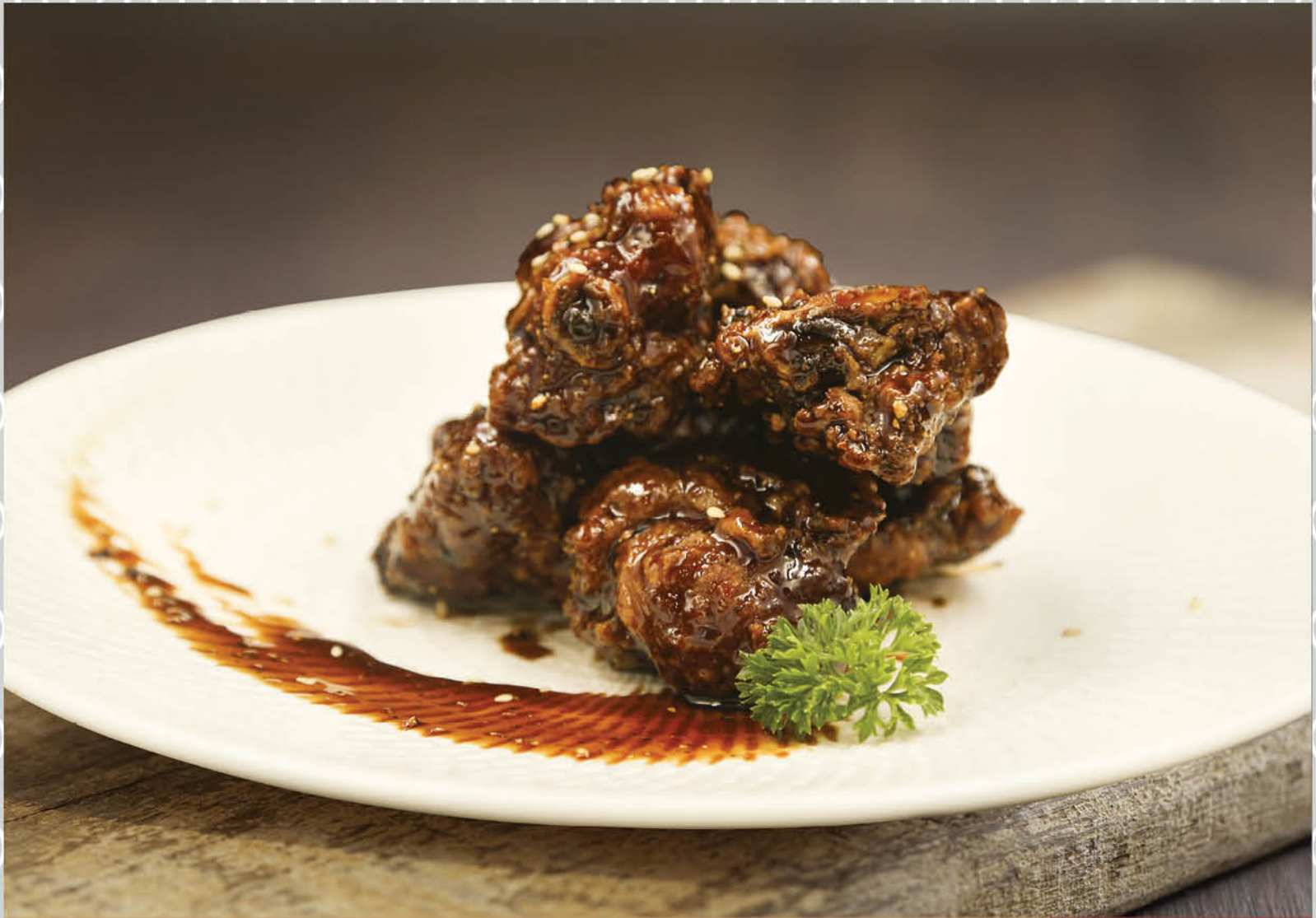
招牌蜜椒排骨 Baked Pork Belly Ribs with Honey Pepper Sauce (小S)