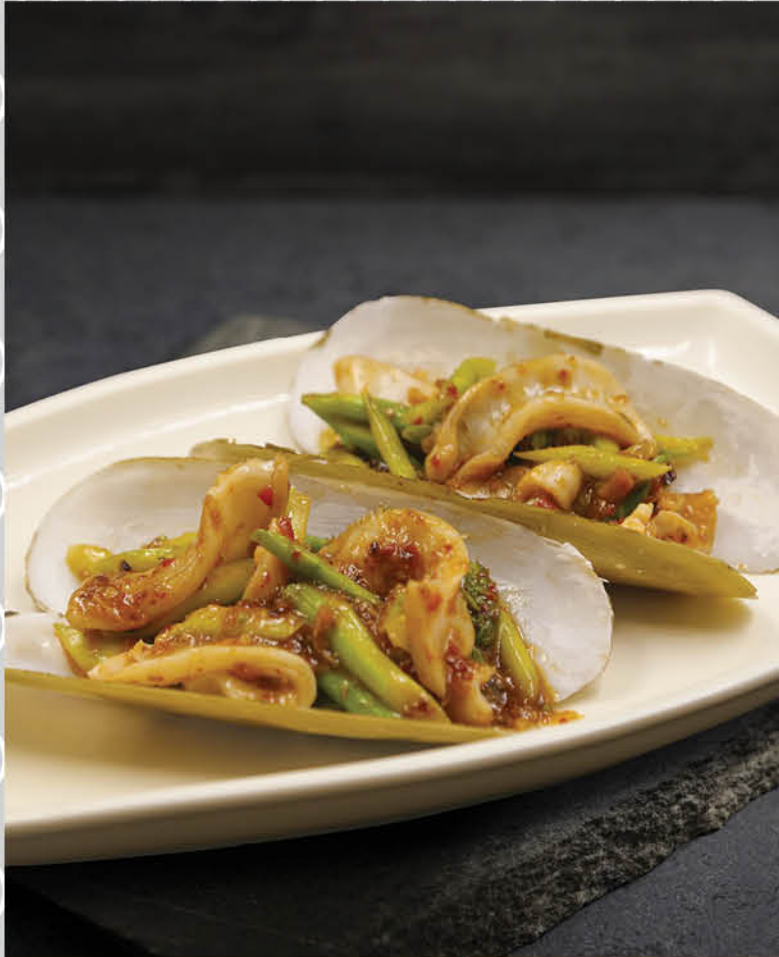
XO酱炒圣子蚌 Live Bamboo Clam Sauteed with XO Sauce