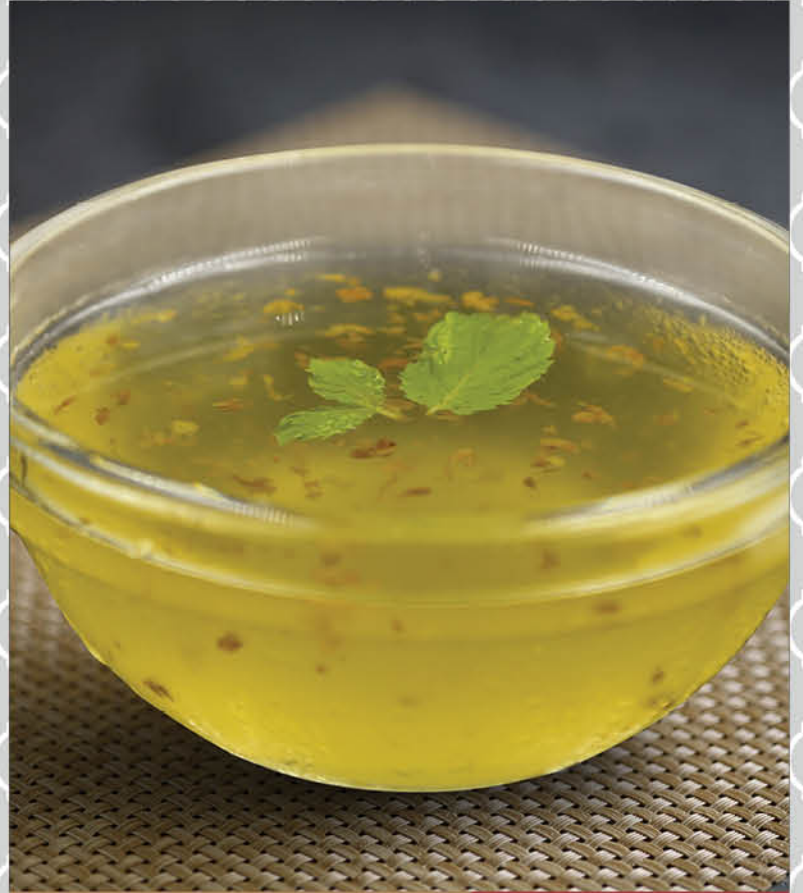
桂花飘香 Chilled Osmanthus Jelly