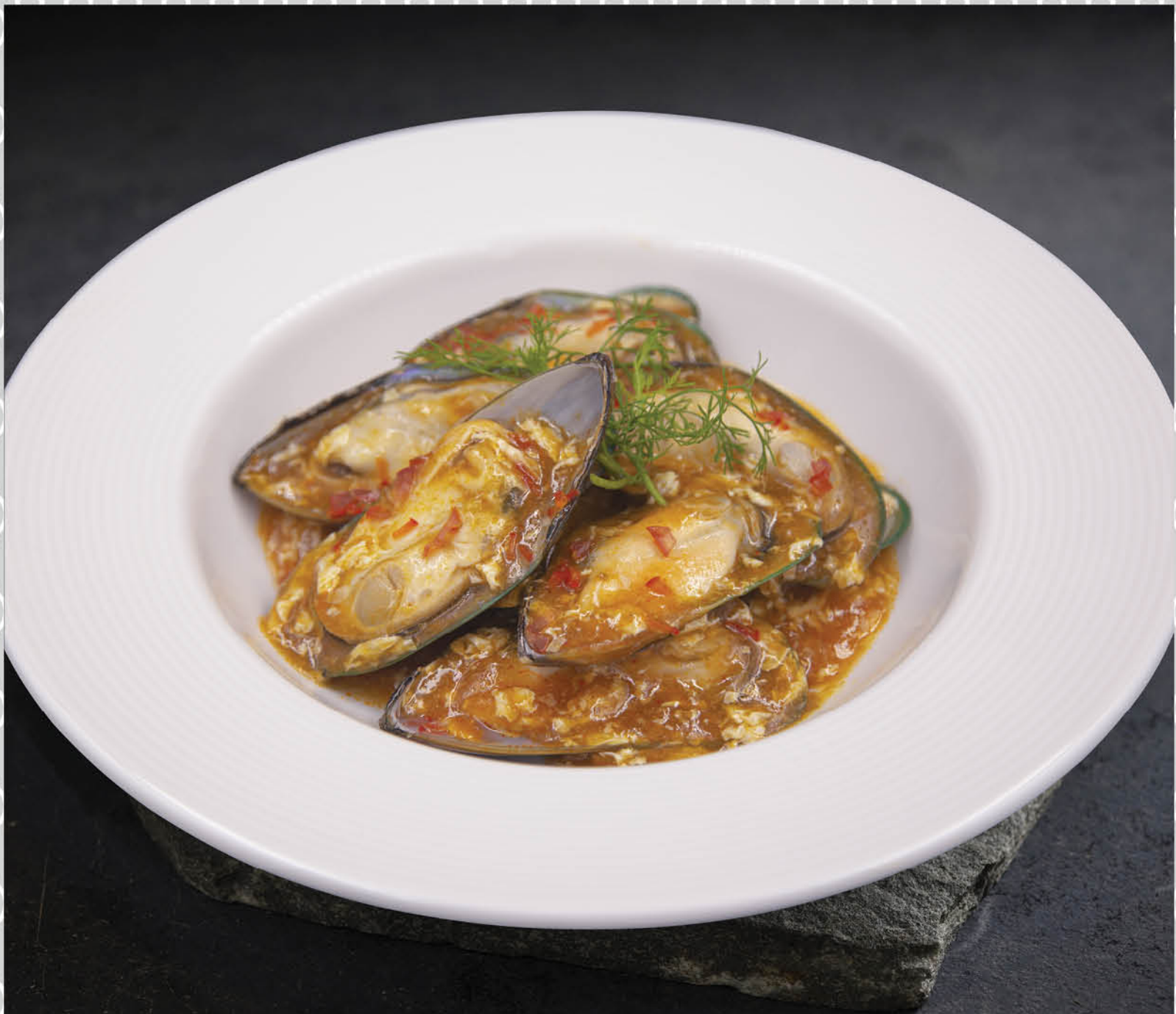
辣子炒青口贝 Green Mussel Sautéed with Chilli (小S)