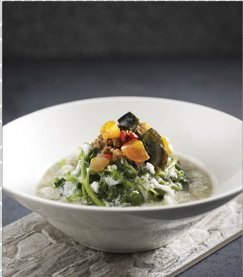
金银蛋苋菜苗 Poached Baby Spinach with Trio Eggs in Superior Broth (小S)