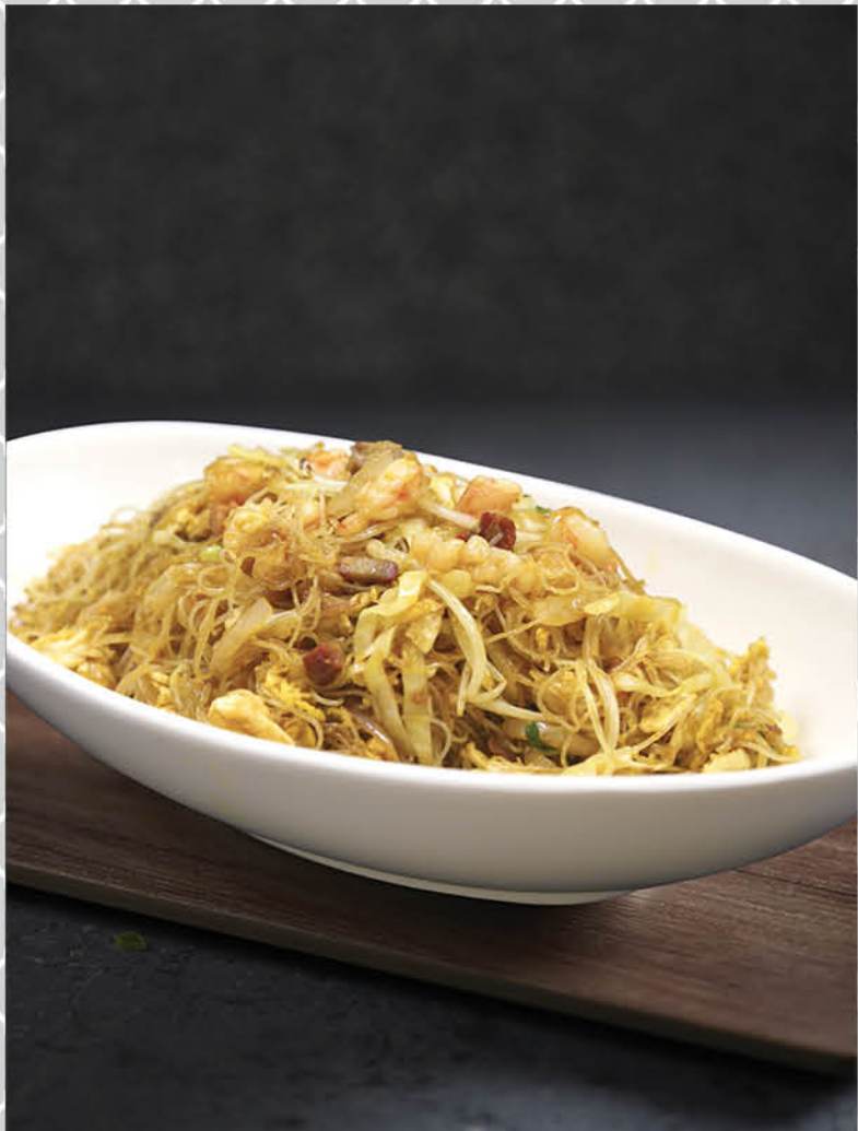
星州米粉 Sautéed Bee Hoon in Singapore Style (小S)