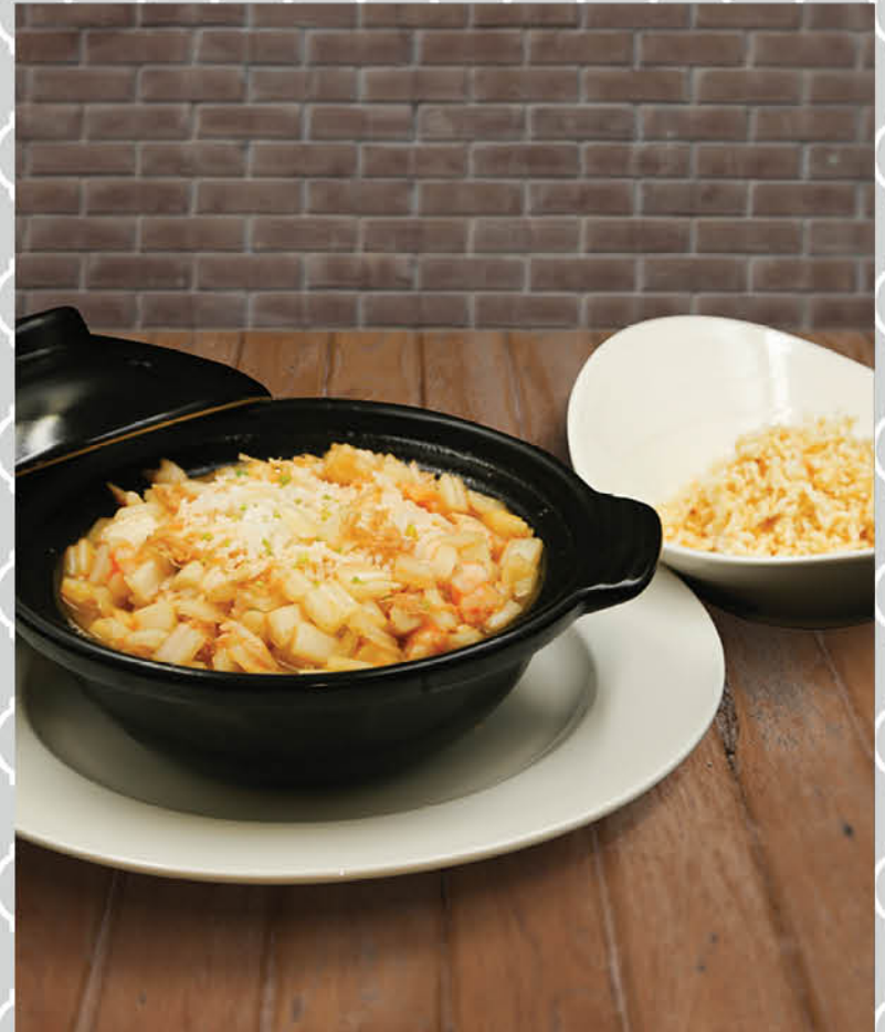
龙虾汤海鲜泡饭 Poached Rice with Seafood in Superior Lobster Broth (小S)