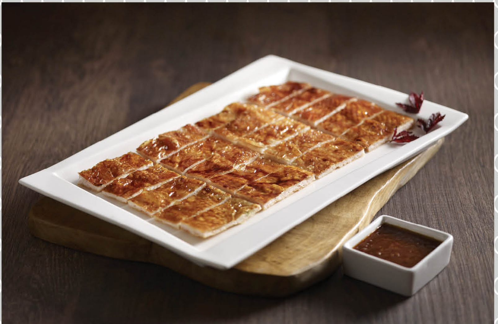
传统金龙鸡 Crispy Phoenix Chicken

19,800 MMK 半只 (HALF) 39,600 MMK 一只 (WHOLE)