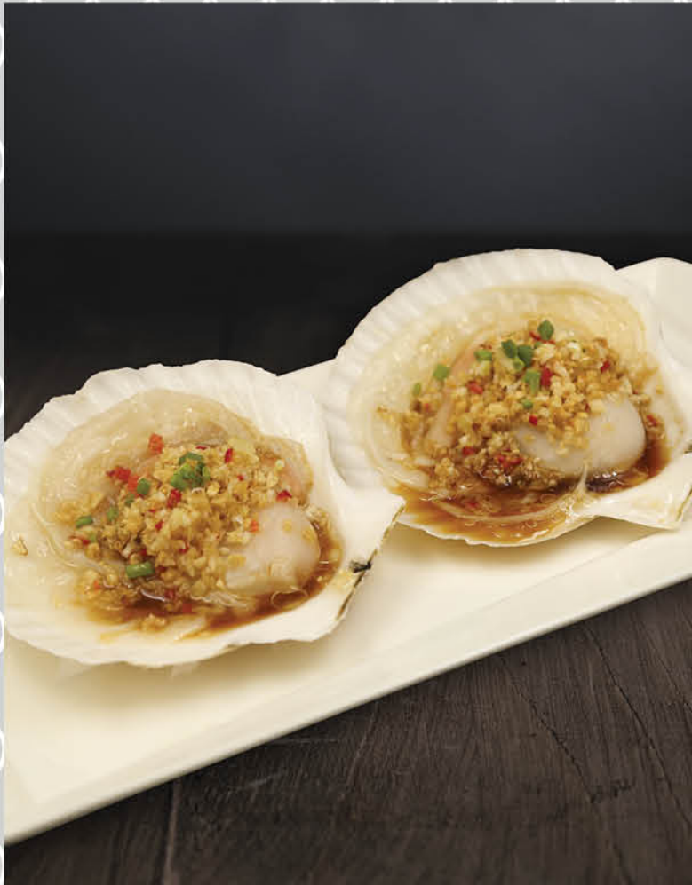
蒜茸蒸扇贝 Scallops Steamed with Minced Garlic