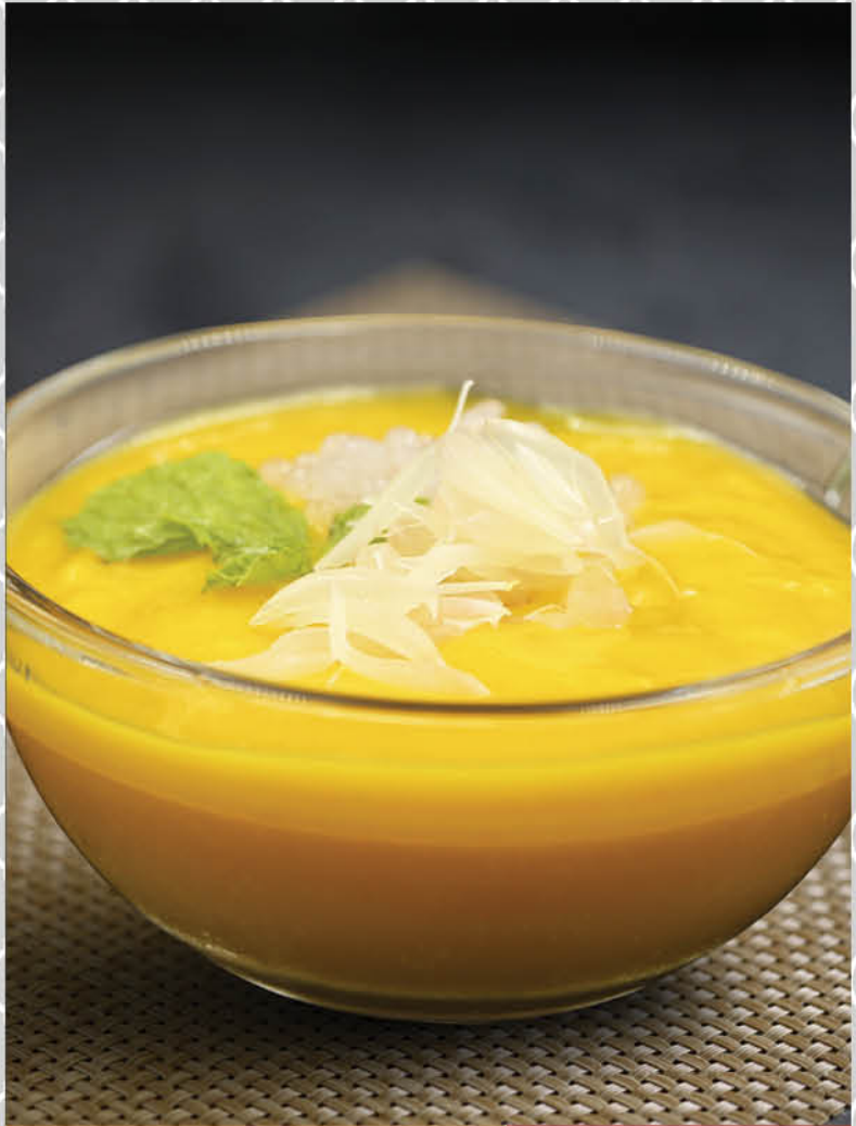
杨枝甘露 Chilled Mango Sago with Pomelo