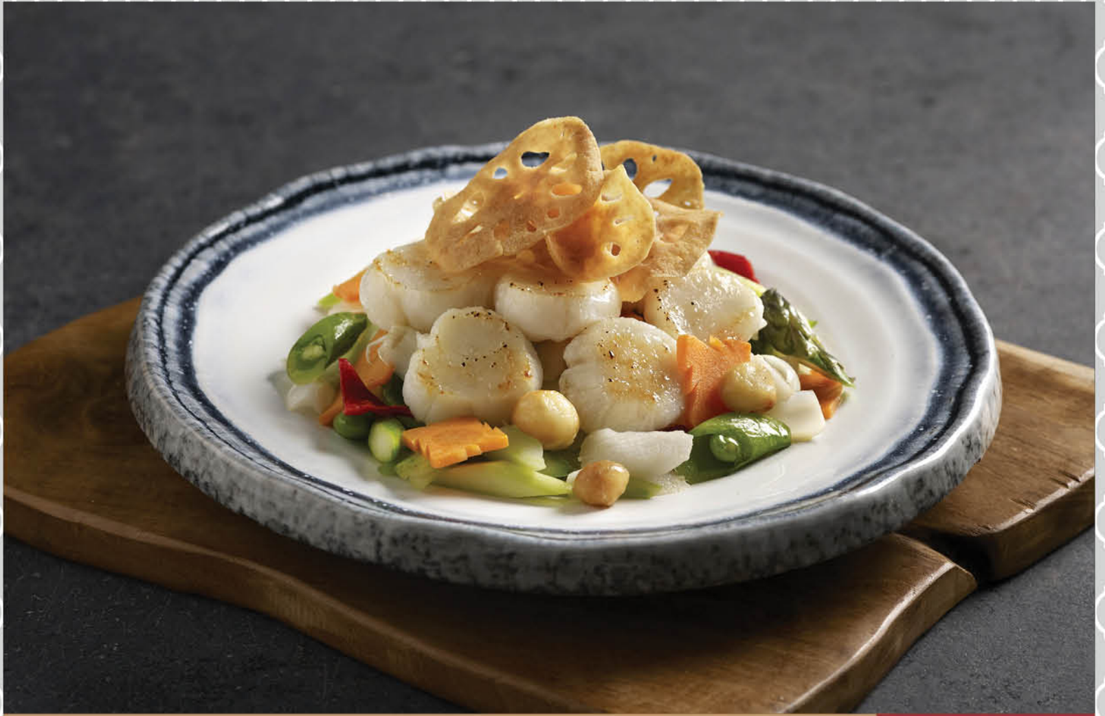
甜脆八景炒带子 Assorted Vegetables with Scallops (小S)