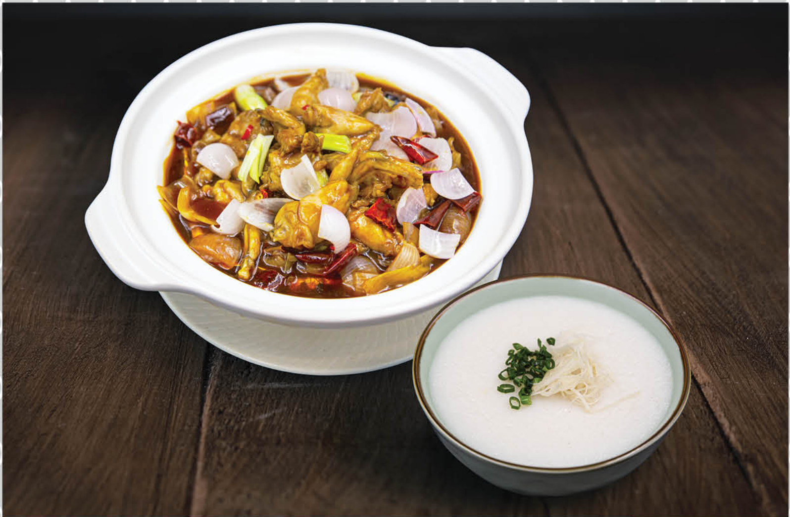
宫保爆炒田鸡+香滑粥 Spicy-Fried Kung Pao Frog and Congee (小S)