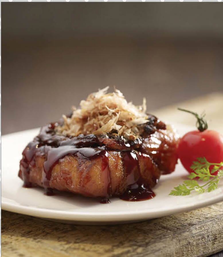
生抽煎金目鲈 Pan-Fried Sea Bass with Supreme Soya Sauce