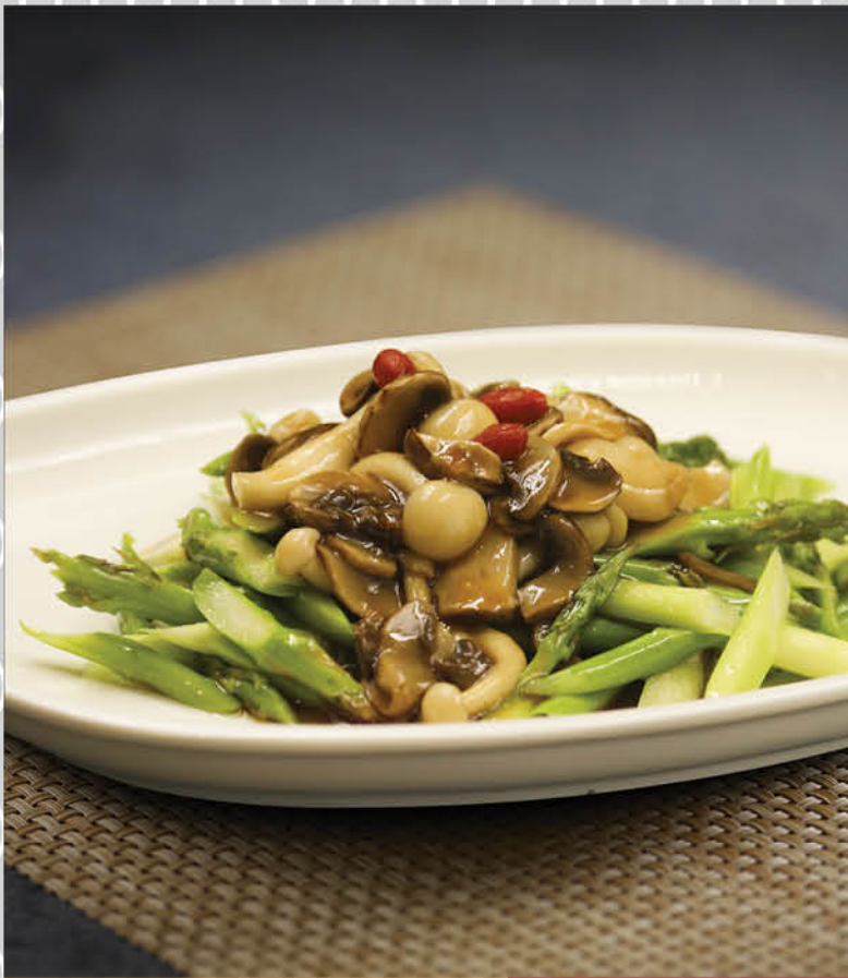
鲍汁野菌芦笋 Sautéed Wild Mushroom and Asparagus with Abalone Sauce (小S)