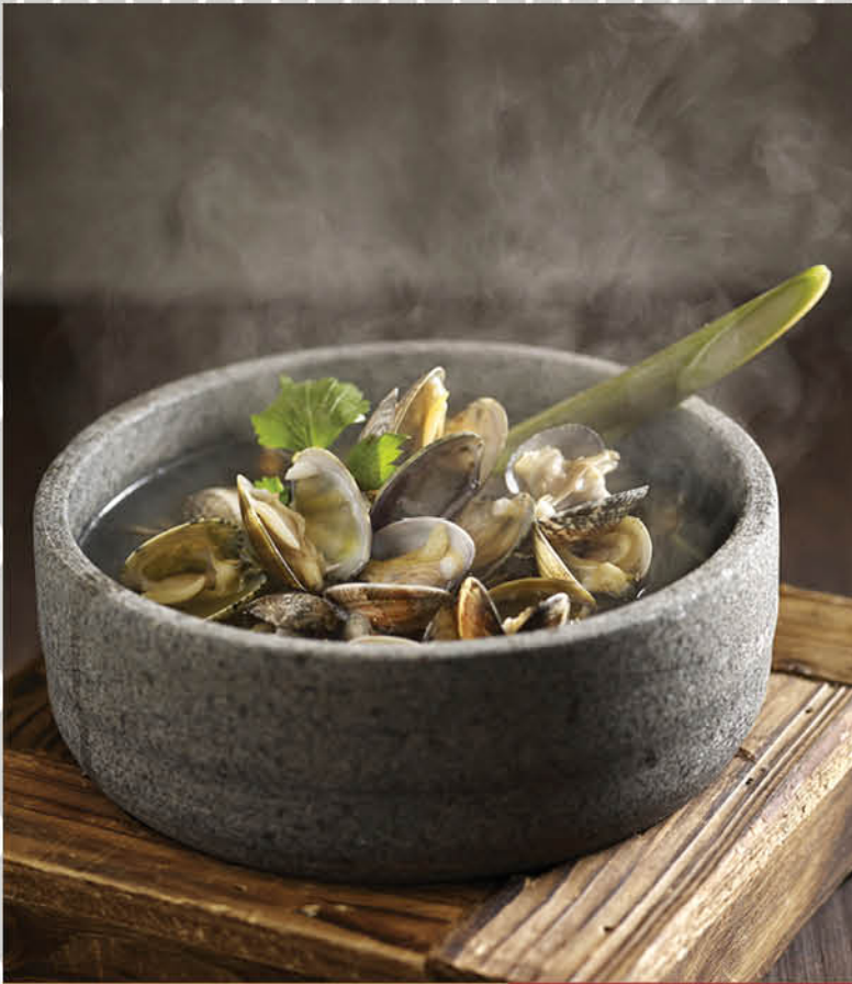
黄酒煲花蛤 Venus Clam Poached with Chinese Wine in Claypot (小S)