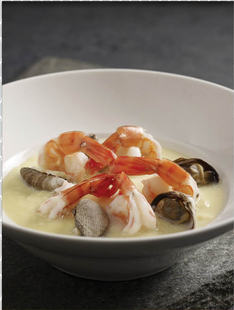
小鲜蒸蛋豆腐 Steamed Egg Tofu with Seafood (小S)