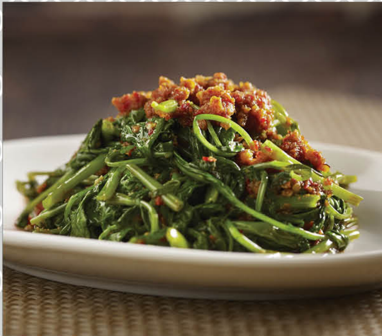
三芭炒 Sautéed with Sambal