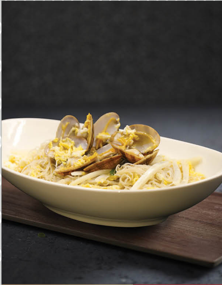
啦啦白米粉 Sautéed Bee Hoon with 'Venus Clam' (小S)