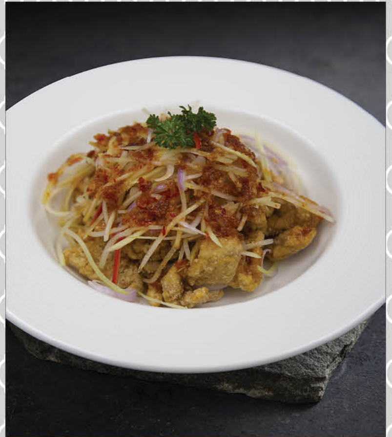
泰式炸鸡柳 Deep-Fried Slice Chicken with Thai Style (小S)