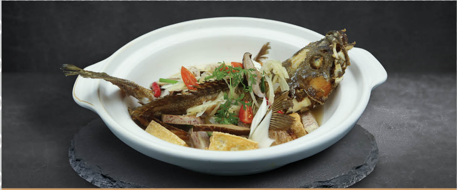
潮式生焗 Stewed in Teochew Style