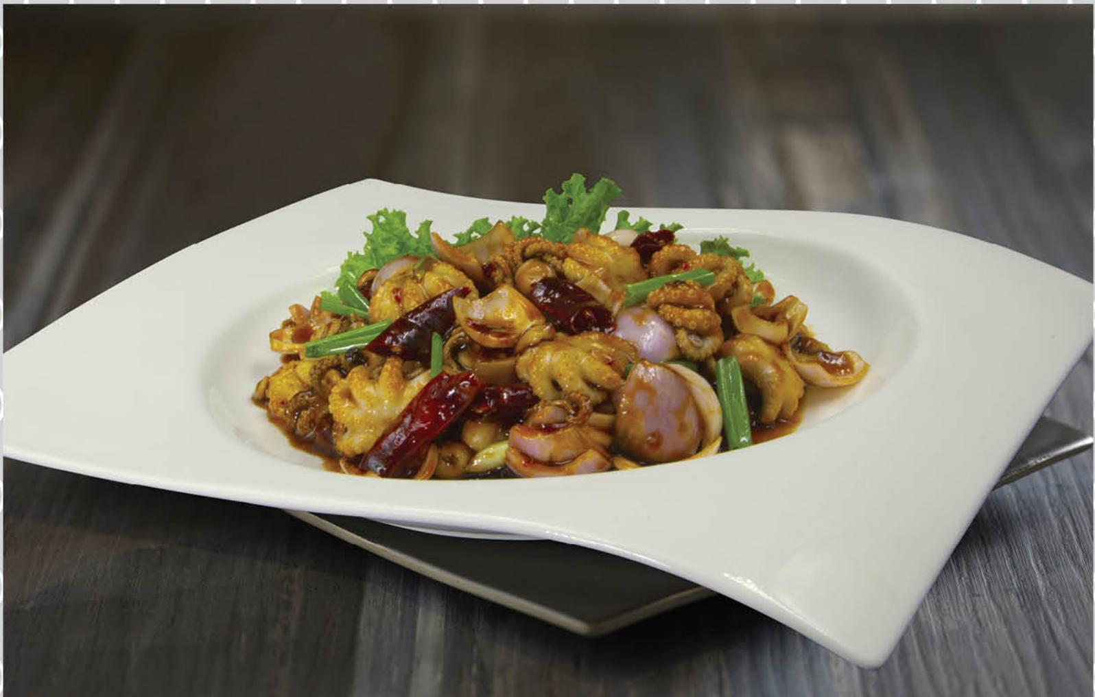
宫保爆炒小八爪鱼 GongBao Sauce Fried Baby Octopus