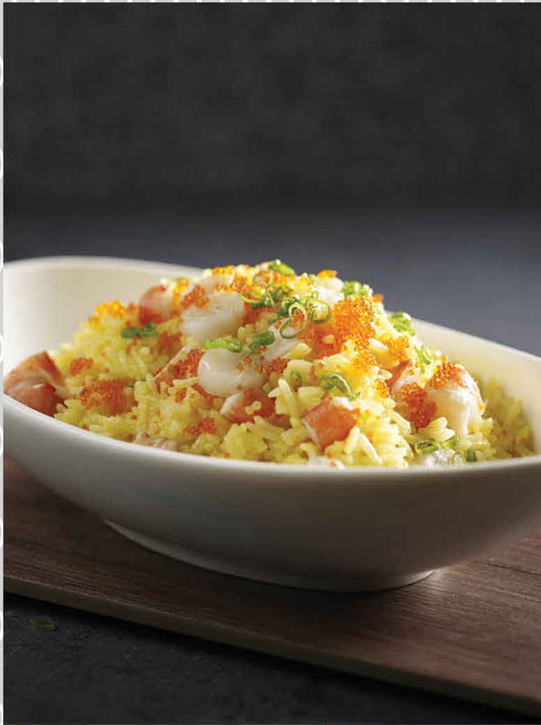
海鲜皇炒饭 Supreme Seafood Fried Rice (小S)