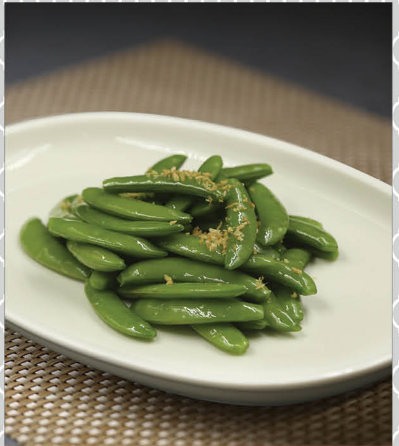
蒜茸炒甜豆 Sautéed with Sweet Pea Minced Garlic (小S)