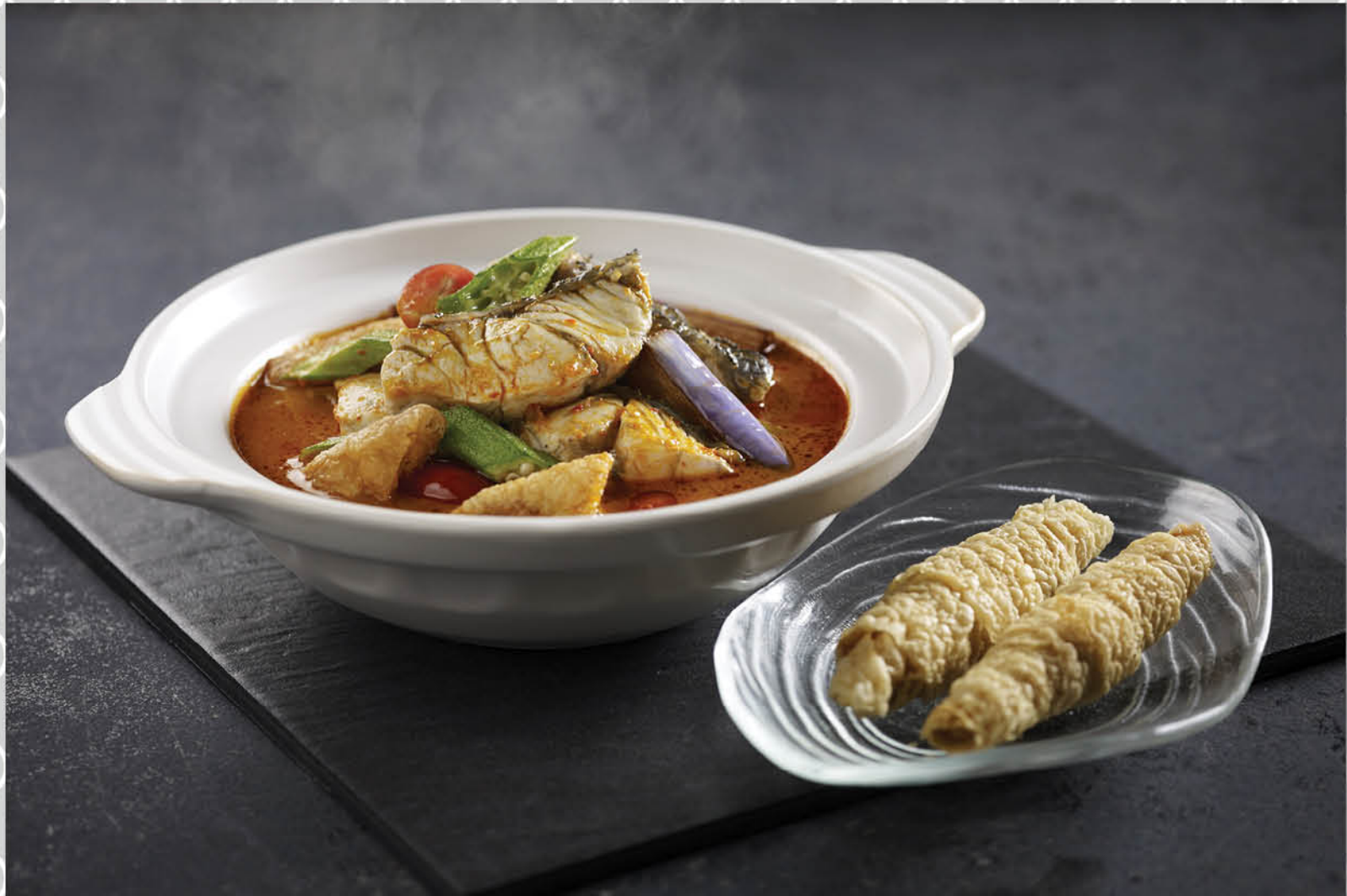
咖哩煲石斑鱼 Stewed Garoupa with Curry in Claypot (小 S)