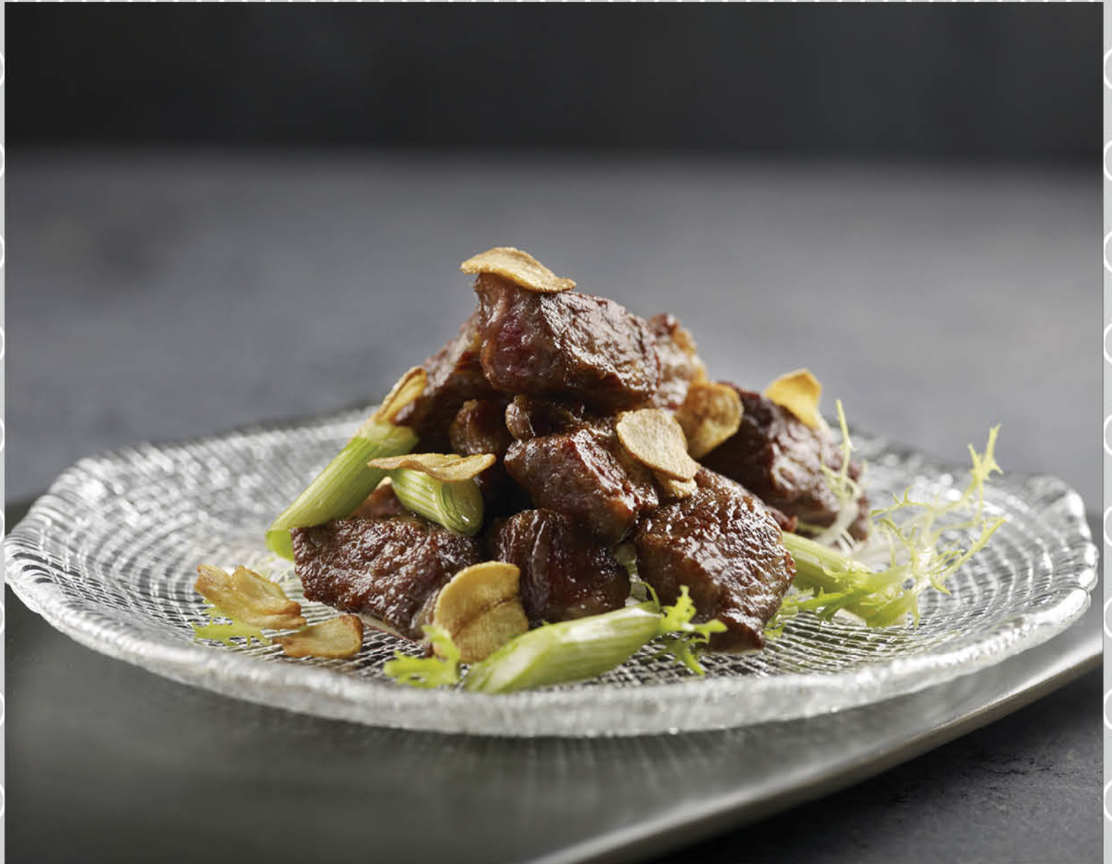
澳洲和牛粒炒鹅肝酱 Sautéed Australian Beef Cubes with Foie Gras Pâté (小S)