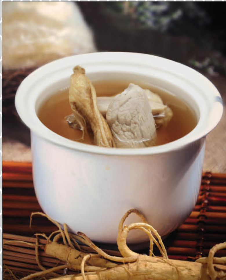
人参炖菜园鸡汤 (位上) Double-Boiled Coquelet Chicken with Chicken Soup