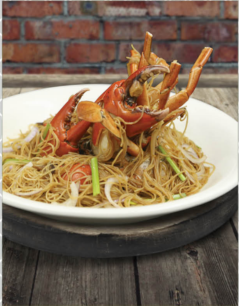
焖米粉 Wok-Fried with Bee Hoon