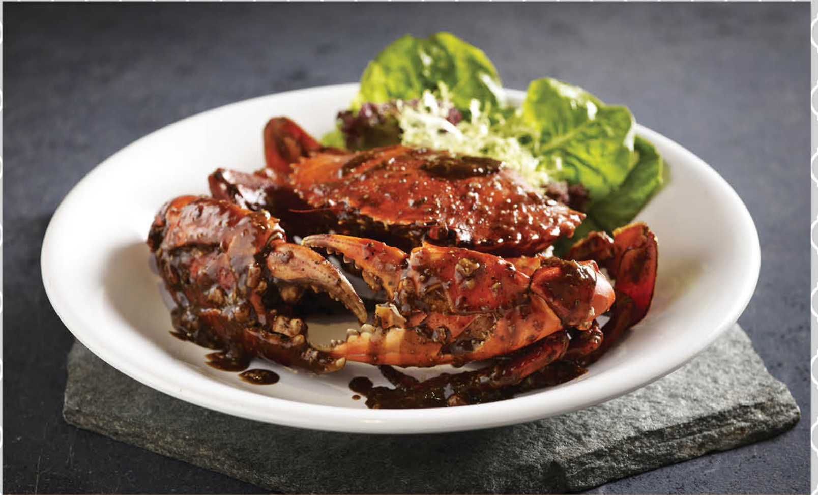
炒黑胡椒 Black Pepper