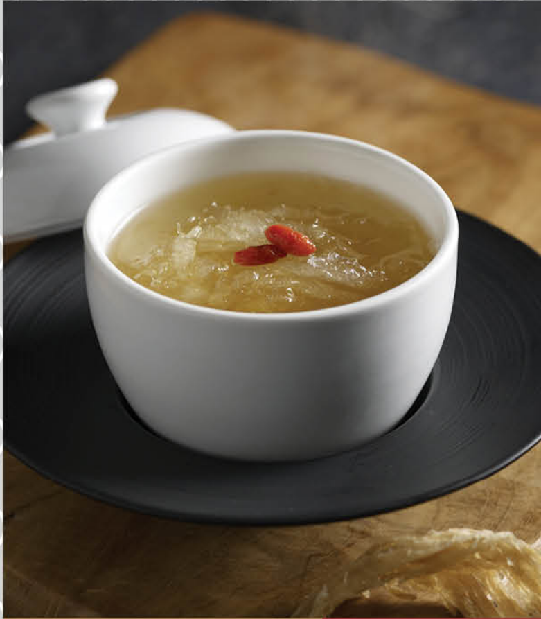
桂圆炖燕窝 Double-Boiled Bird's Nest in Dried Longan Soup