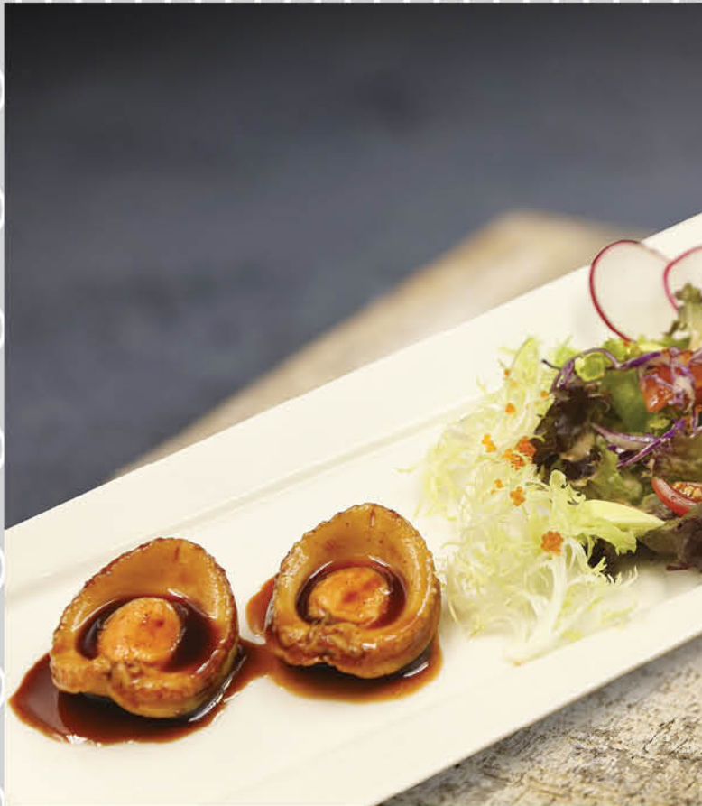
鱼香煎十头鲍鱼 1份(2粒) 10-Head Abalone Grilled with Fish Sauce