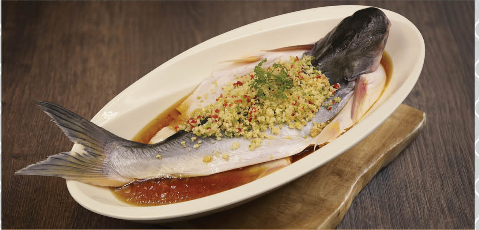
师父蒸 Steamed with Signature Chef's Sauce (Minced Garlic and Ginger)