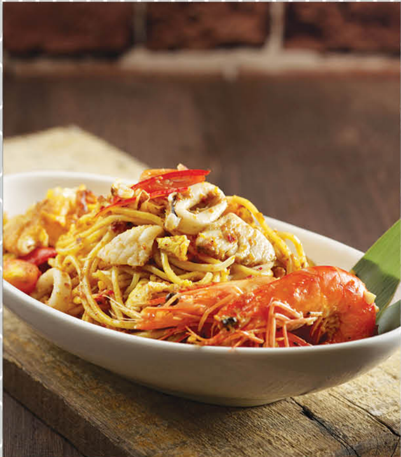
马来炒面 Sautéed Yellow Noodle with Seafood in Malay Style (小S)