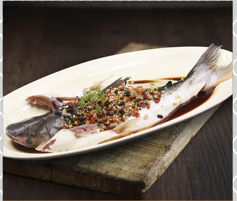
豉汁蒸 Steamed with Black Bean Sauce