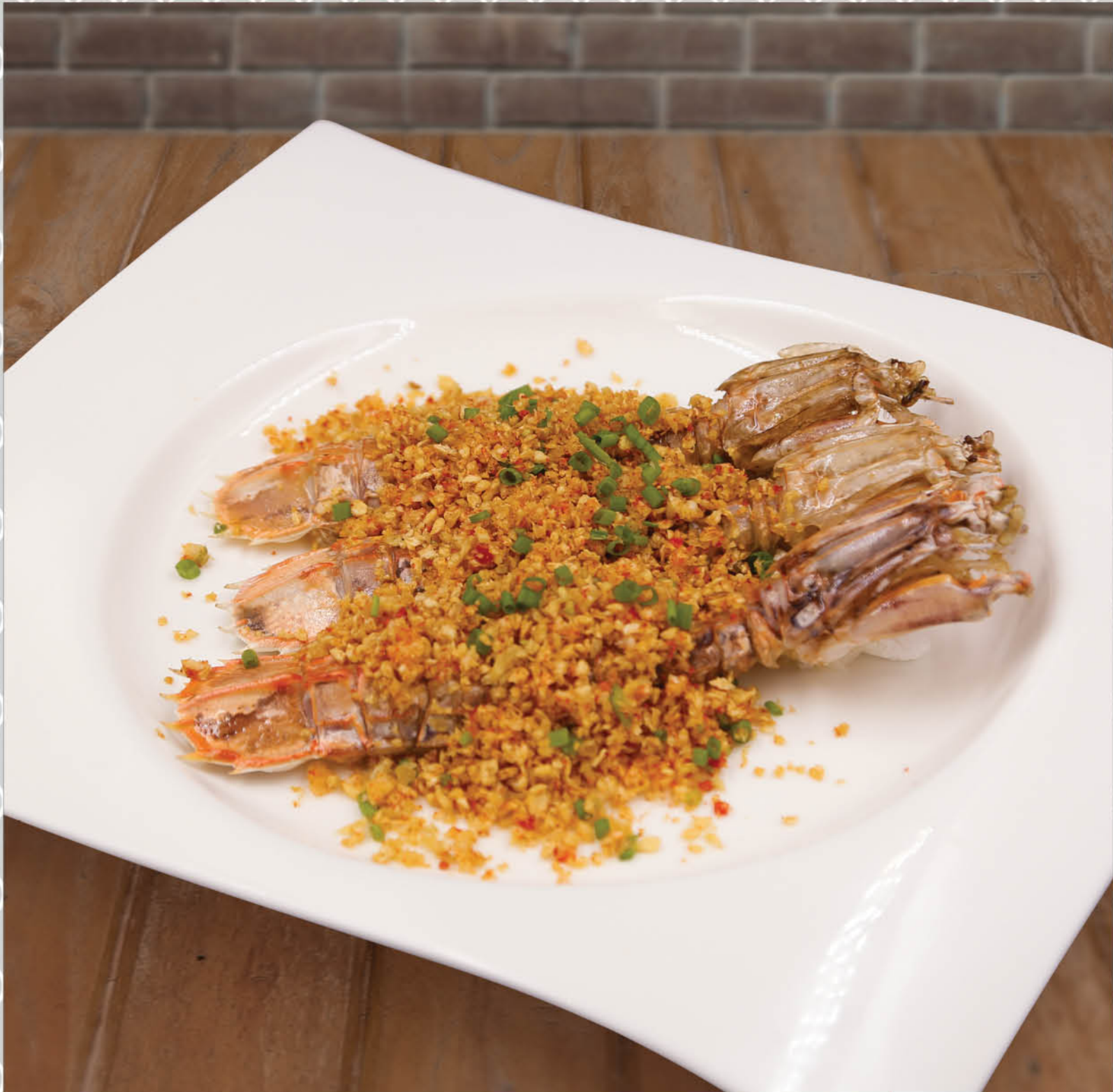
蒜香椒盐焗 Deep-Fried Minced Garlic with Salt And Pepper