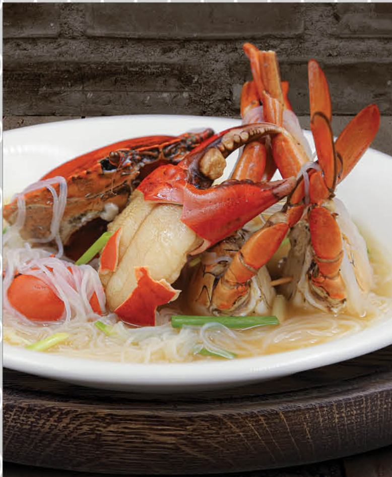
上汤焗冬粉 Stewed Glass Noodle with Superior Stock