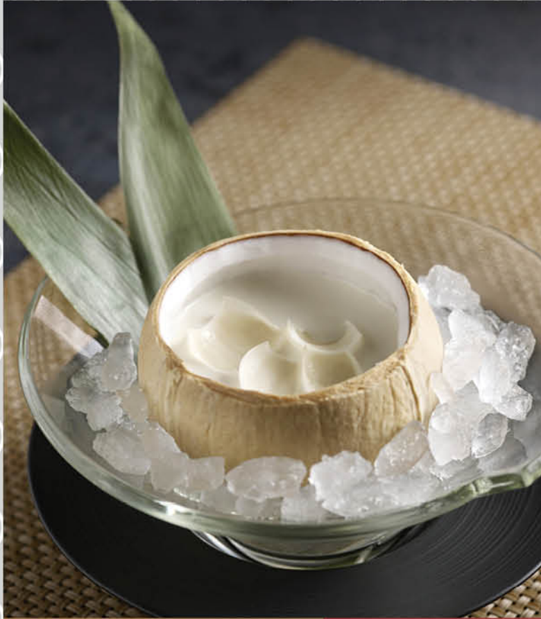
杏仁汁炖椰皇鲜百合 (冷/热) Double-Boiled Coconut Flesh and Lily Buld in Almond Paste (Cold/Warm)