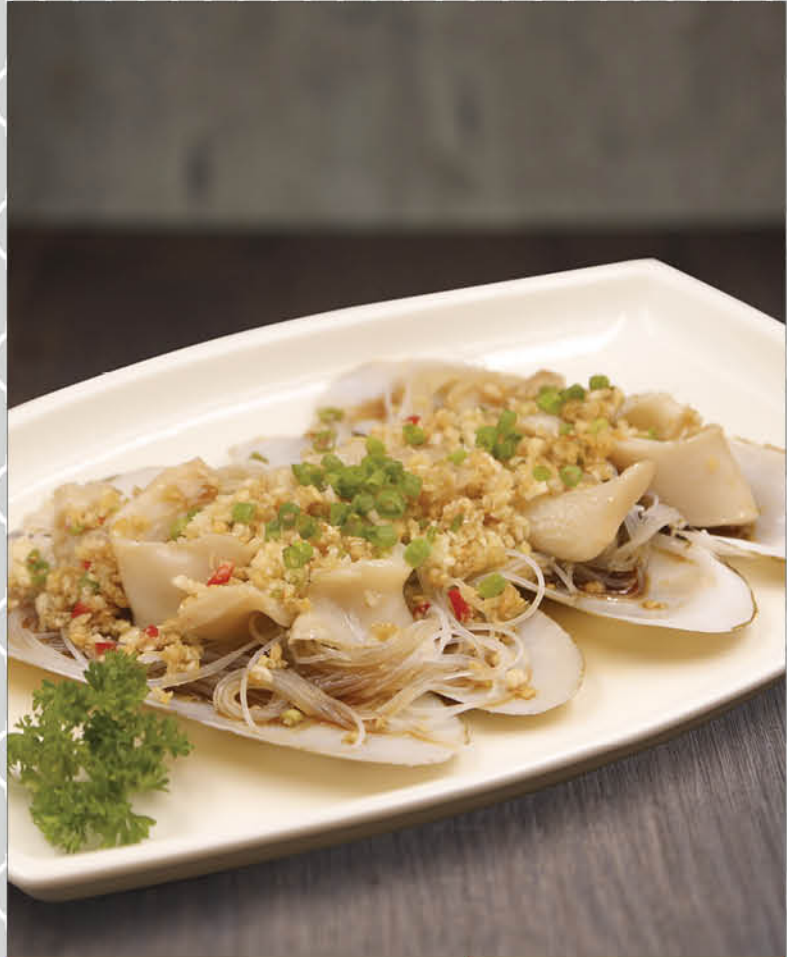
蒜茸蒸圣子蚌 Live Bamboo Clam Steamed with Minced Garlic