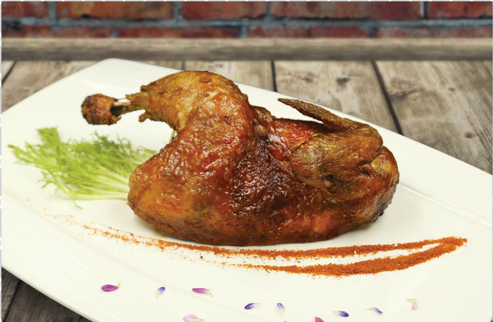
椒盐甘榜烧鸡 Crispy Roasted Chicken with Salt and Pepper

24,800 MMK 半只 (HALF) 51,600 MMK 一只 (WHOLE)