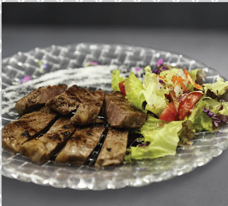
海盐煎澳洲肥牛 Pan-Fried Australia Beef Fillet Seasoned with Sea Salt (小S)