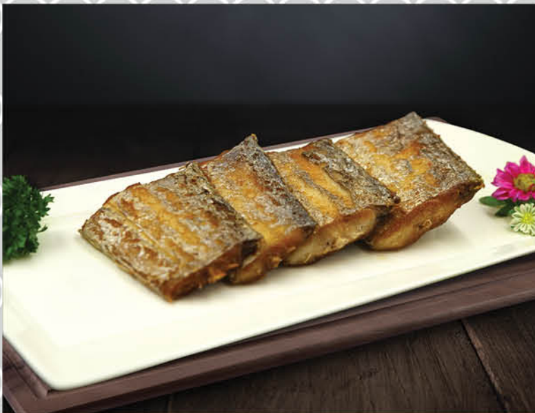
带鱼 Crisp-Fried Cutlassfish